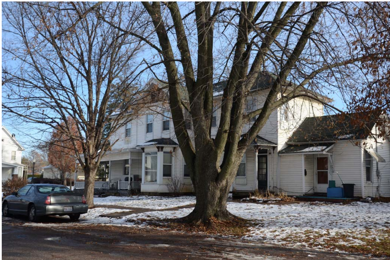
Photograph 92-00368-003 - House, looking northeast (December 2014)