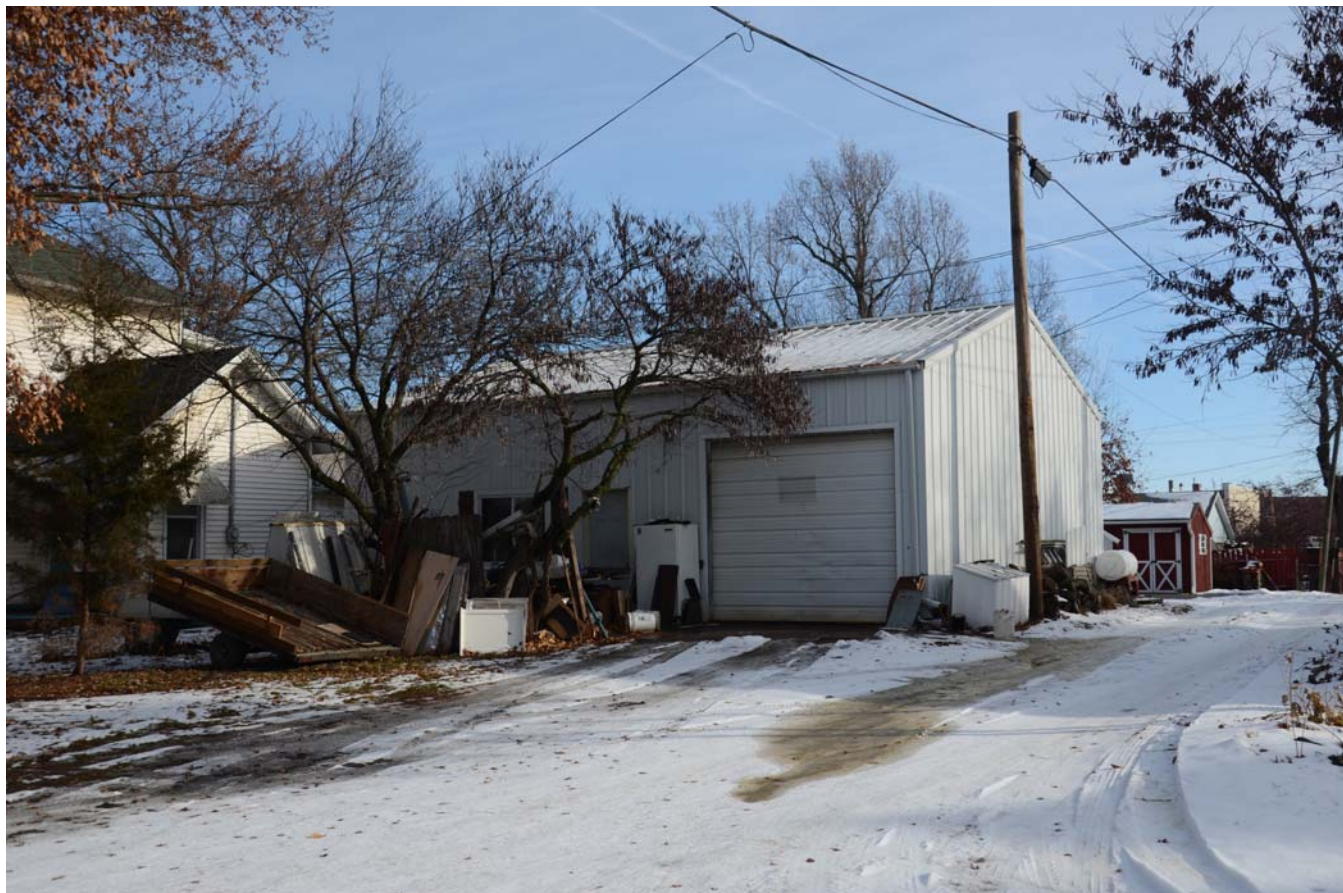
Photograph 92-00368-004 - Garage, looking northeast (December 2014)