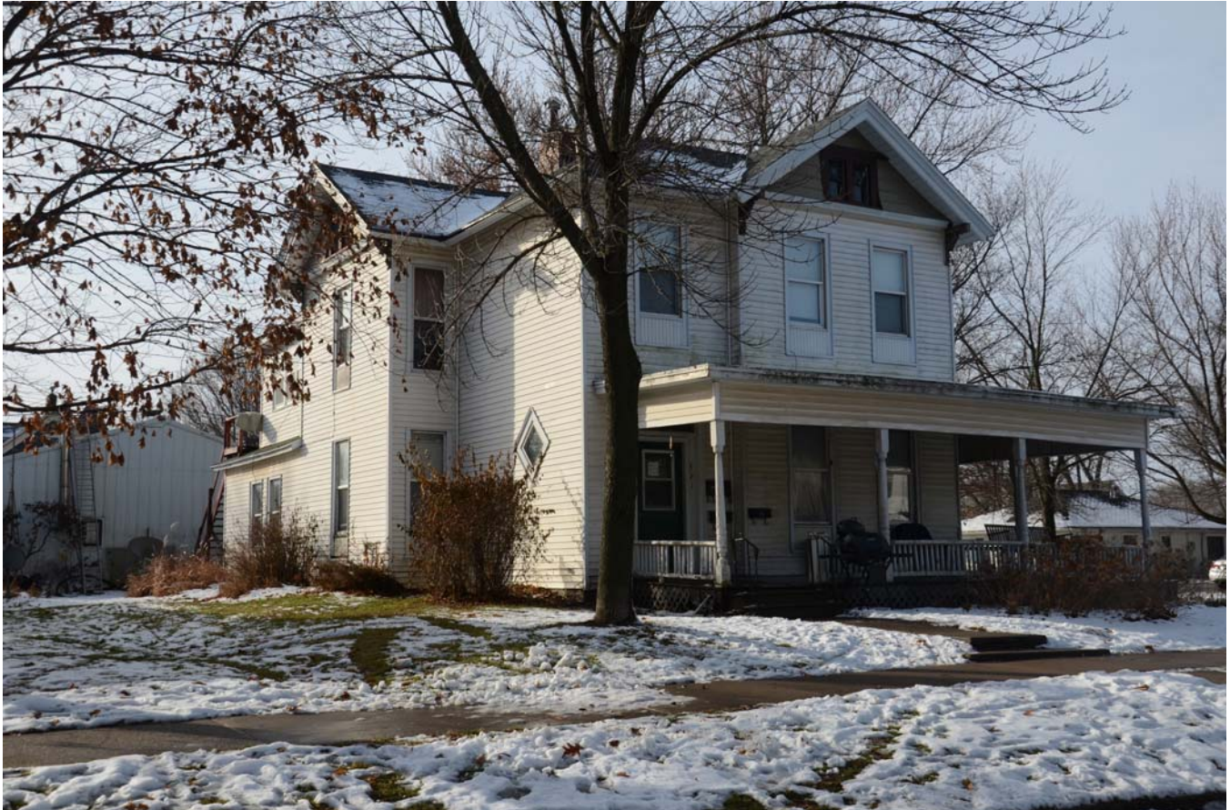
Photograph 92-00368-002 - House, looking southwest (December 2014)