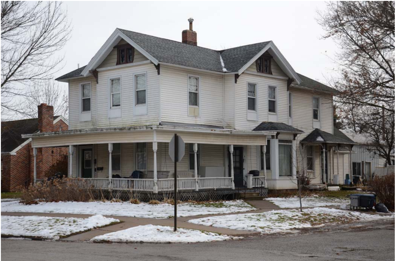
Photograph 92-00368-001 - House, looking southeast (December 2014)