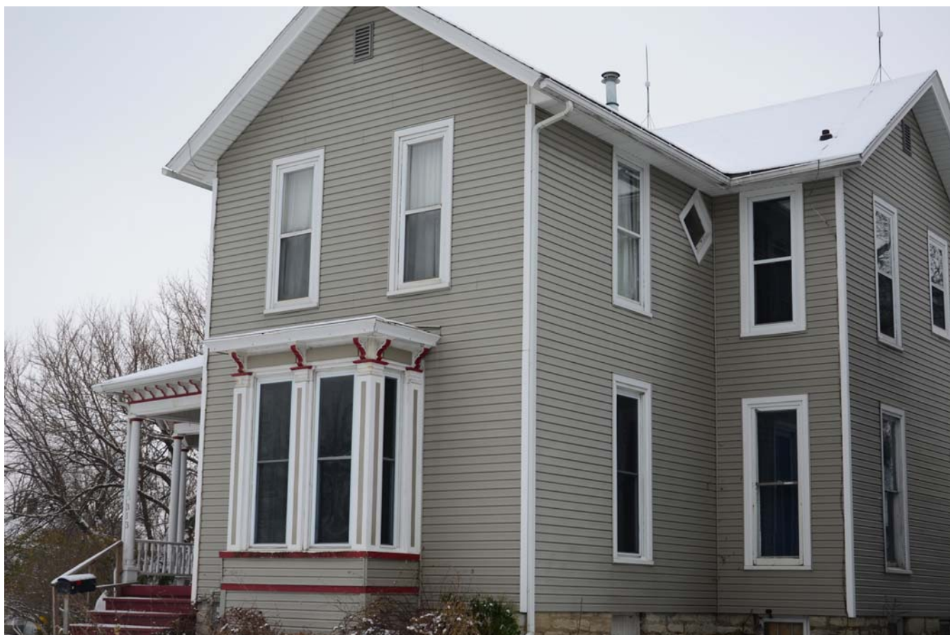
Photograph 92-00420-001 - House, looking southeast (December 2014)