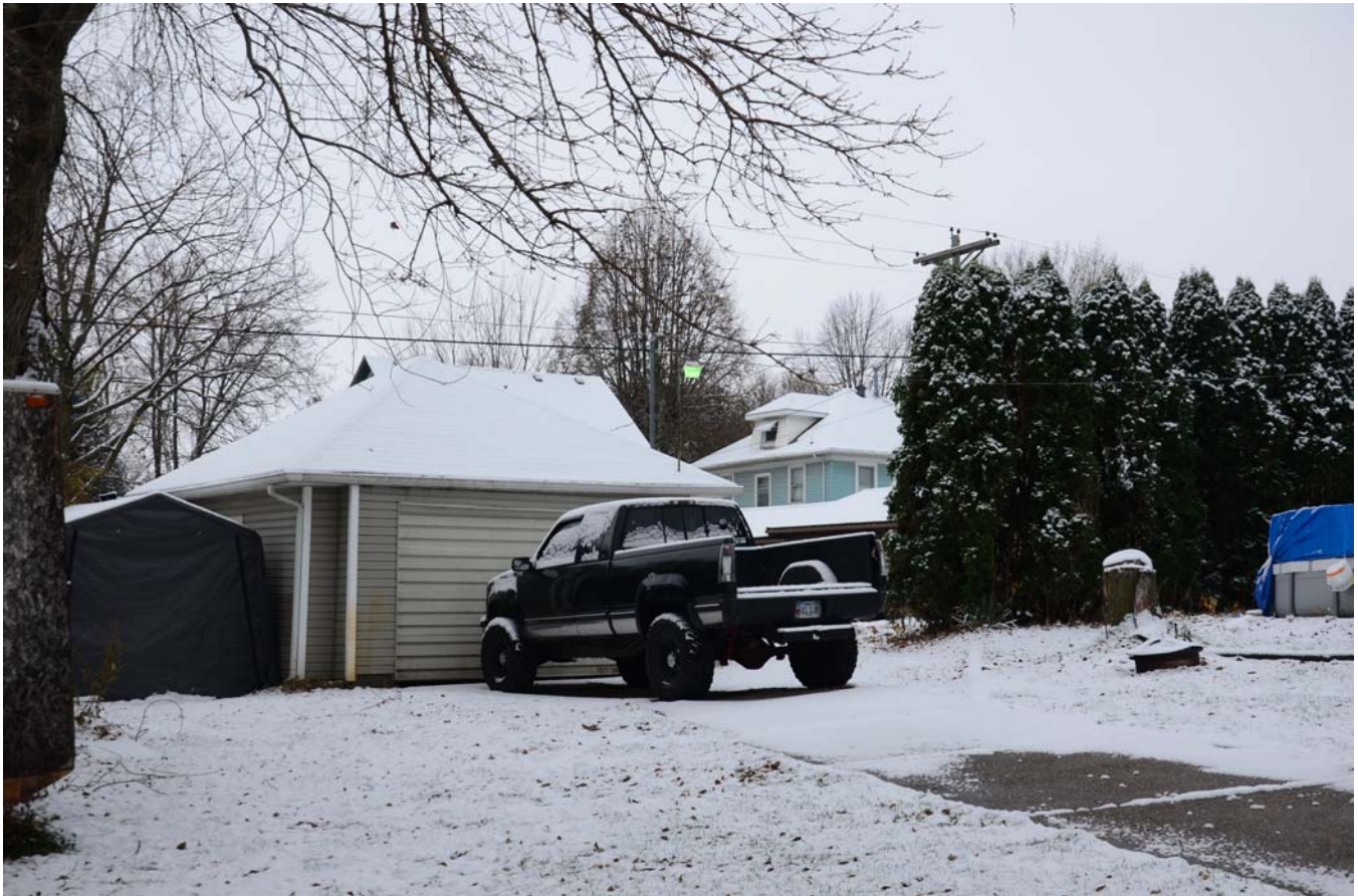
Photograph 92-00420-005 - Garage, looking southwest (December 2014)