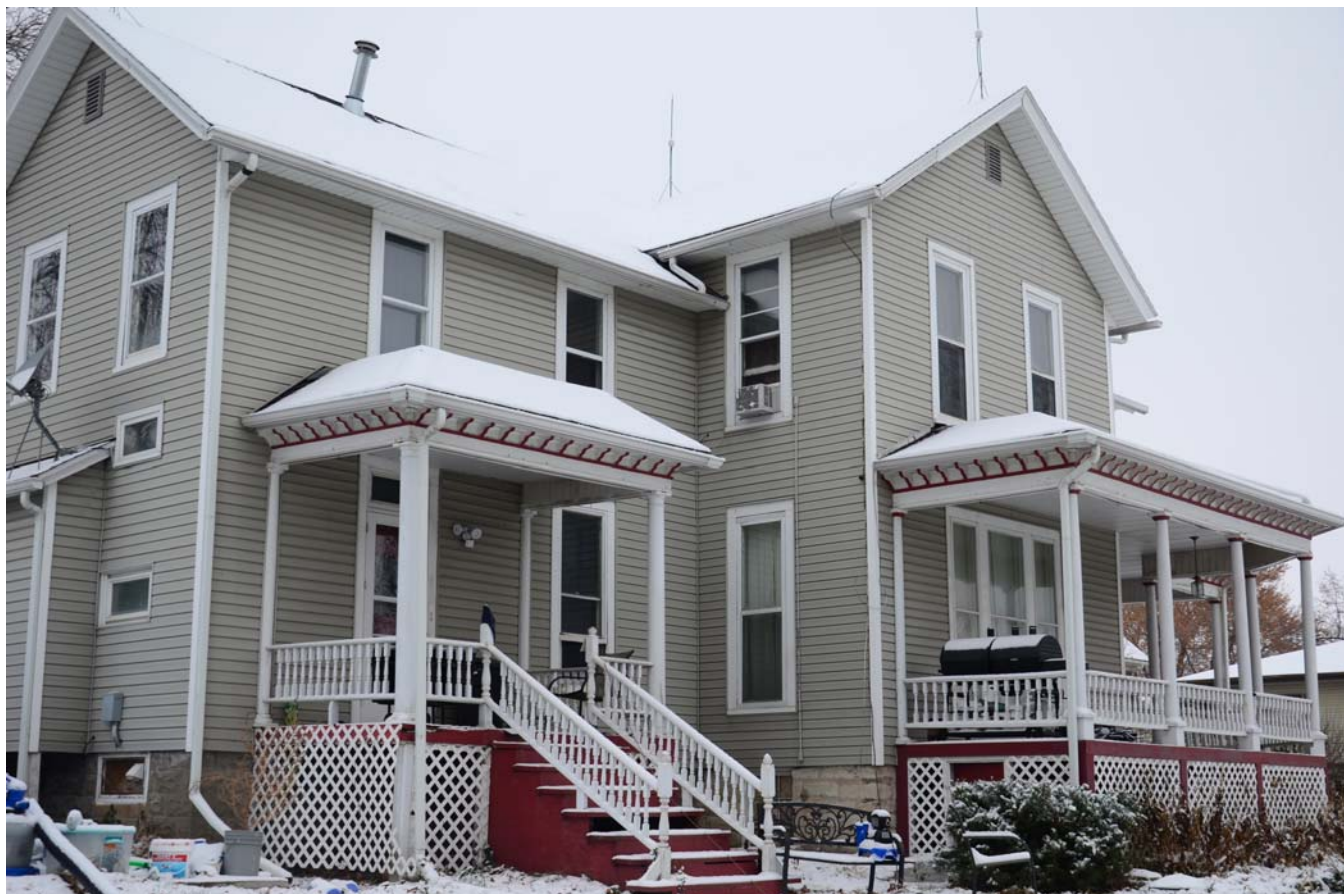
Photograph 92-00420-003 - House, looking northwest (December 2014)