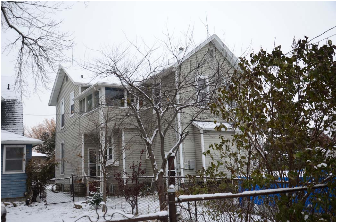
Photograph 92-00420-004 - House, looking northeast (December 2014)