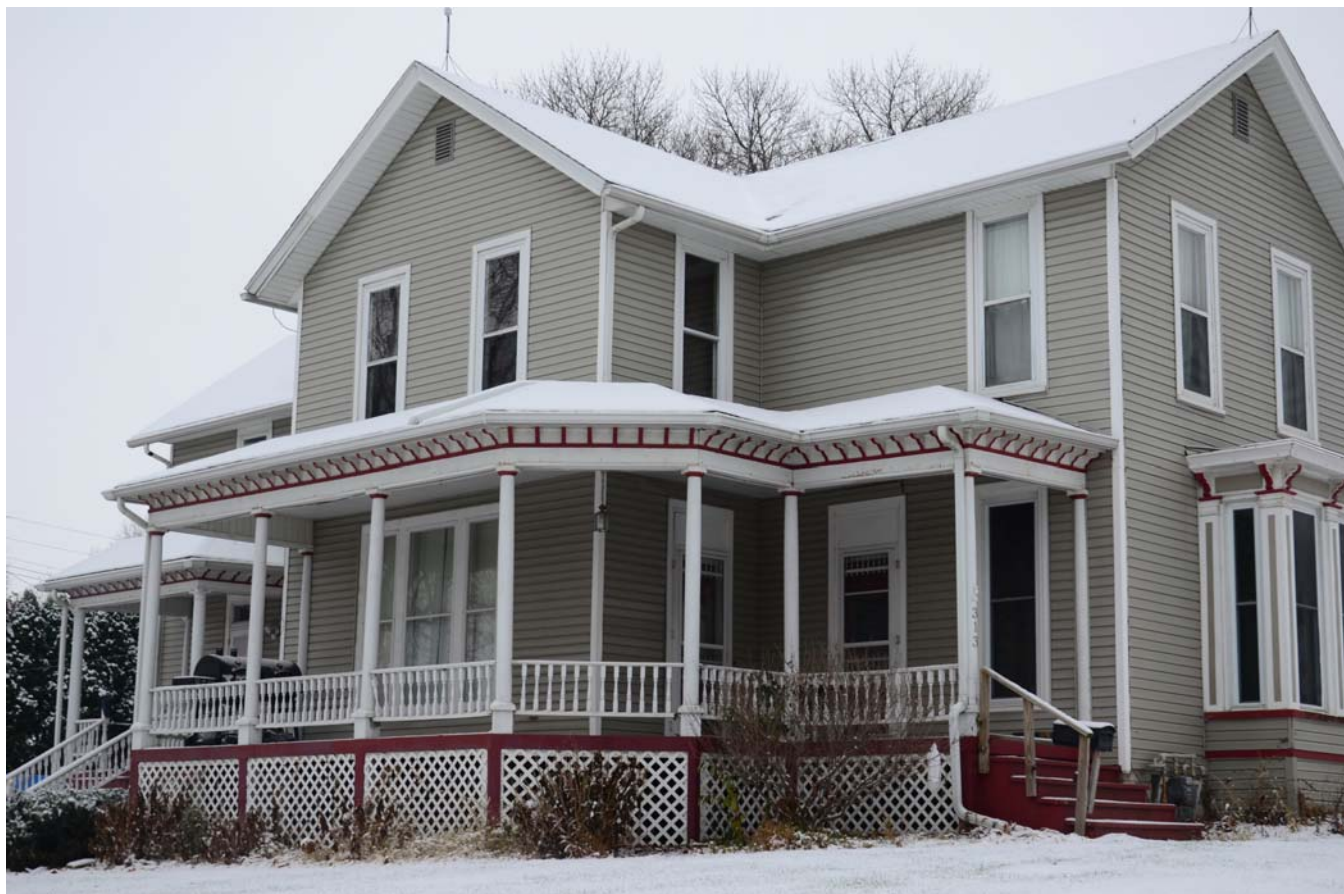
Photograph 92-00420-002 - House, looking southwest (December 2014)