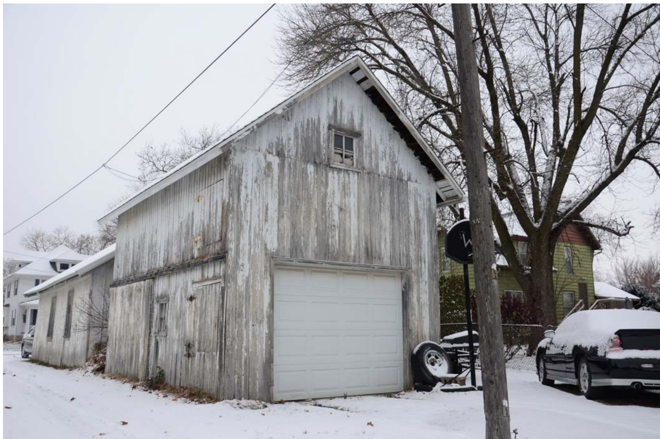
Photograph 92-00421-003 - Garage, looking northwest (December 2014)