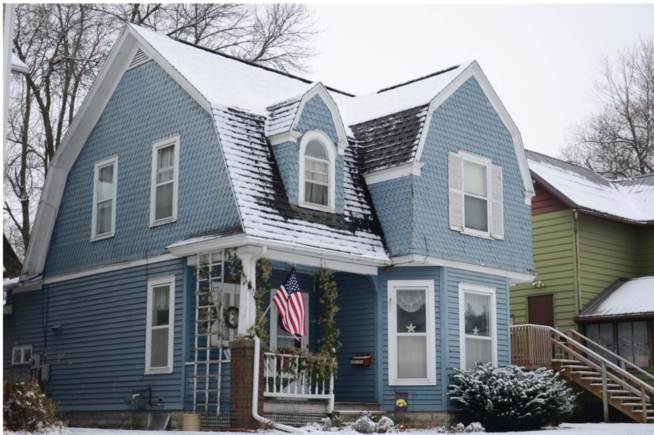
Photograph 92-00421-001 - House, looking southwest (December 2014)