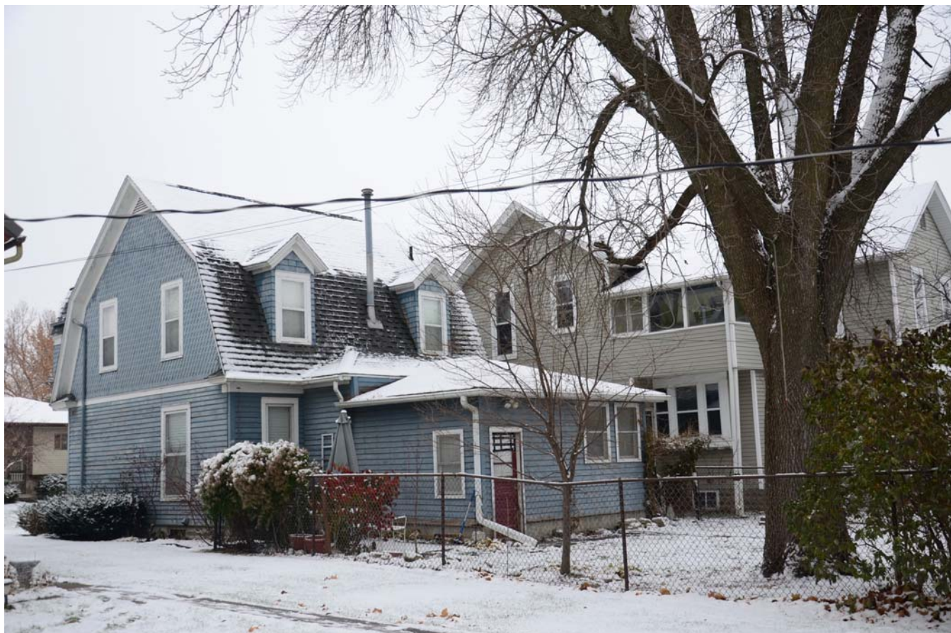
Photograph 92-00421-002 - House, looking northeast (December 2014)