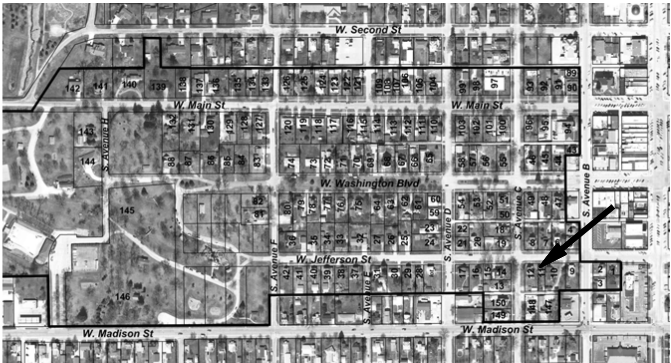
2009 aerial photograph (Washington County) – line indicates survey/research area boundary