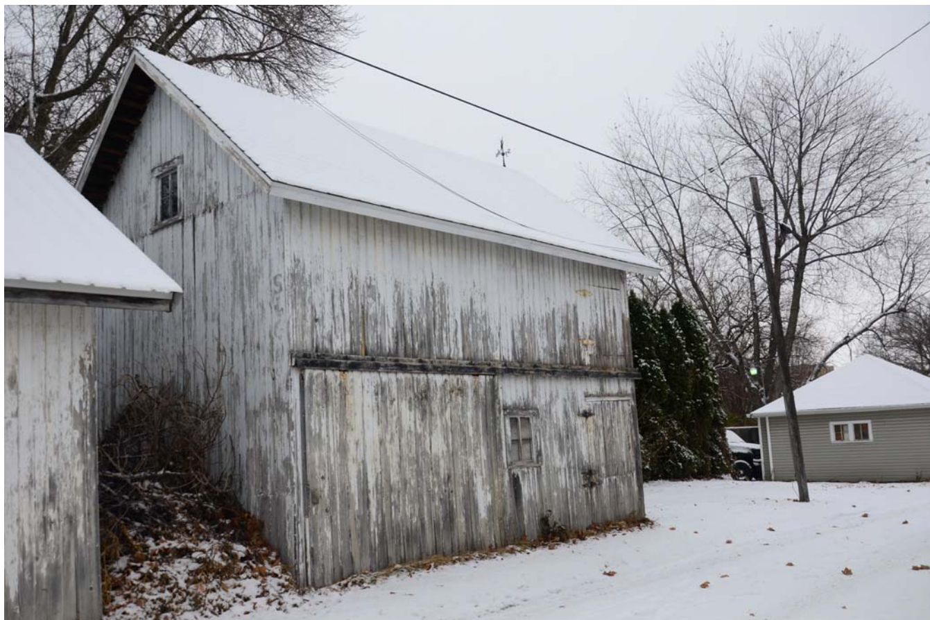
Photograph 92-00421-004 - Garage, looking northeast (December 2014)