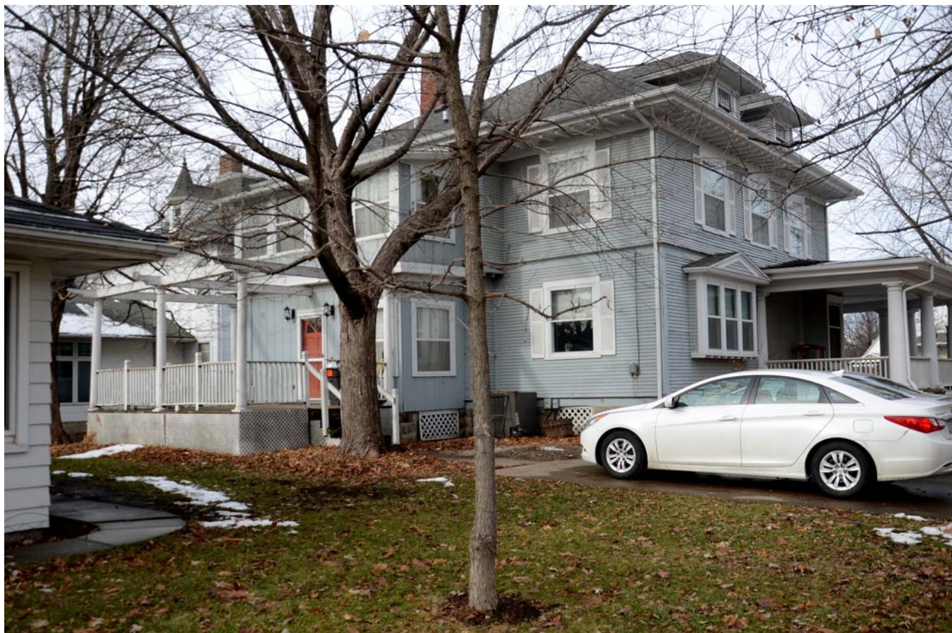
Photograph 92-00369-003 - House, looking northwest (December 2014)