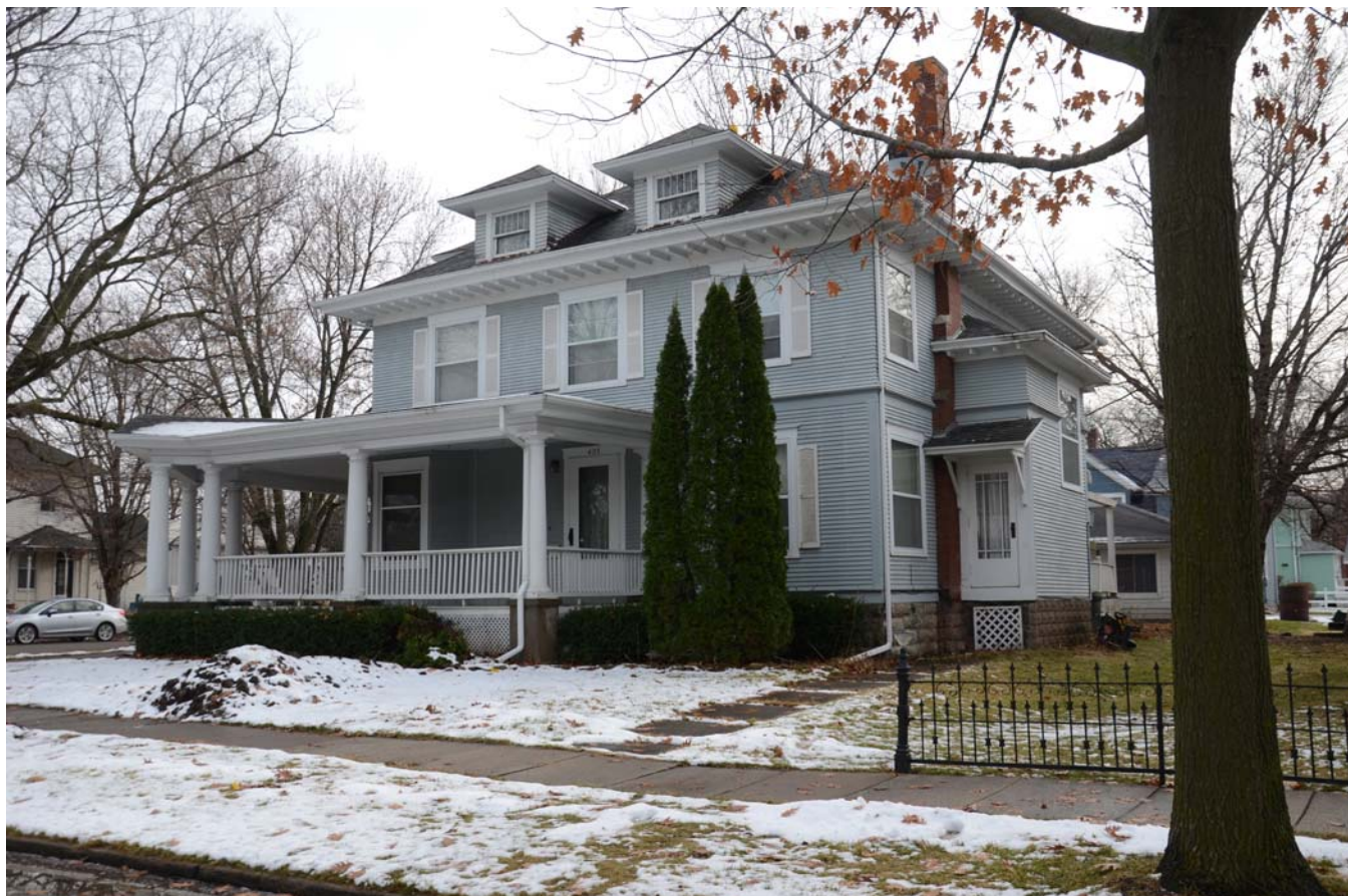
Photograph 92-00369-002 - House, looking southeast (December 2014)