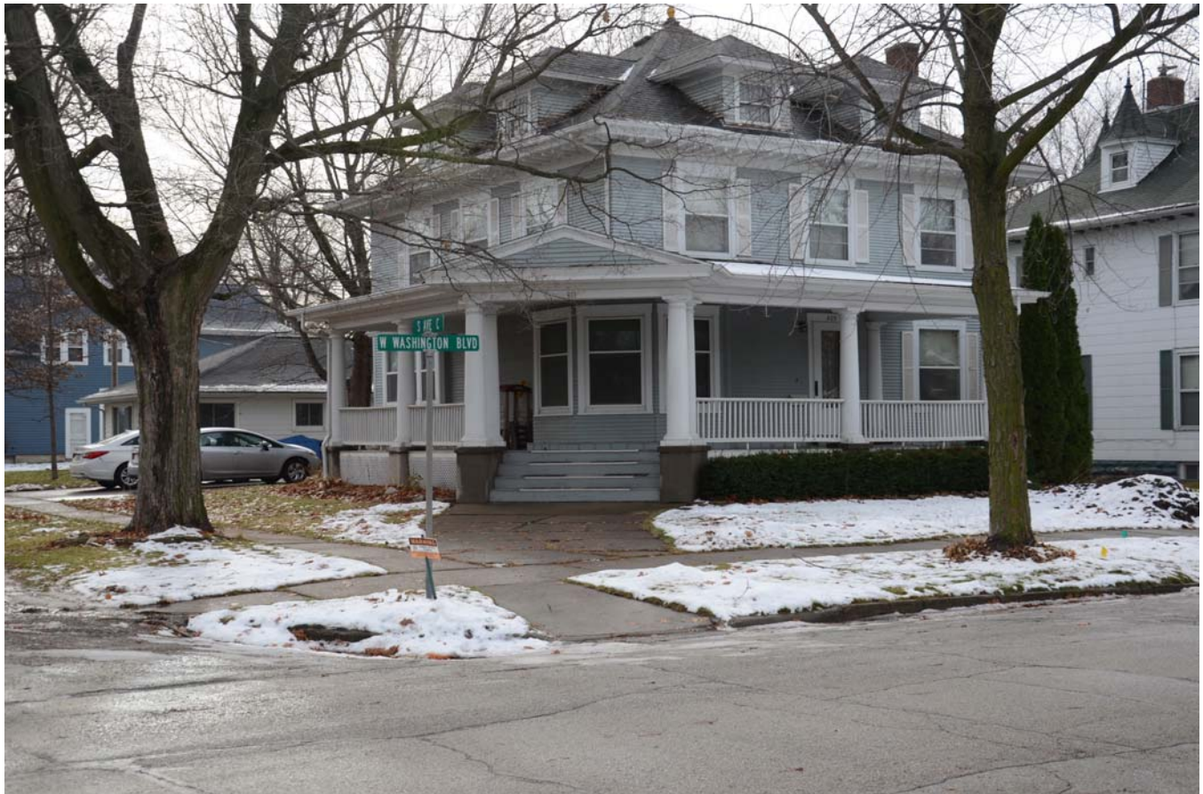
Photograph 92-00369-001 - House, looking southwest (December 2014)