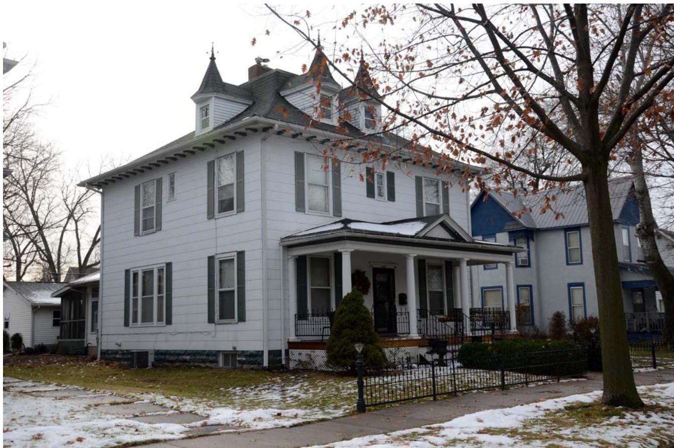
Photograph 92-00370-001 - House, looking southwest (December 2014)