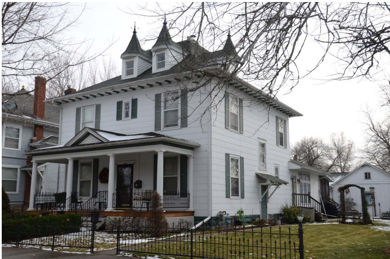
Photograph 92-00370-002 - House, looking southeast (December 2014)