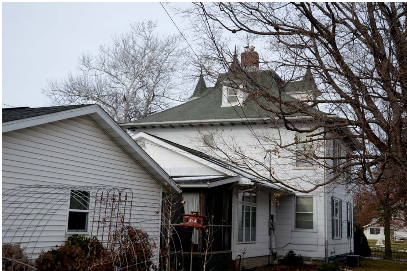
Photograph 92-00370-003 - House, looking north (December 2014)