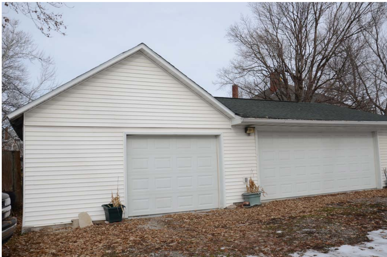
Photograph 92-00370-004 - Garage, looking north (December 2014)