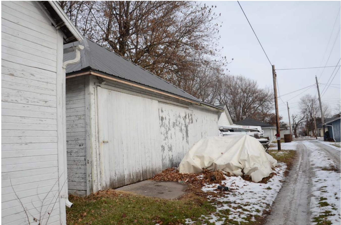
Photograph 92-00371-004 - Garage, looking northeast (December 2014)