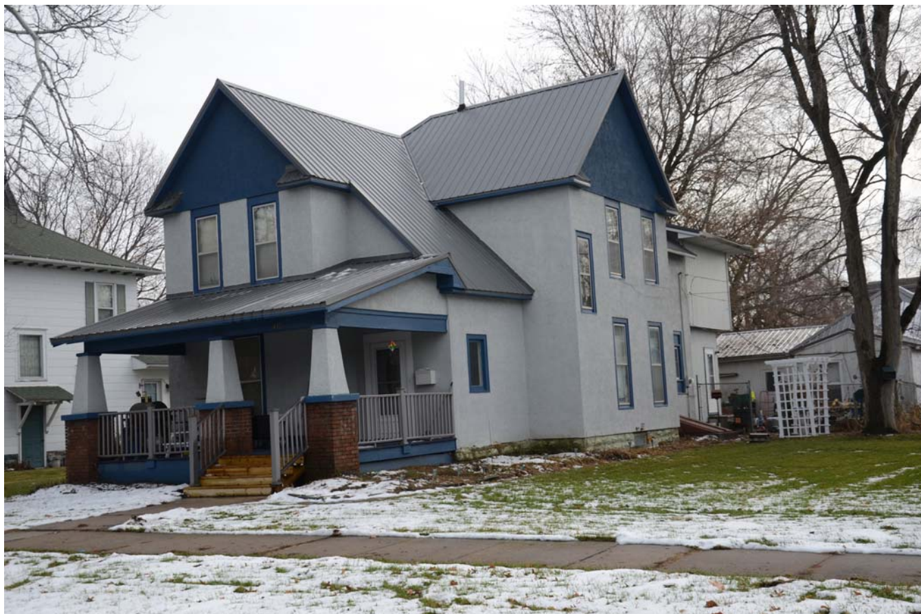
Photograph 92-00371-001 - House, looking southeast (December 2014)