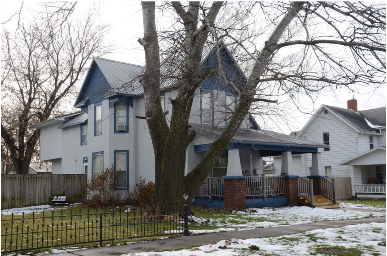
Photograph 92-00371-002 - House, looking southwest (December 2014)