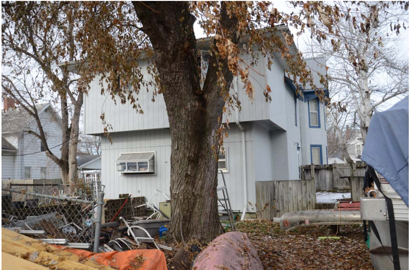
Photograph 92-00371-003 - House, looking north (December 2014)