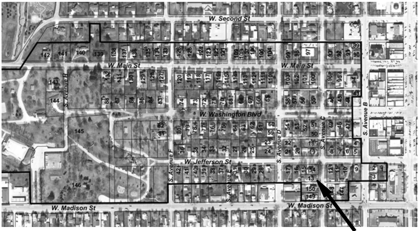
2009 aerial photograph (Washington County) – line indicates survey/research area boundary