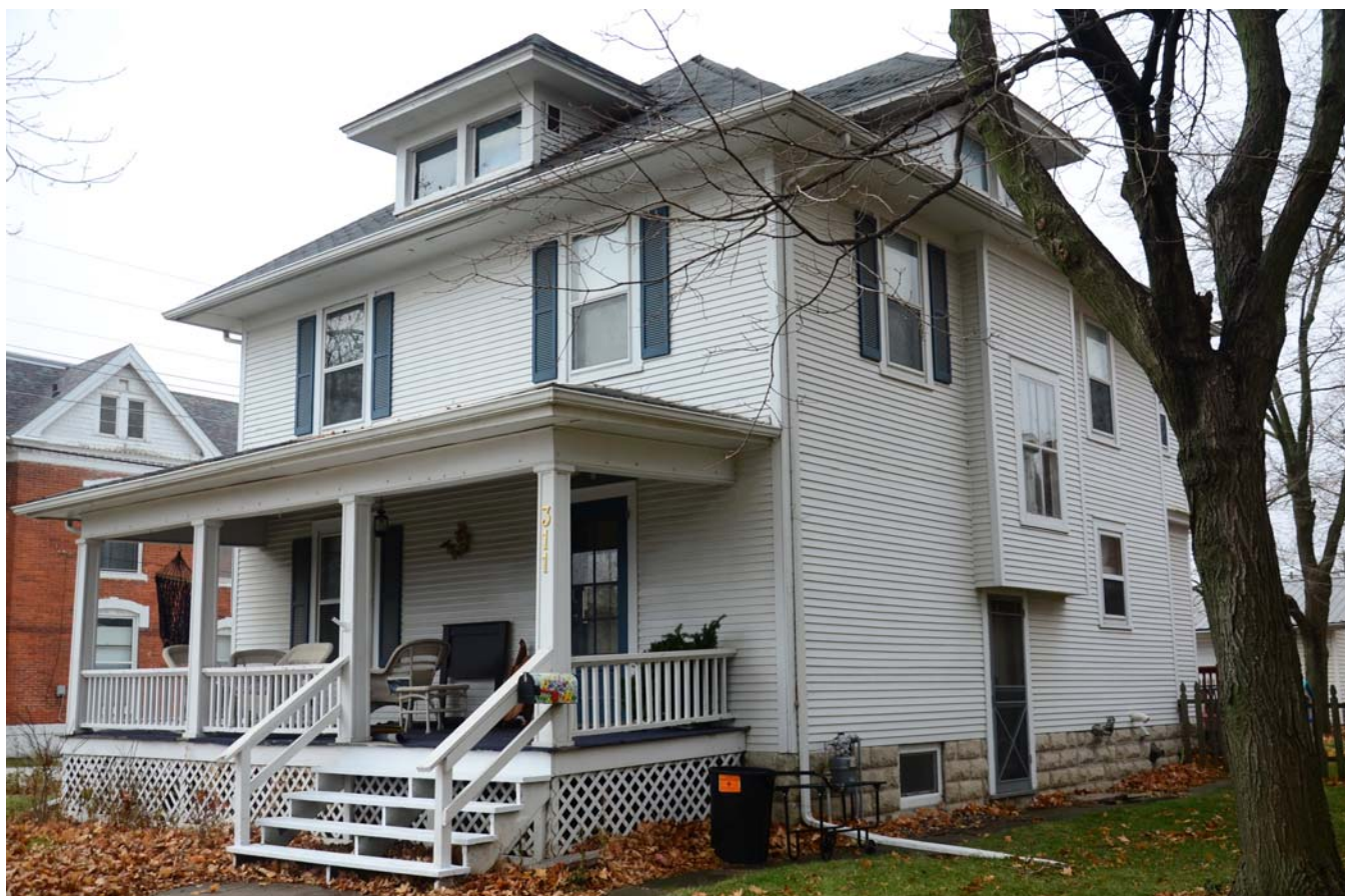
Photograph 92-00427-001 - House, looking southwest (December 2014)