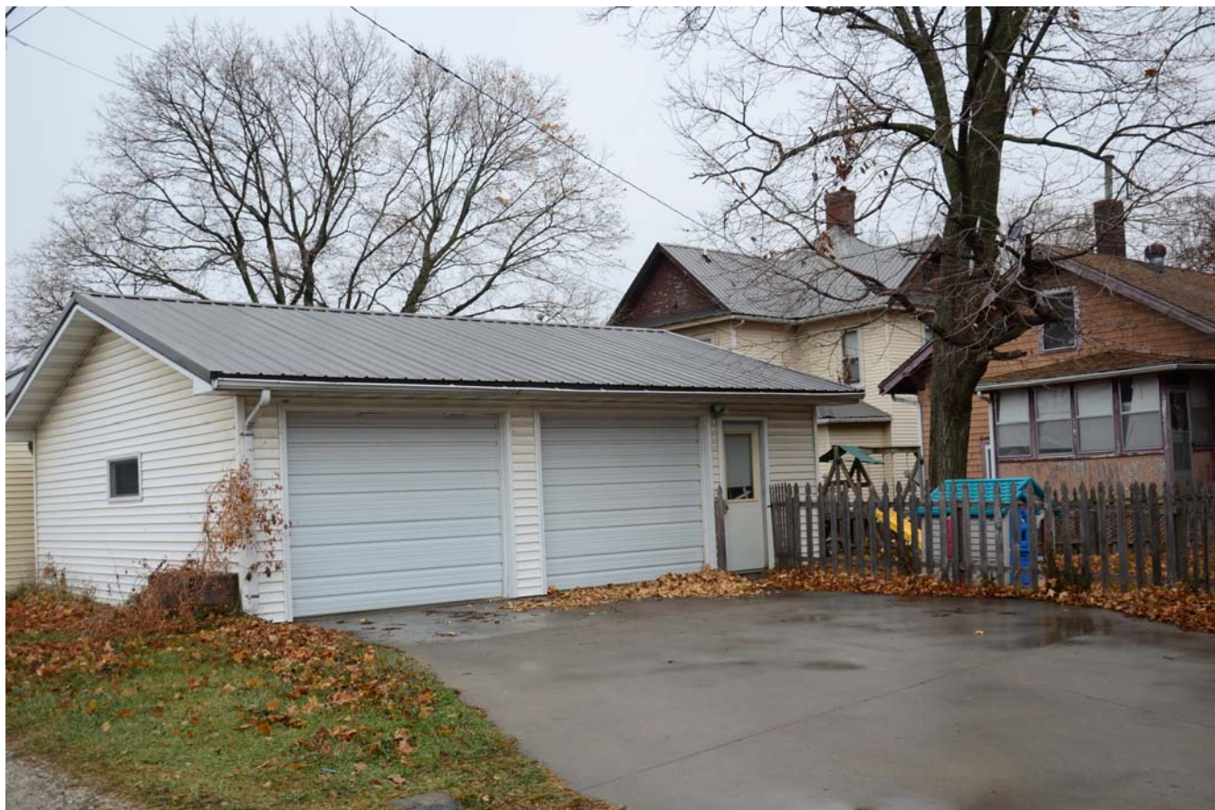
Photograph 92-00427-004 - Garage, looking northwest (December 2014)