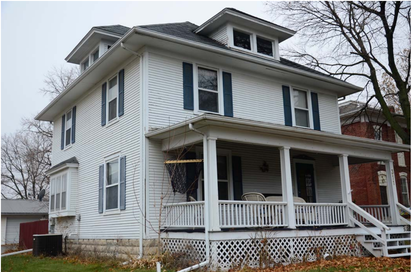
Photograph 92-00427-002 - House, looking northwest (December 2014)