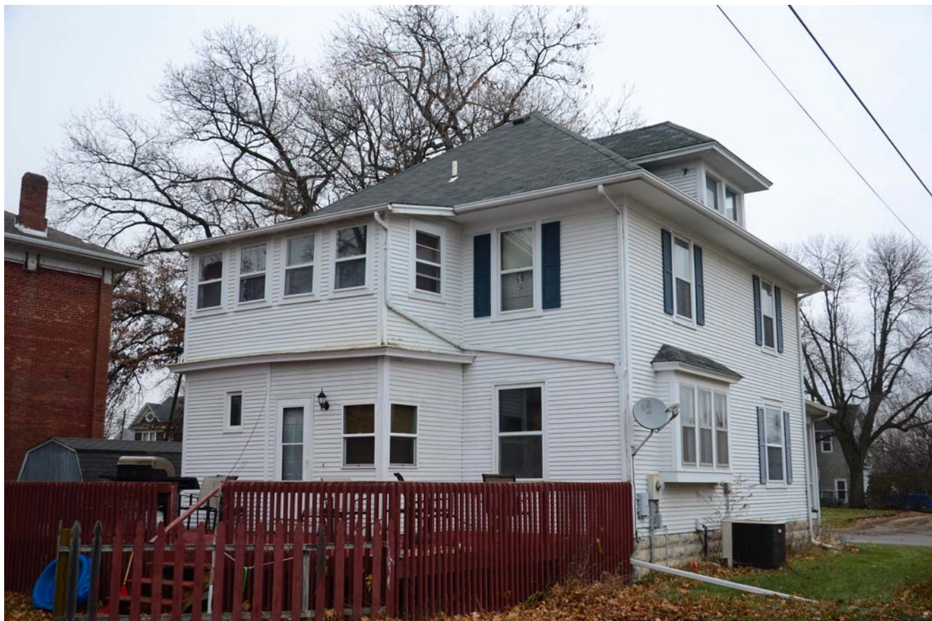
Photograph 92-00427-003 - House, looking northeast (December 2014)