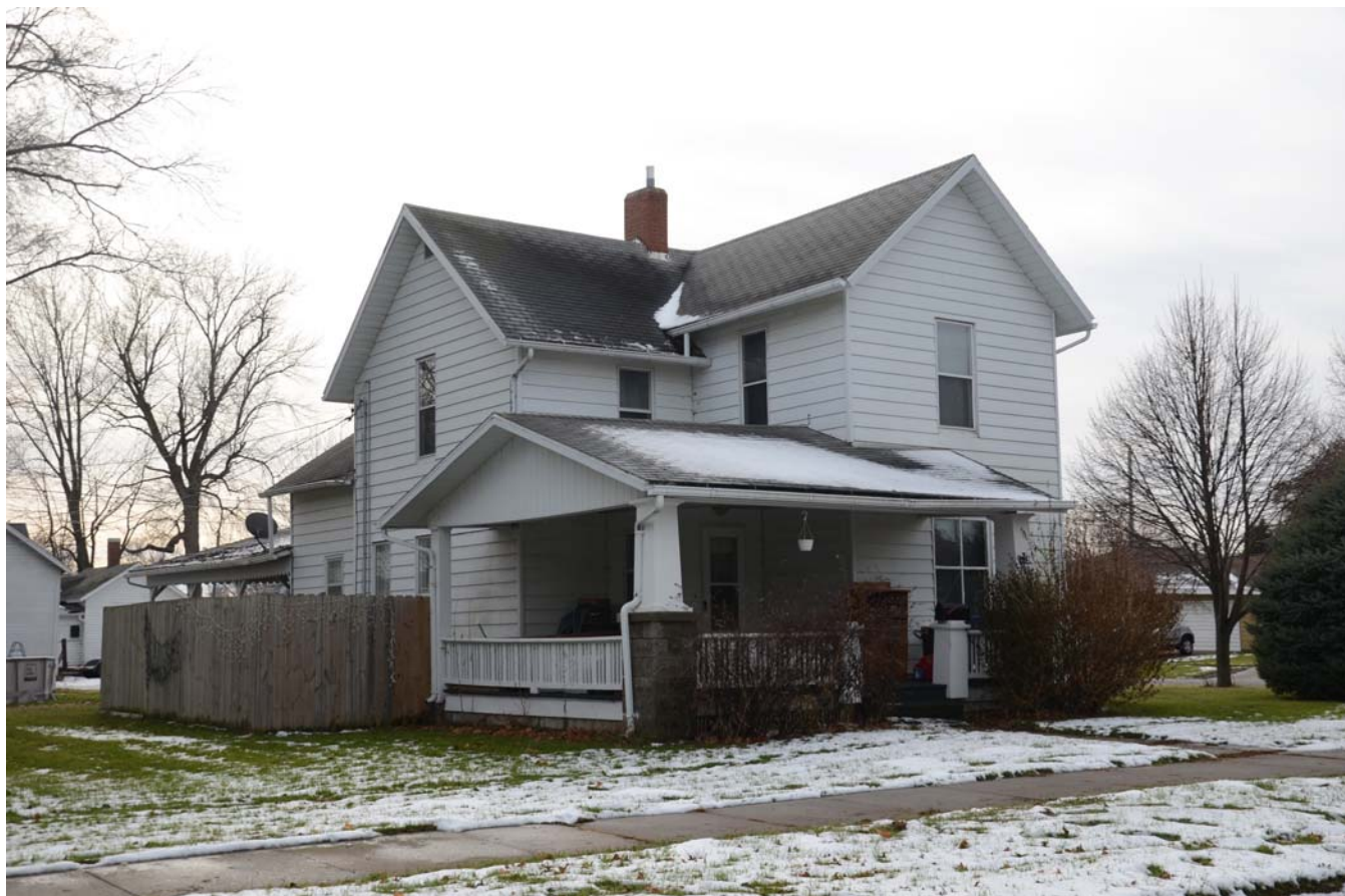
Photograph 92-00372-001 - House, looking southwest (December 2014)