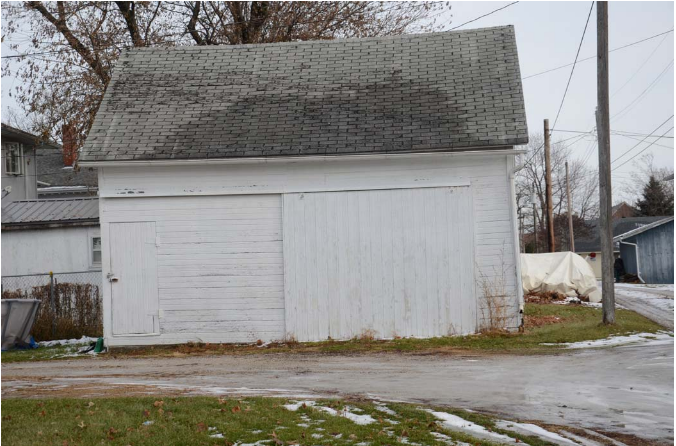
Photograph 92-00372-004 - Garage, looking east (December 2014)