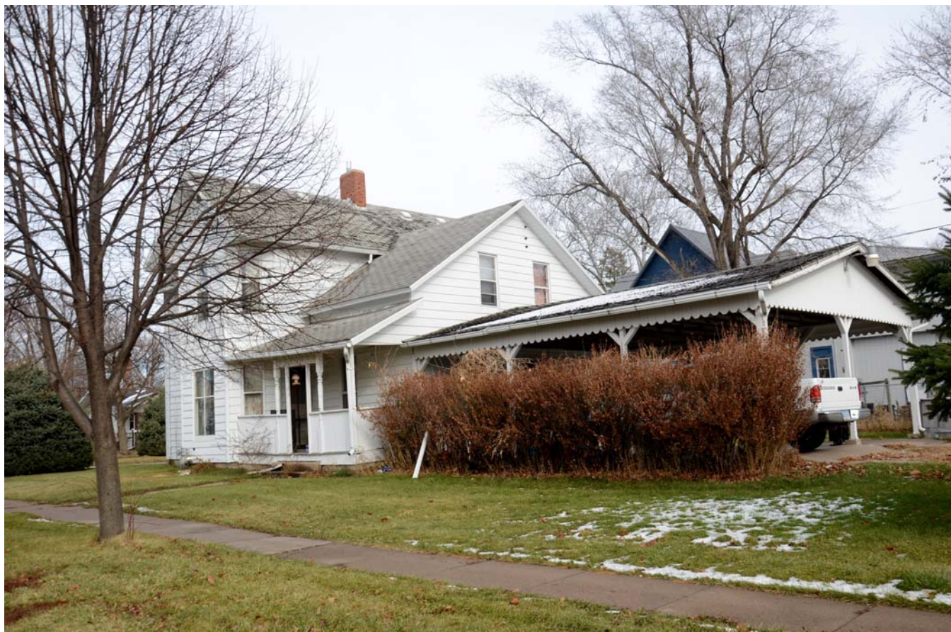
Photograph 92-00372-003 - House, looking northeast (December 2014)