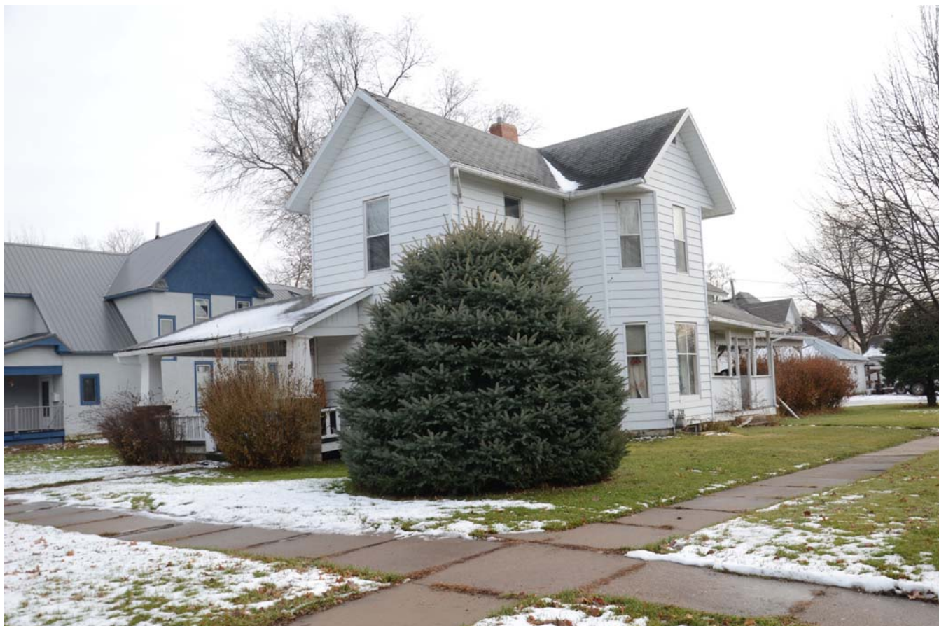
Photograph 92-00372-002 - House, looking southeast (December 2014)