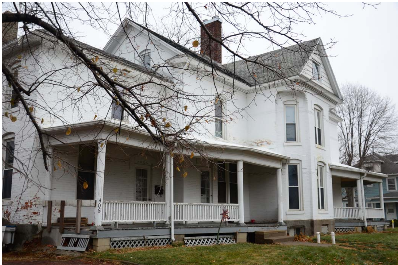
Photograph 92-00429-003 - House, looking northeast (December 2014)