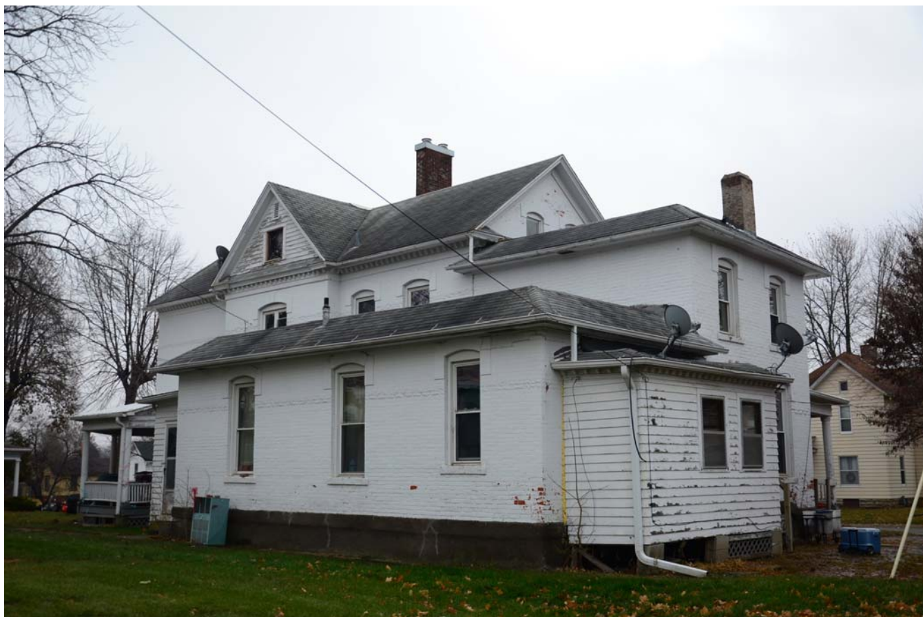
Photograph 92-00429-004 - House, looking southeast (December 2014)