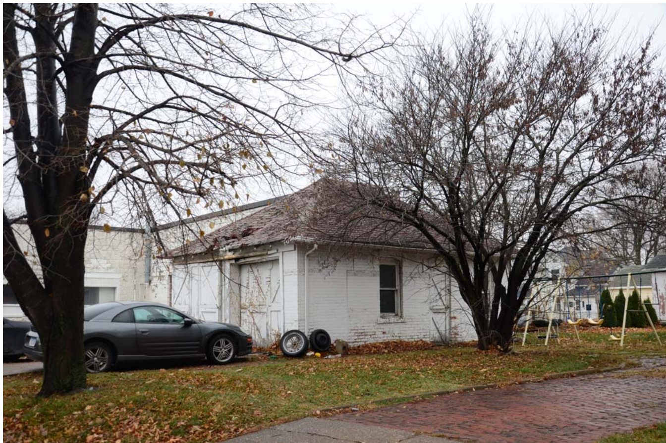
Photograph 92-00429-005 - Garage, looking northwest (December 2014)