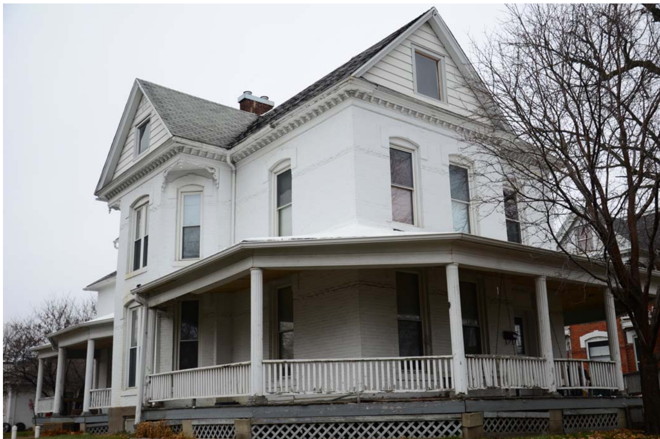
Photograph 92-00429-002 - House, looking northwest (December 2014)