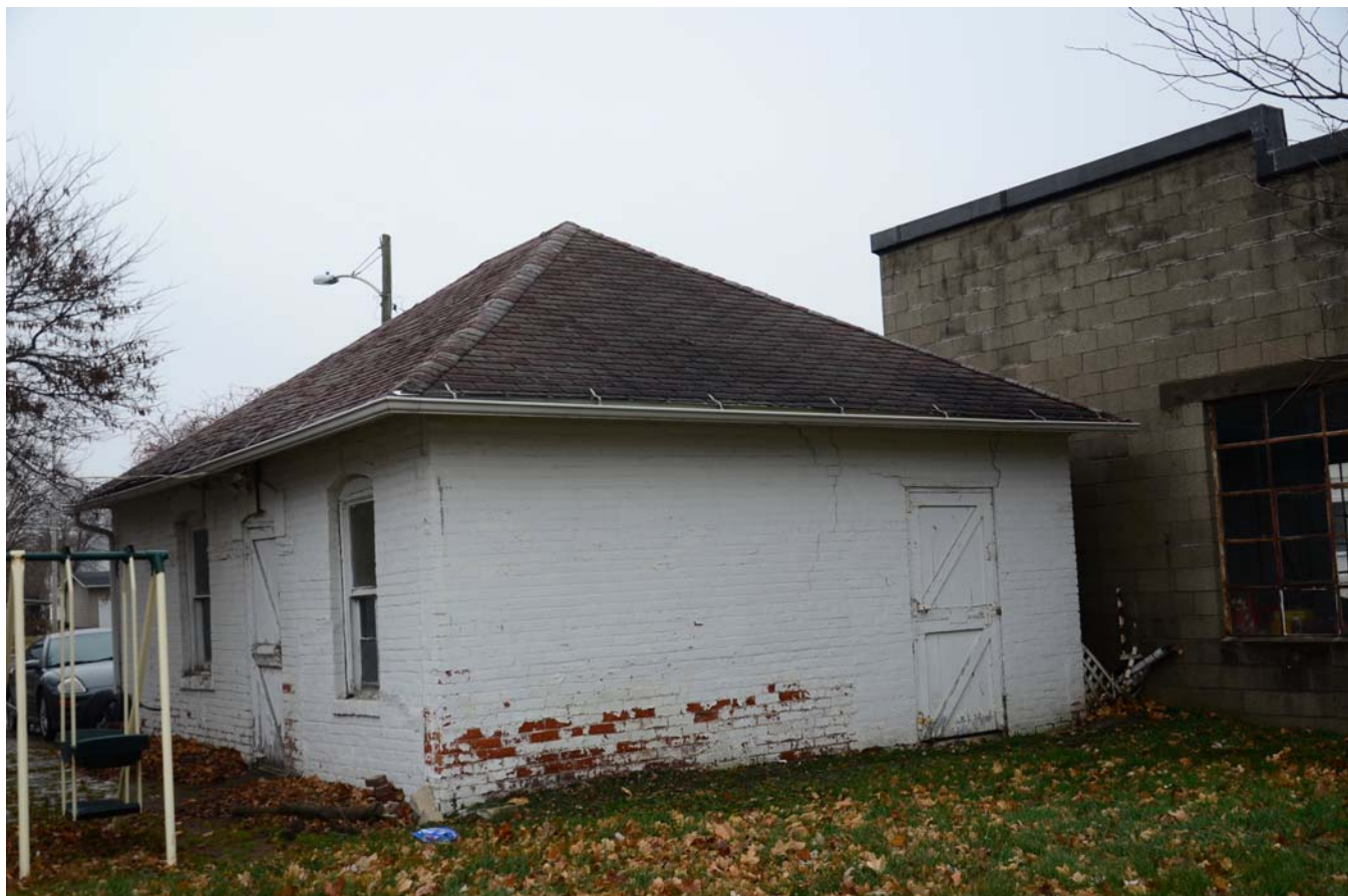
Photograph 92-00429-006 - Garage, looking southwest (December 2014)