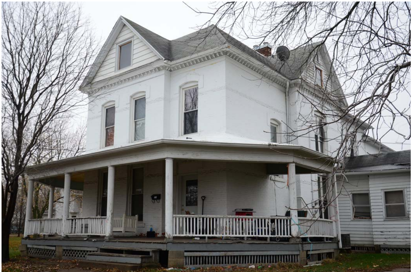
Photograph 92-00429-001 - House, looking southwest (December 2014)