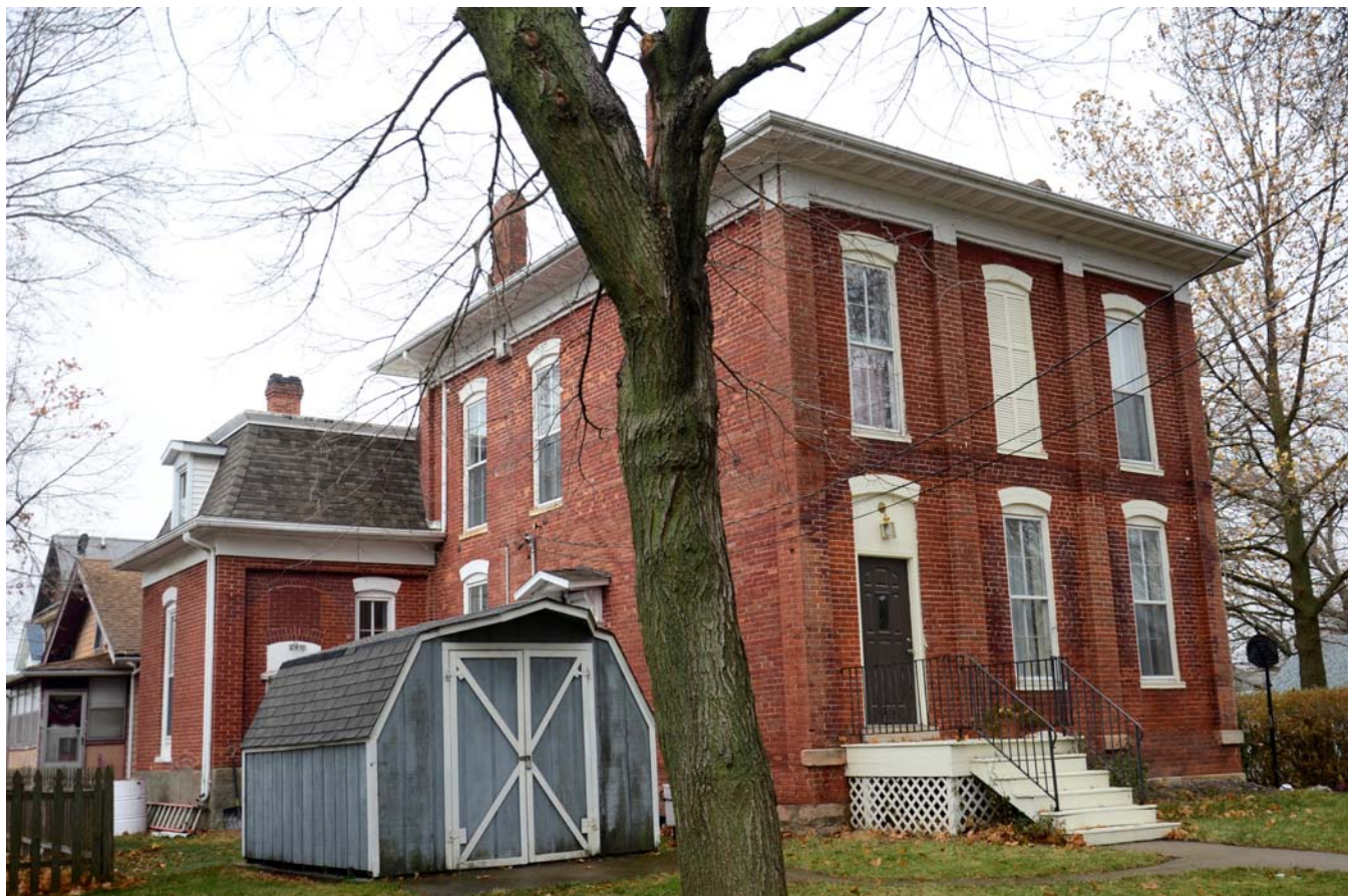
Photograph 92-00155-002 - House, looking northwest (December 2014)