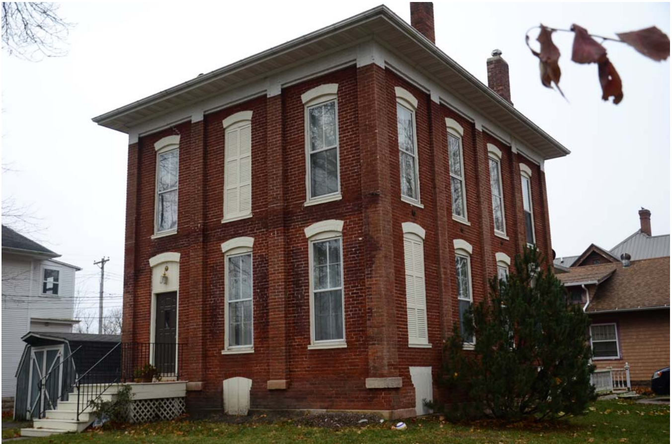
Photograph 92-00155-001 - House, looking southwest (December 2014)