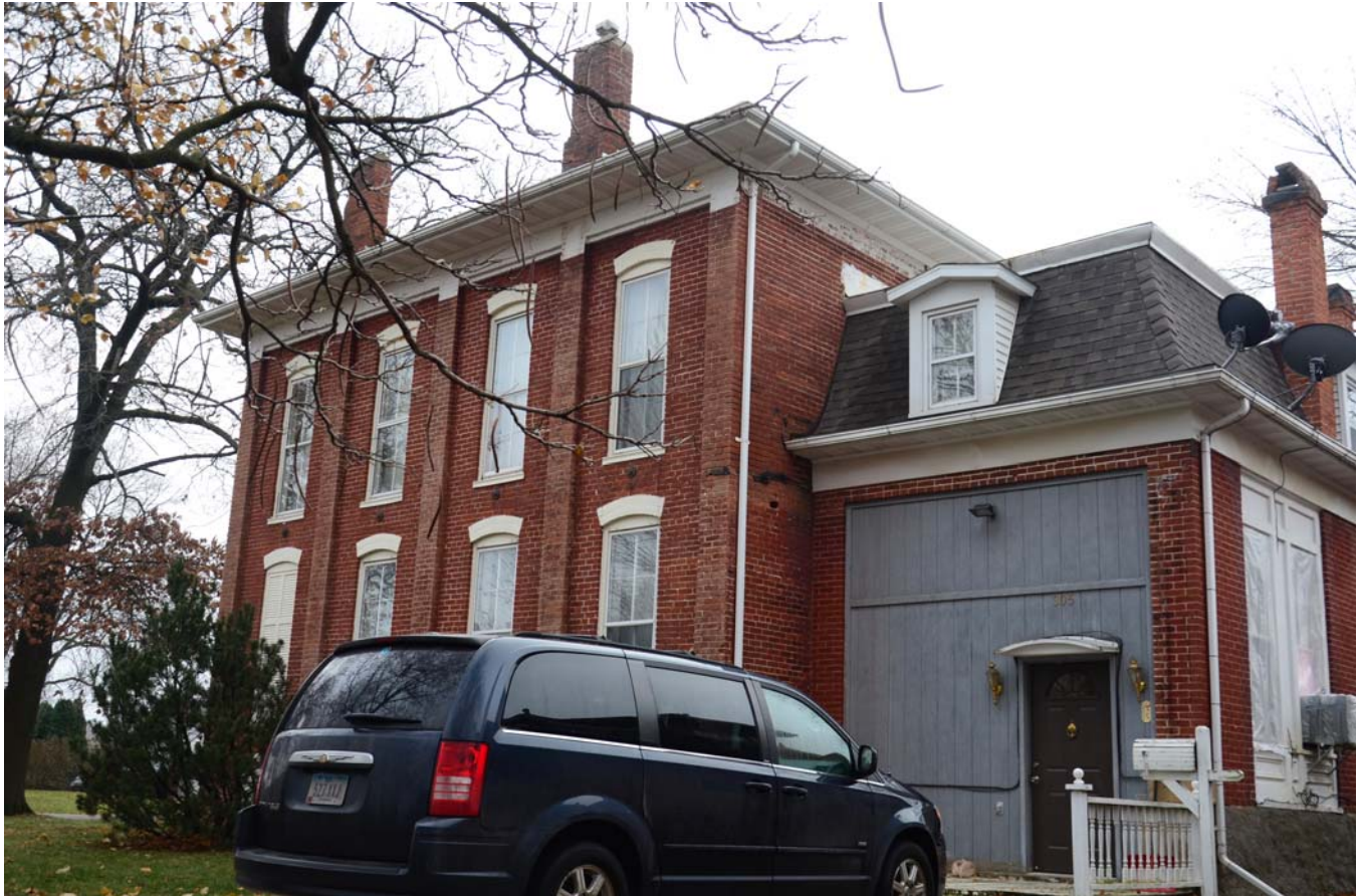
Photograph 92-00155-003 - House, looking southeast (December 2014)