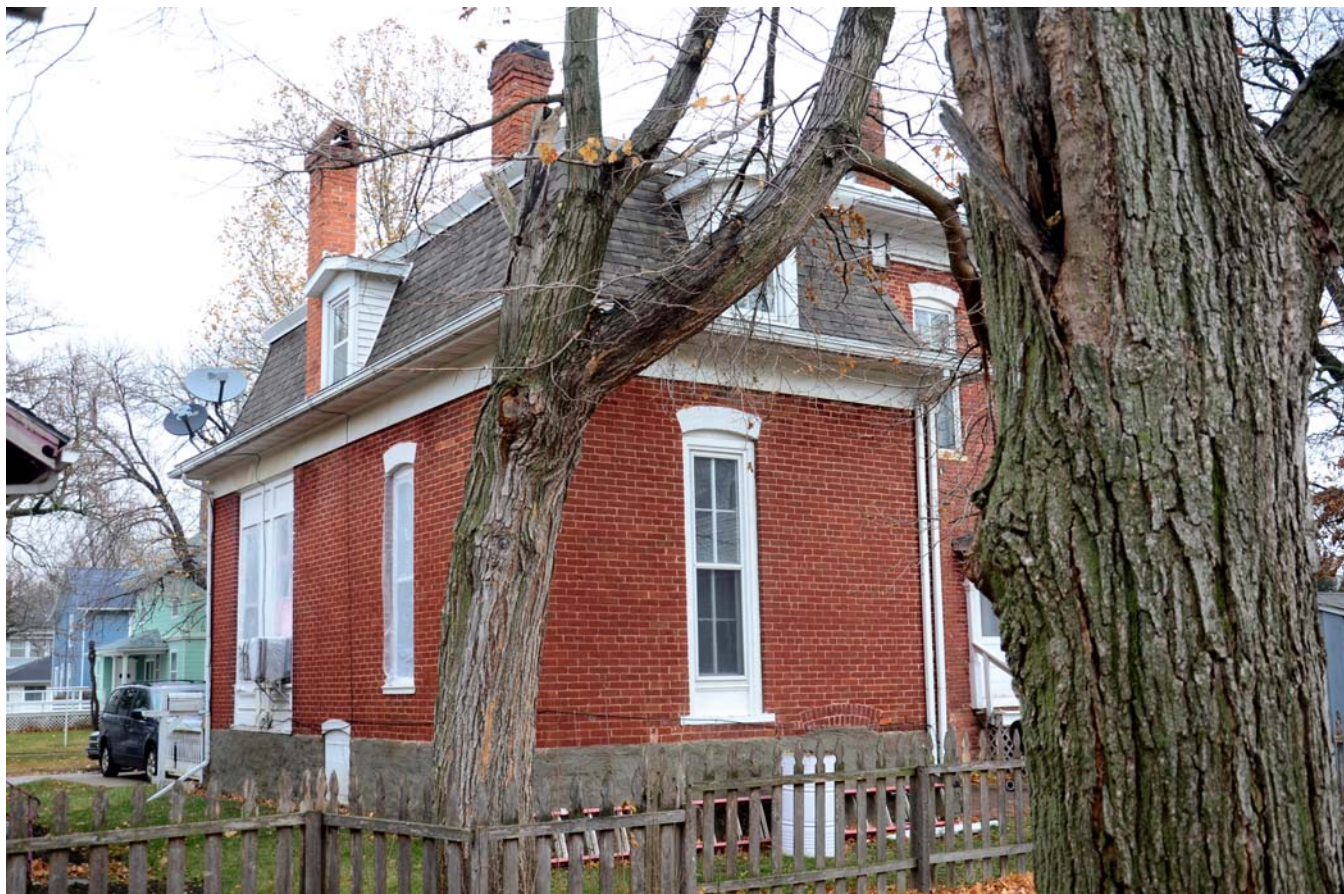
Photograph 92-00155-004 - House, looking northeast (December 2014)