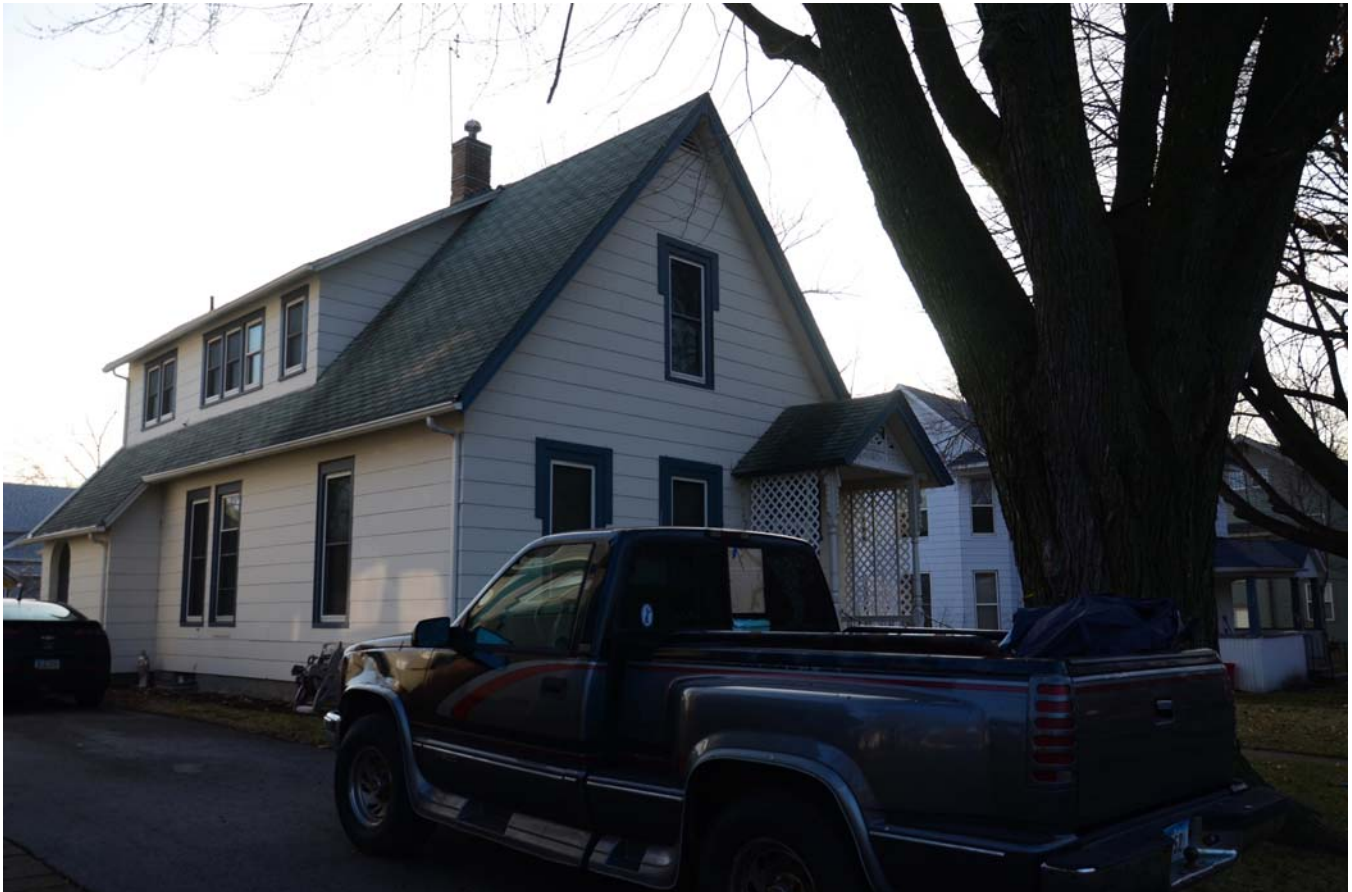
Photograph 92-00401-002 - North (front) and east elevations, looking southwest (December 2014)