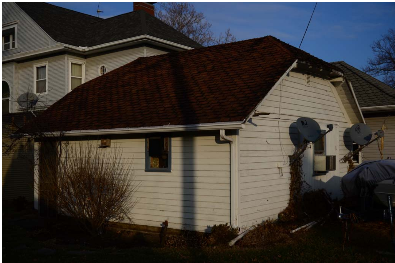
Photograph 92-00401-004 - Garage, looking northeast (December 2014)