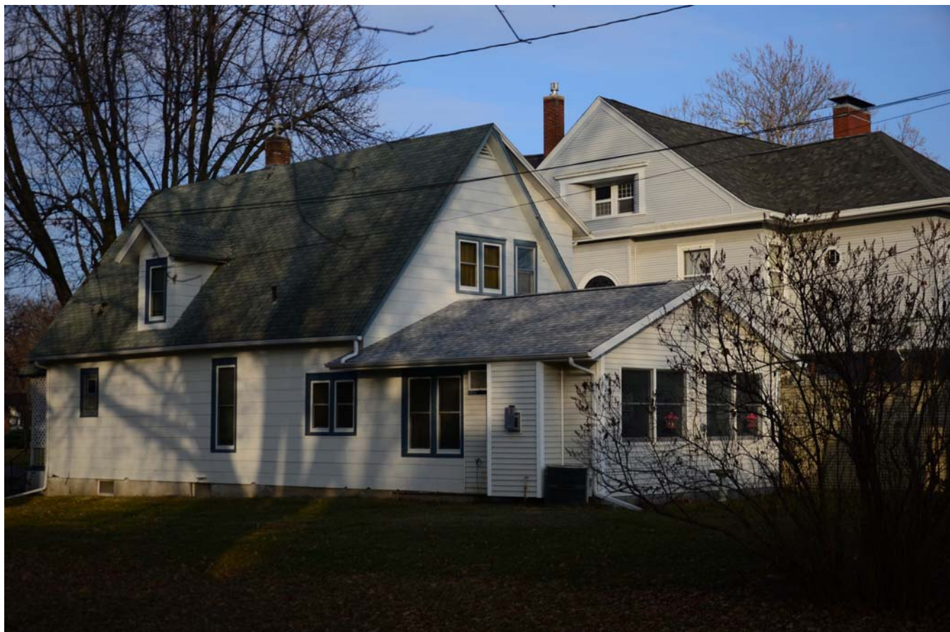
Photograph 92-00401-003 - West and rear (south) elevations, looking northeast (December 2014)