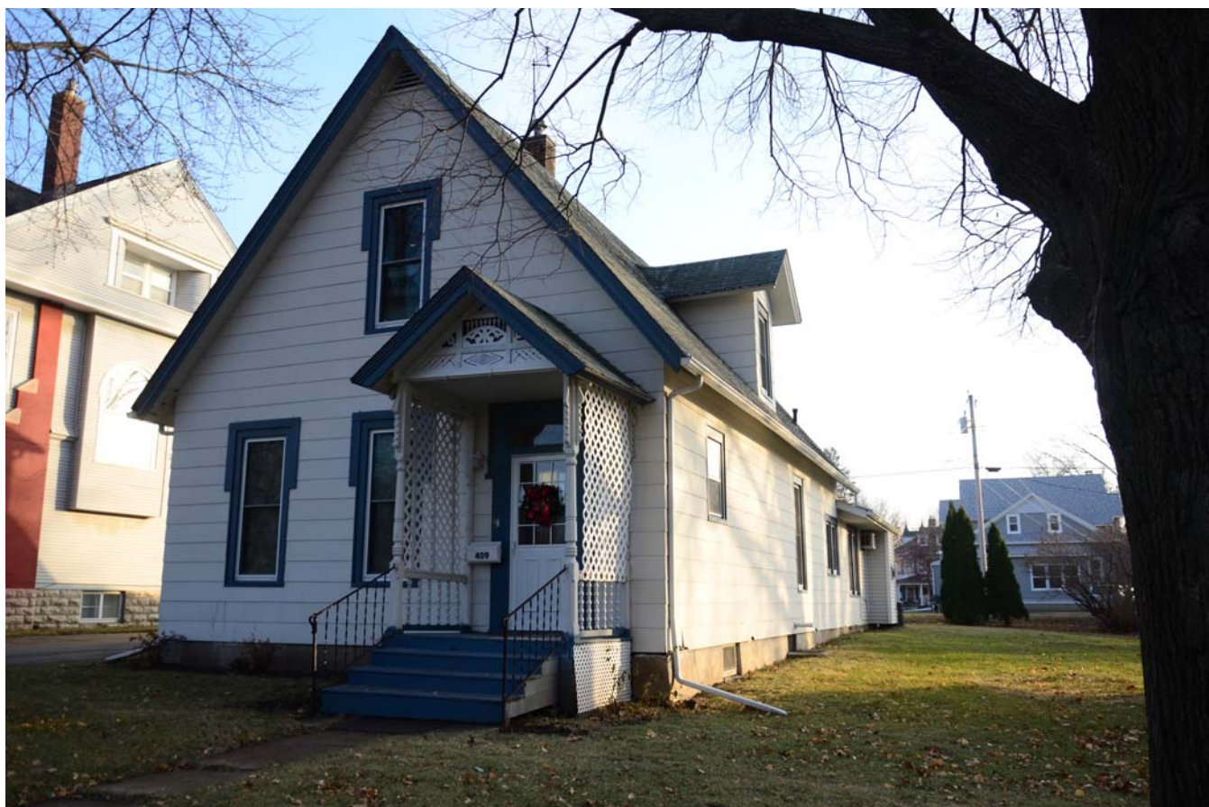
Photograph 92-00401-001 - North (front) and west elevations, looking southeast (December 2014)