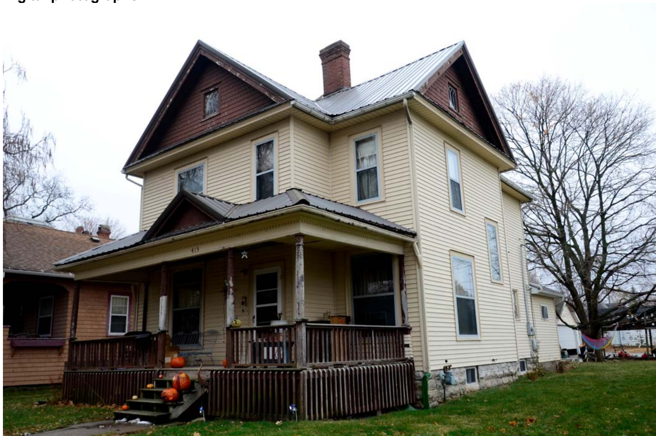
Photograph 92-00423-001 - House, looking southeast (December 2014)