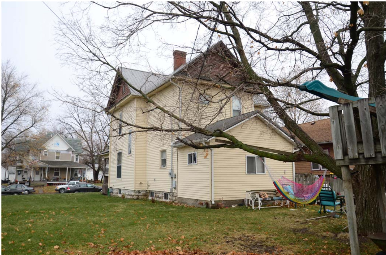
Photograph 92-00423-003 - House, looking northeast (December 2014)