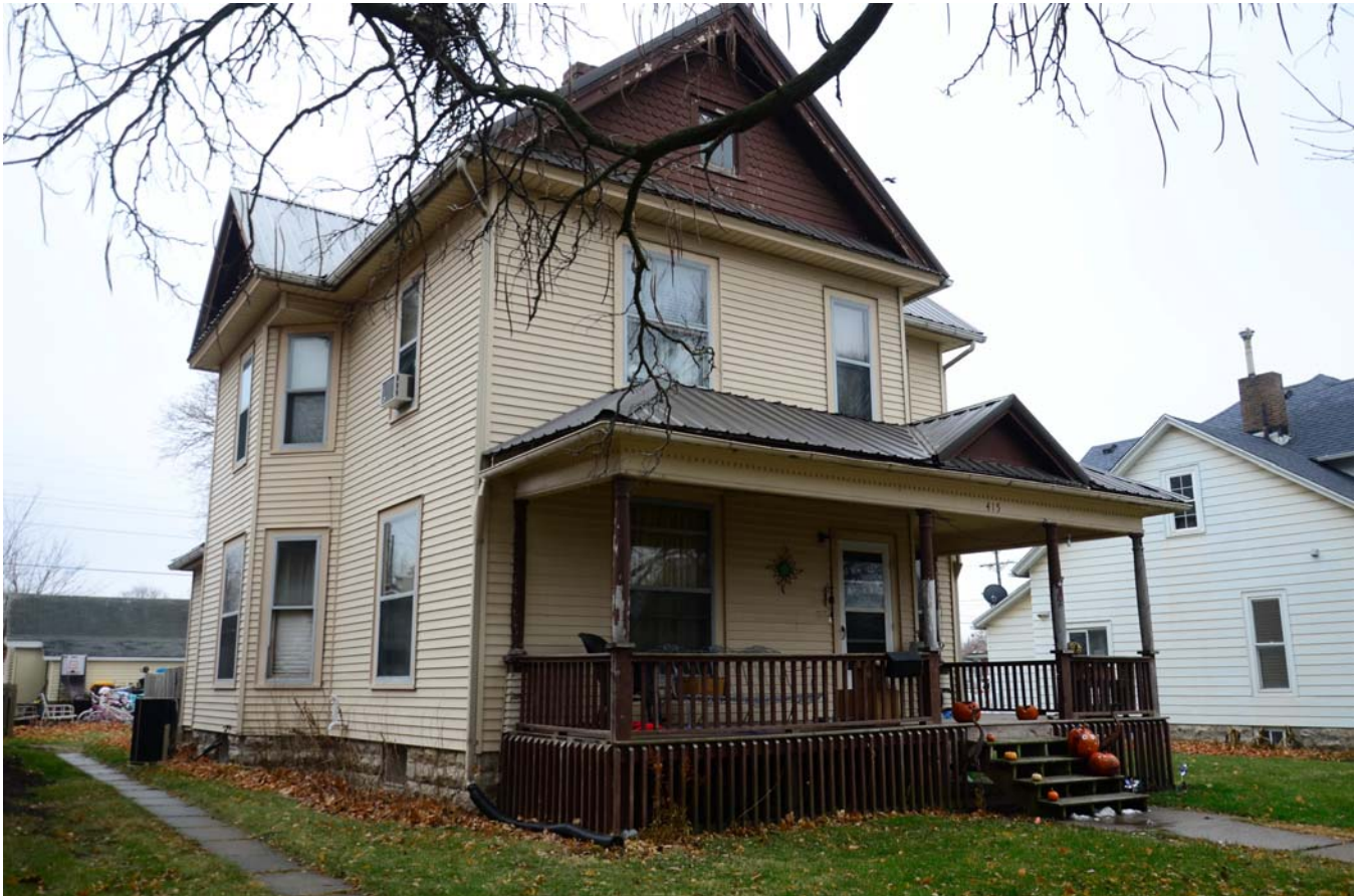
Photograph 92-00423-002 - House, looking southwest (December 2014)