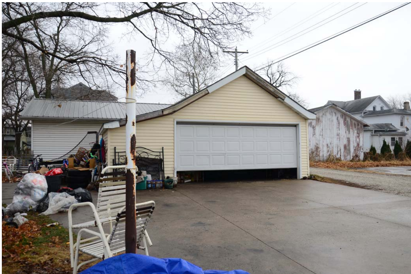
Photograph 92-00423-004 - Garage, looking southeast (December 2014)