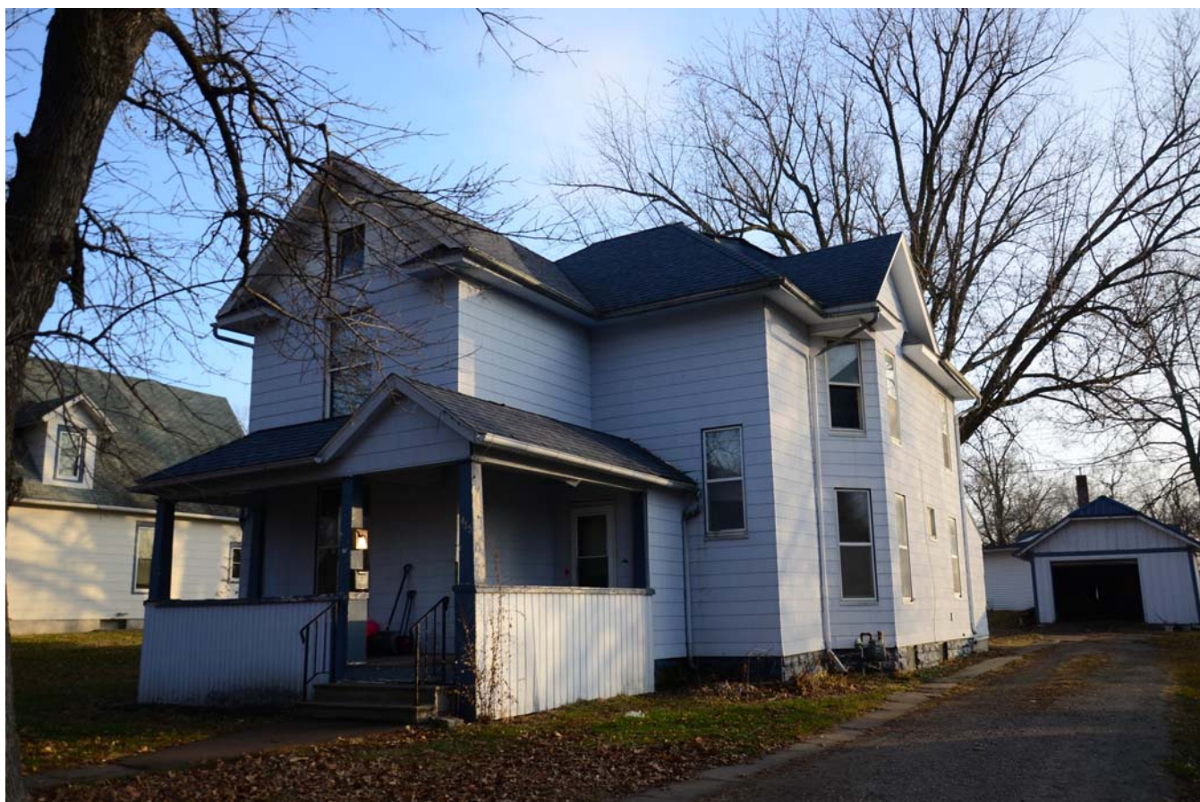
Photograph 92-00163-001 - House and garage, looking southeast (December 2014)