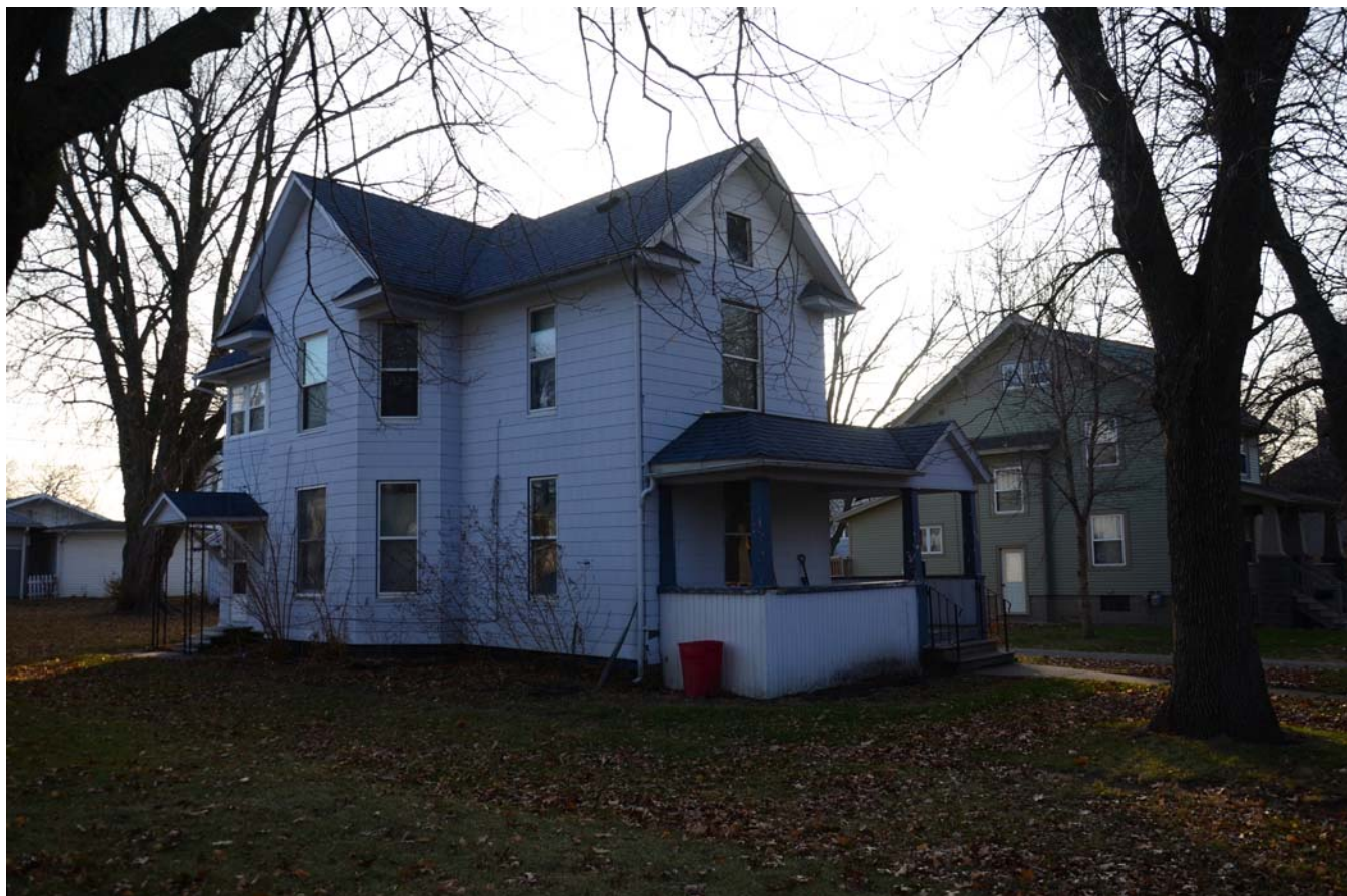
Photograph 92-00163-002 - House, looking southwest (December 2014)