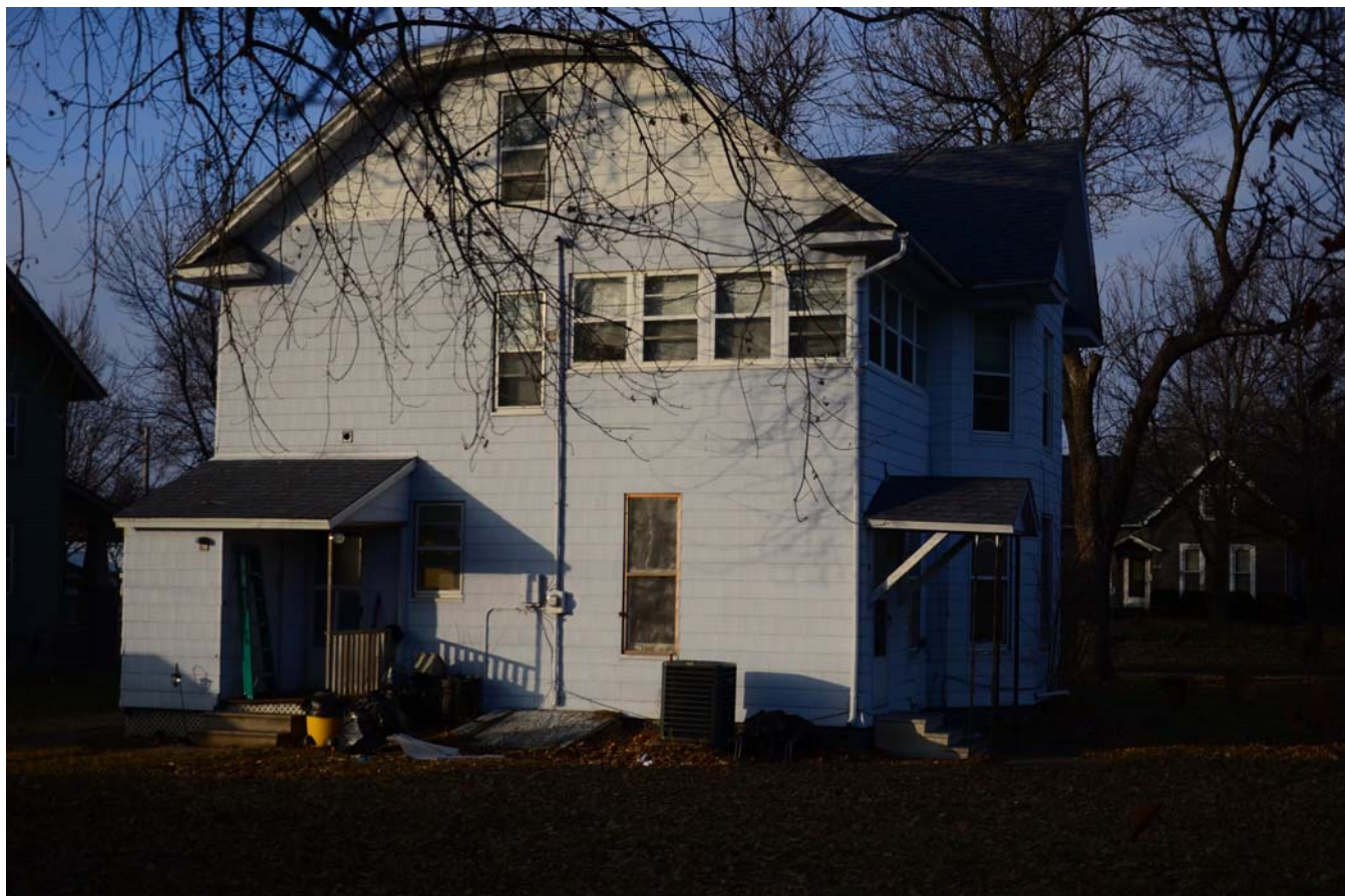
Photograph 92-00163-003 - House, looking north (December 2014)