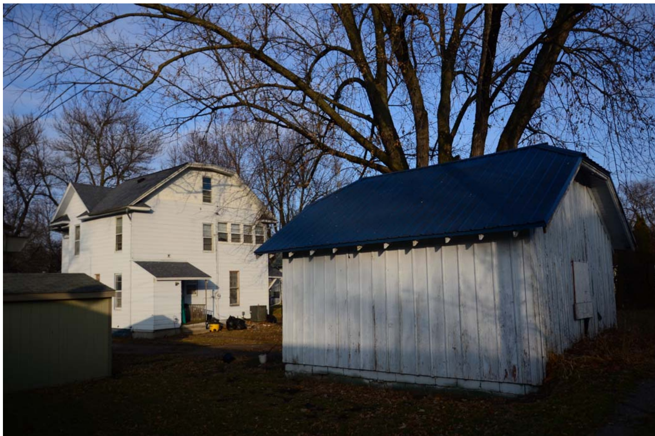
Photograph 92-00163-004 - Garage, looking northeast (December 2014)