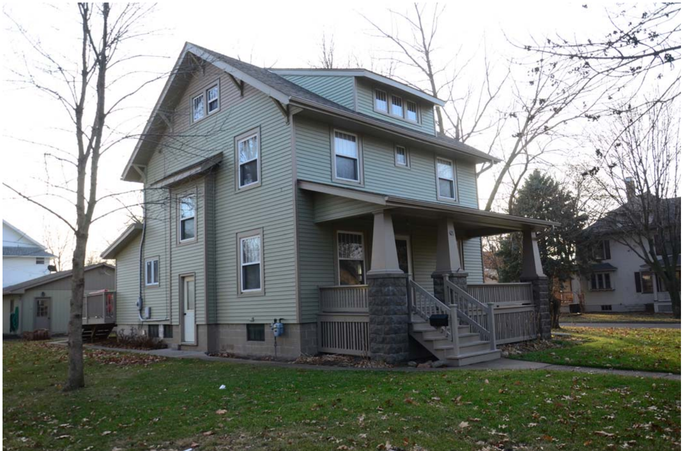
Photograph 92-00403-001 - House, looking southwest (December 2014)