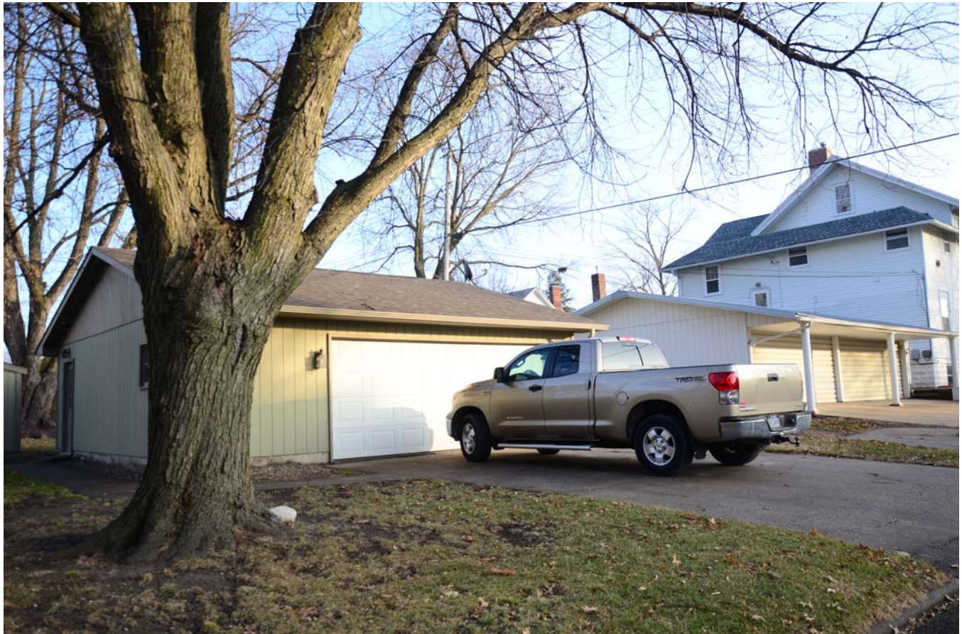
Photograph 92-00403-004 - Garage, looking southeast (December 2014)