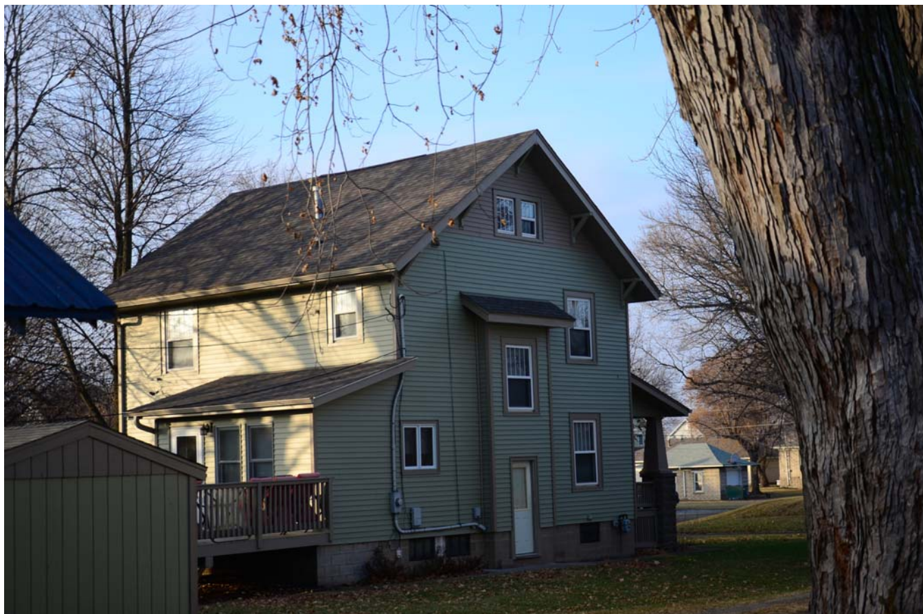
Photograph 92-00403-003 - House, looking northwest (December 2014)