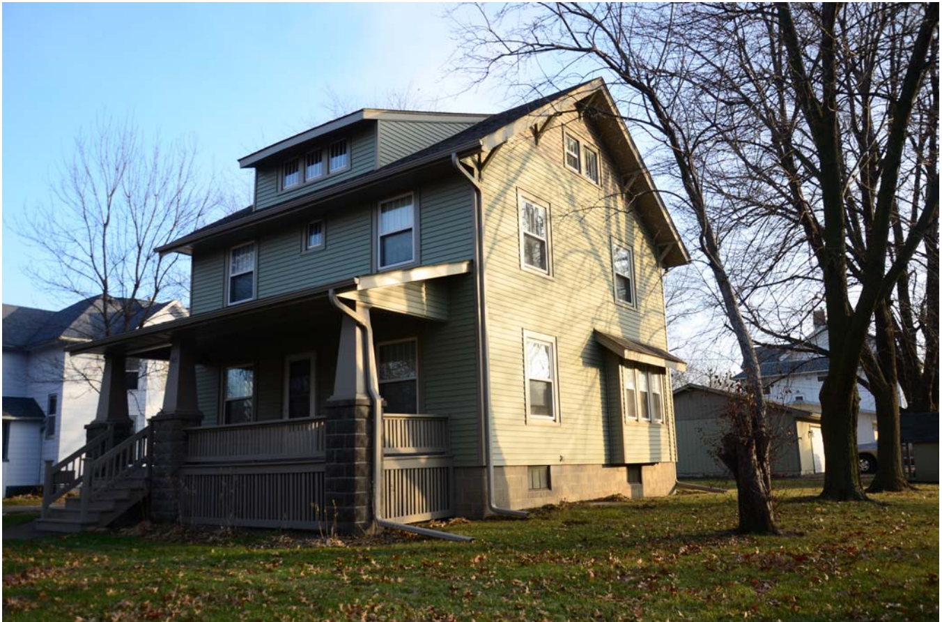
Photograph 92-00403-002 - House, looking southeast (December 2014)