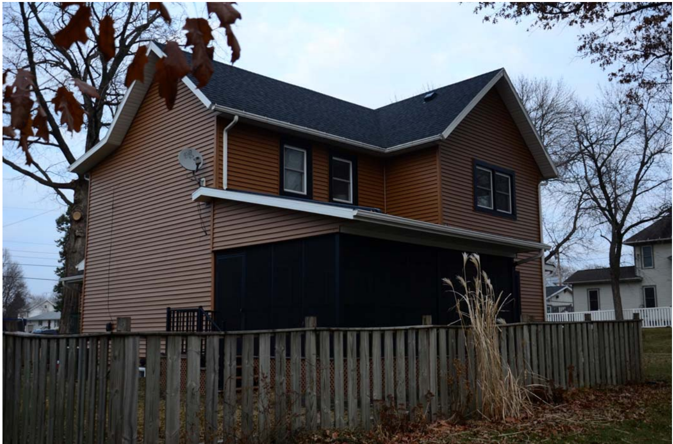
Photograph 92-00775-002 - House, looking northeast (December 2014)