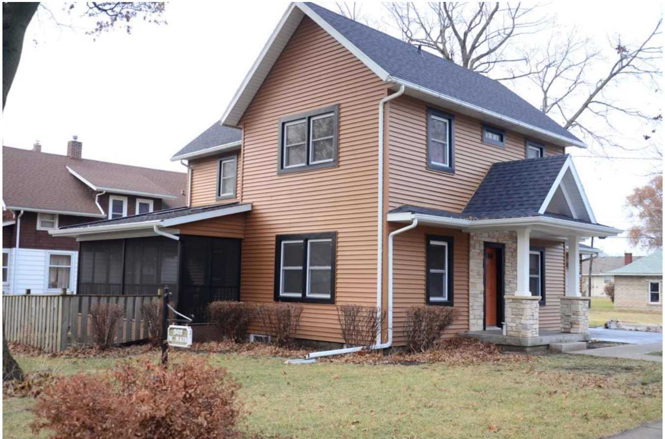
Photograph 92-00775-001 - House, looking northwest (December 2014)