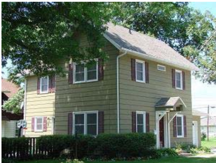
Rebecca will insert