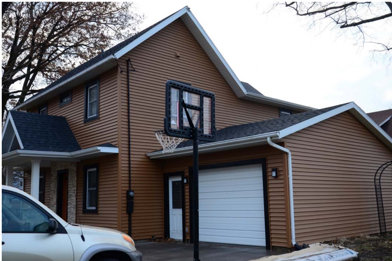
Photograph 92-00775-003 - House, looking southwest (December 2014)