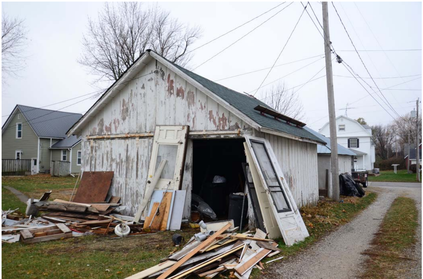
Photograph 92-00735-005 - Garage, looking southwest (December 2014)