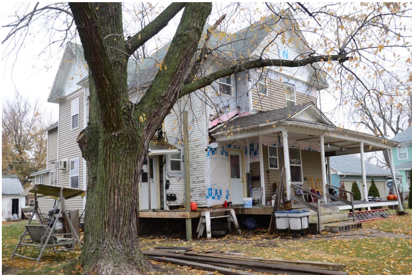
Photograph 92-00735-002 - House, looking northeast (December 2014)