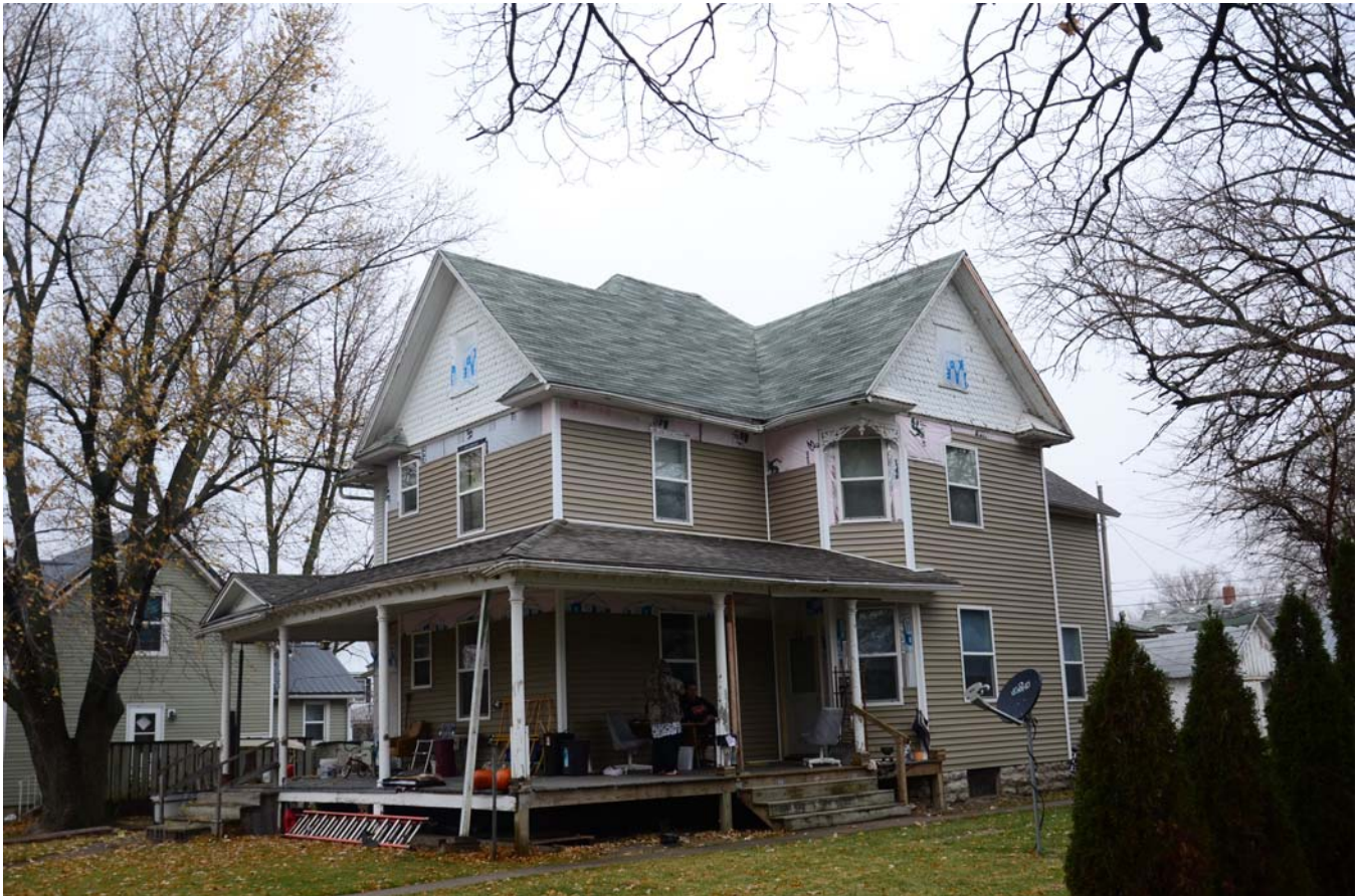
Photograph 92-00735-001 - House, looking northwest (December 2014)