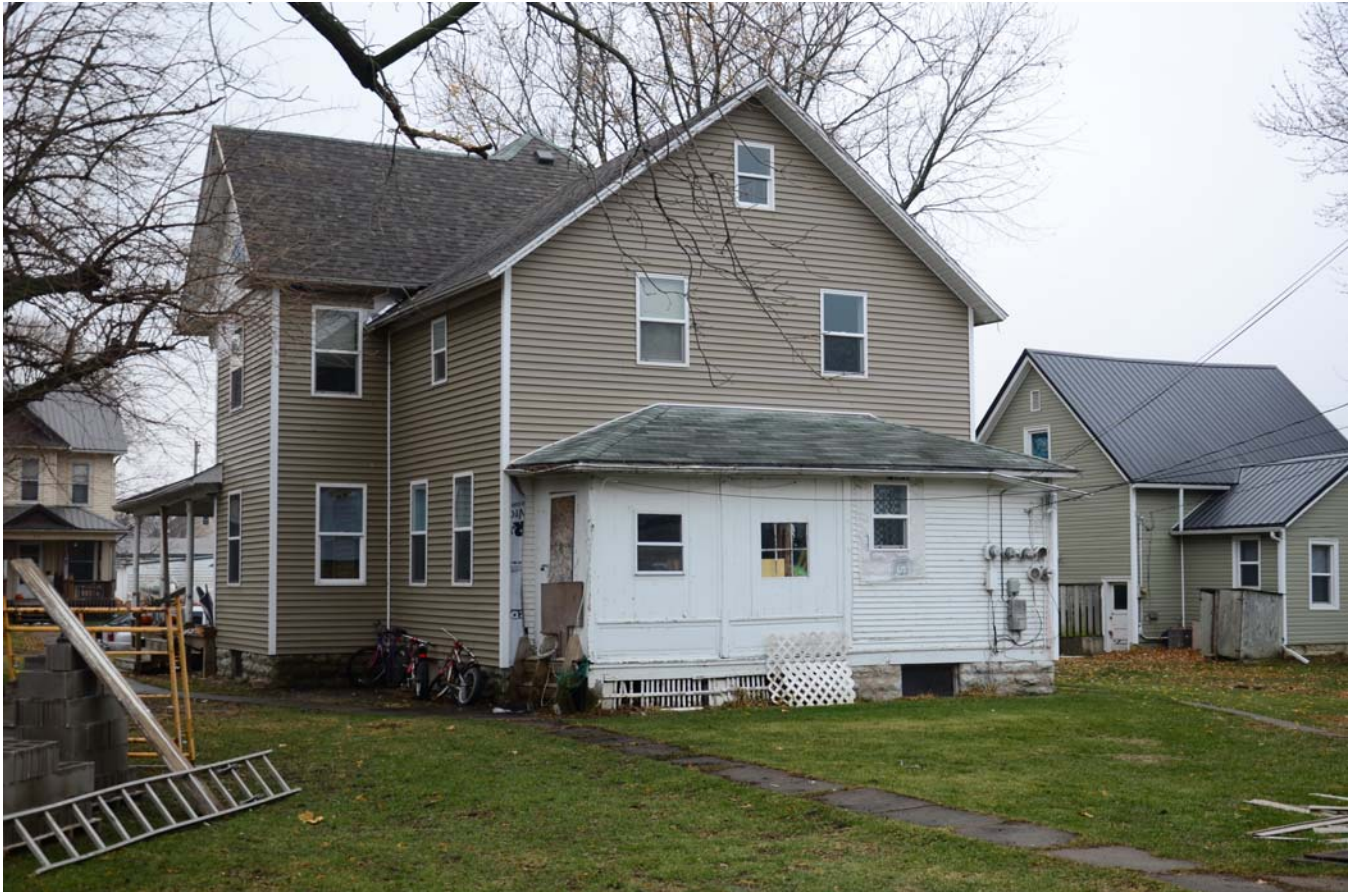
Photograph 92-00735-004 - House, looking southwest (December 2014)