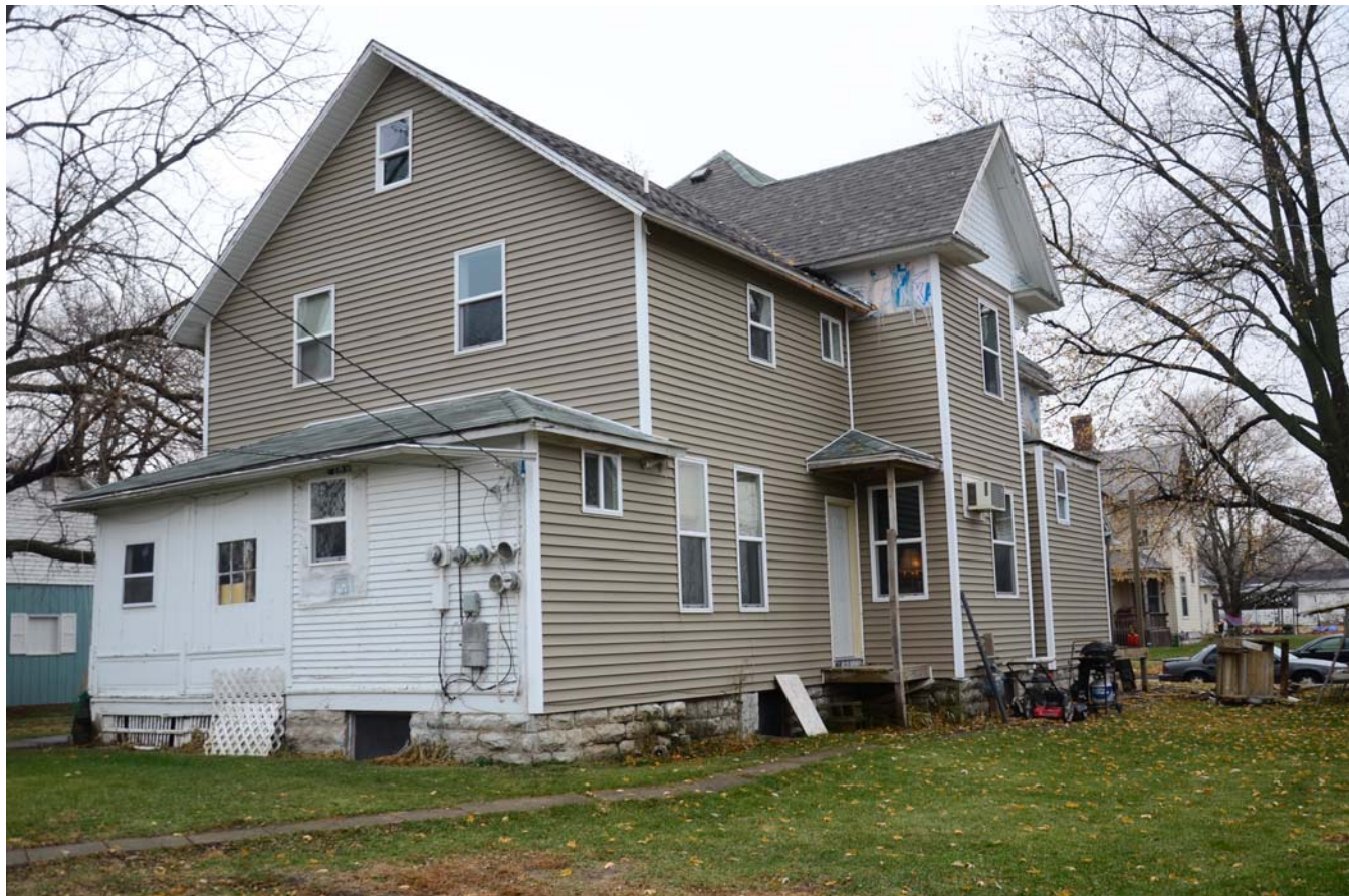
Photograph 92-00735-003 - House, looking southeast (December 2014)