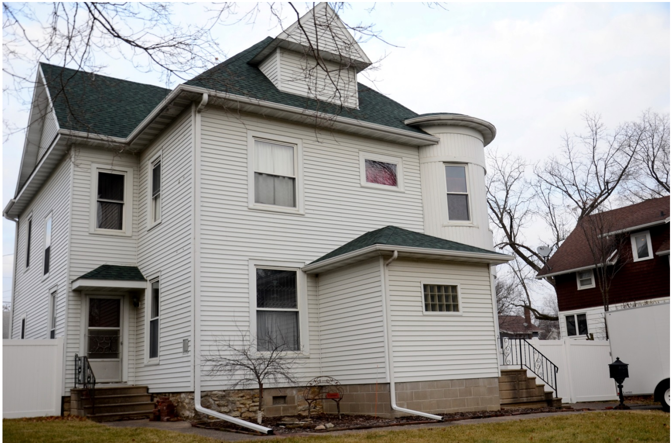
Photograph 92-00417-001 - House, looking northeast (December 2014)