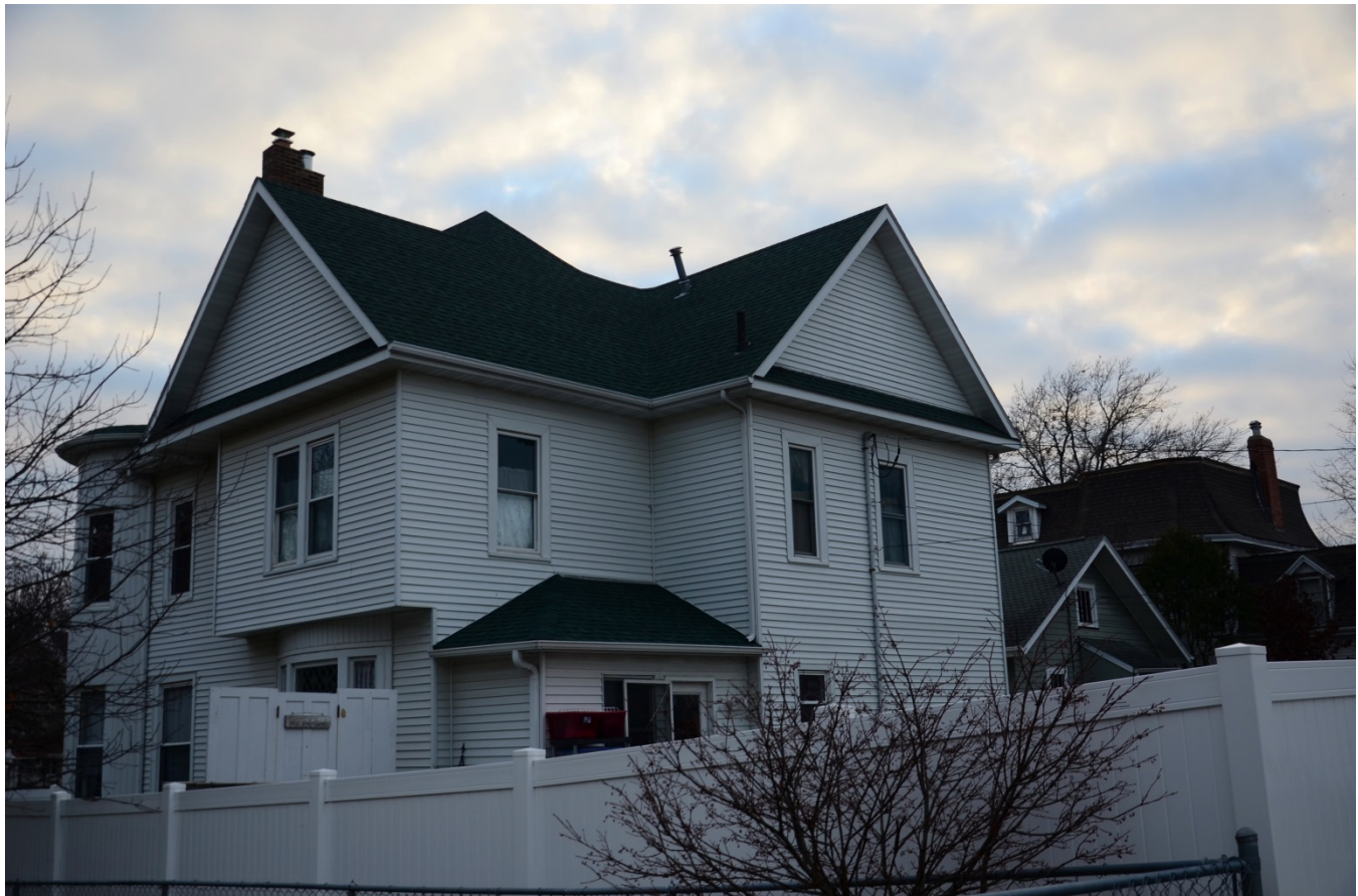
Photograph 92-00417-002 - House, looking southwest (December 2014)