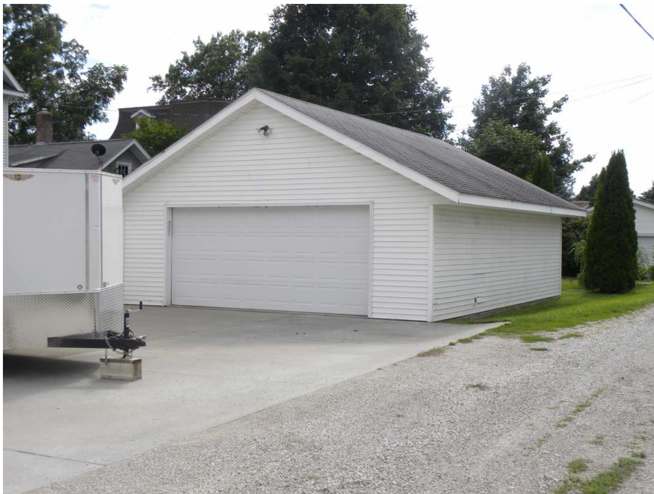
Photograph 92-00417-003 - Garage, looking southwest (July 2015)