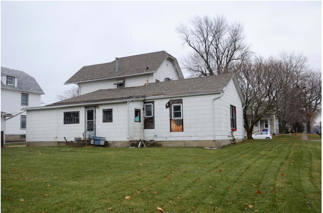
Photograph 92-00739-003 - House, looking northeast (December 2014)