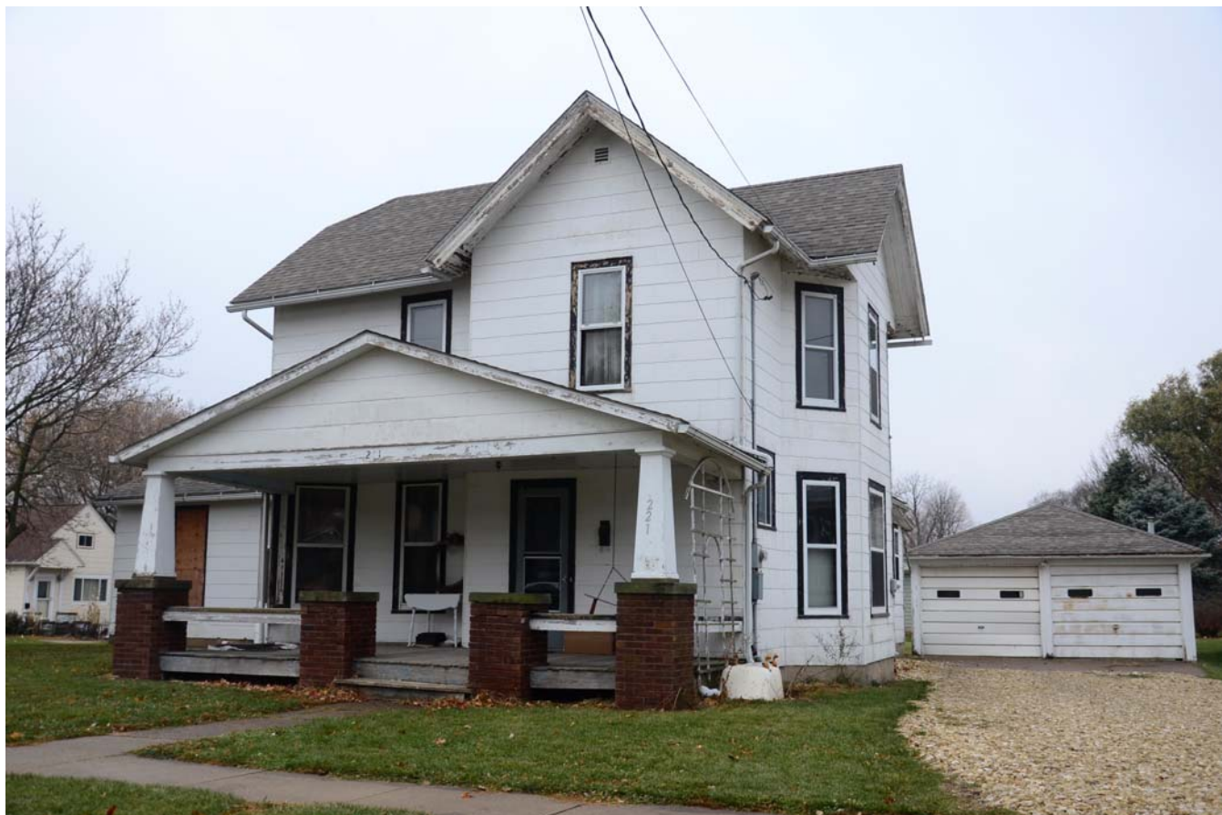
Photograph 92-00739-002 - House, looking west (December 2014)