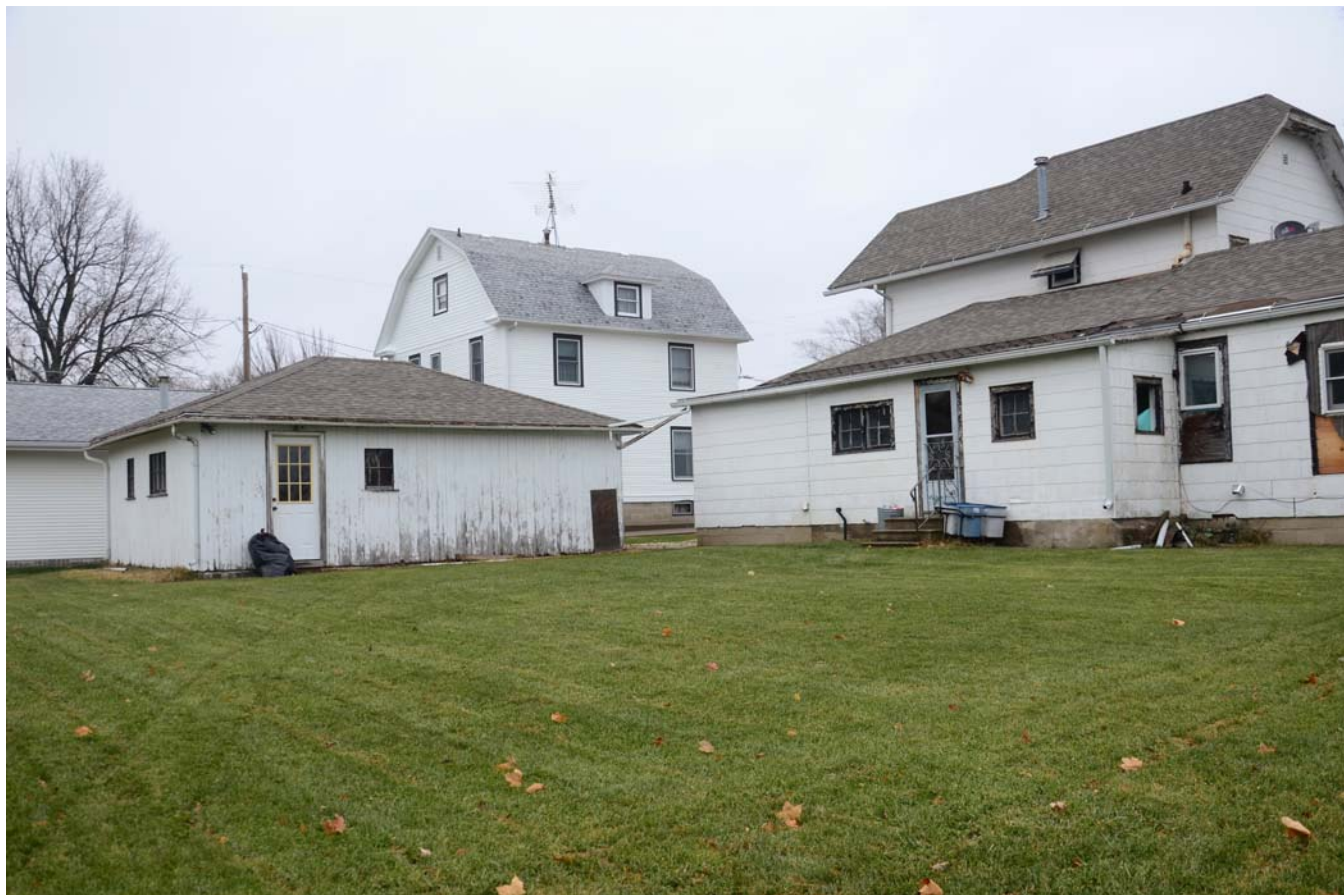
Photograph 92-00739-004 - Garage and house, looking northeast (December 2014)