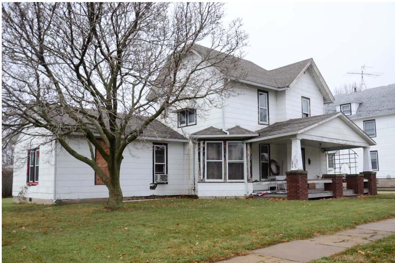
Photograph 92-00739-001 - House, looking northwest (December 2014)