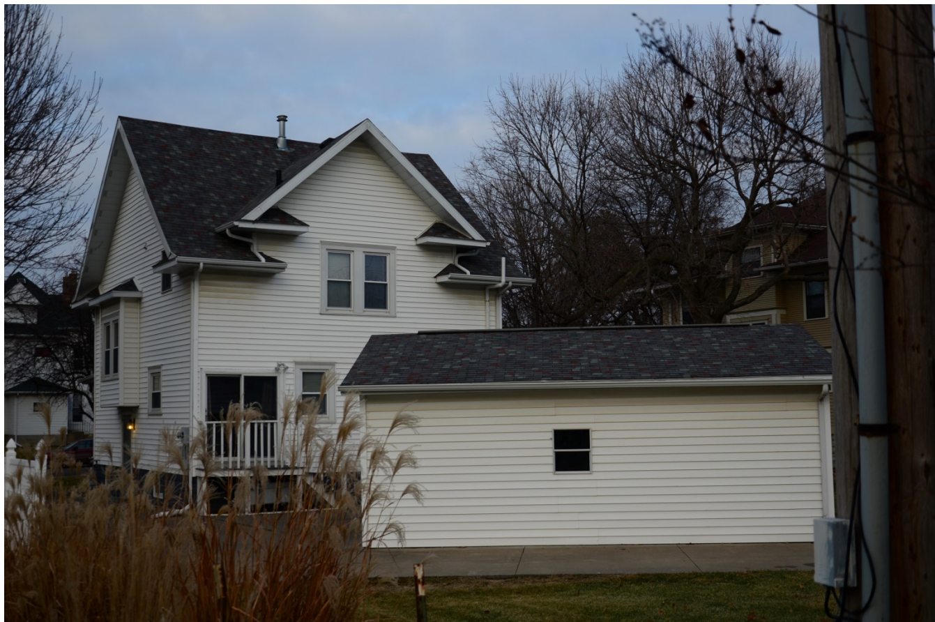
Photograph 92-00406-003 - House, looking northeast (December 2014)