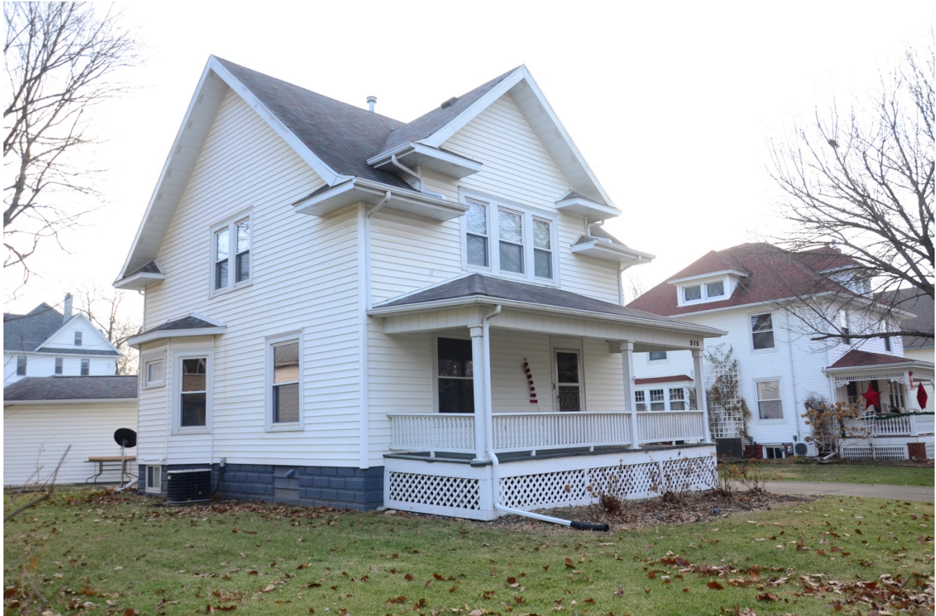
Photograph 92-00406-002 - House, looking southwest (December 2014)