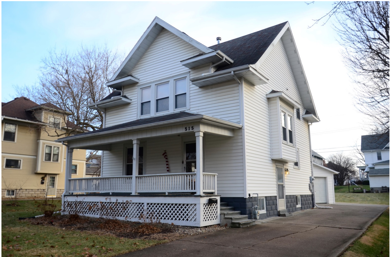
Photograph 92-00406-001 - House, looking southeast (December 2014)