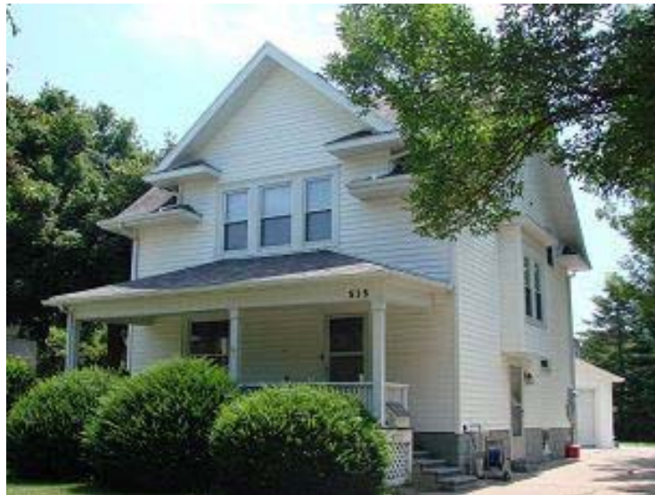
Photo from assessor's website