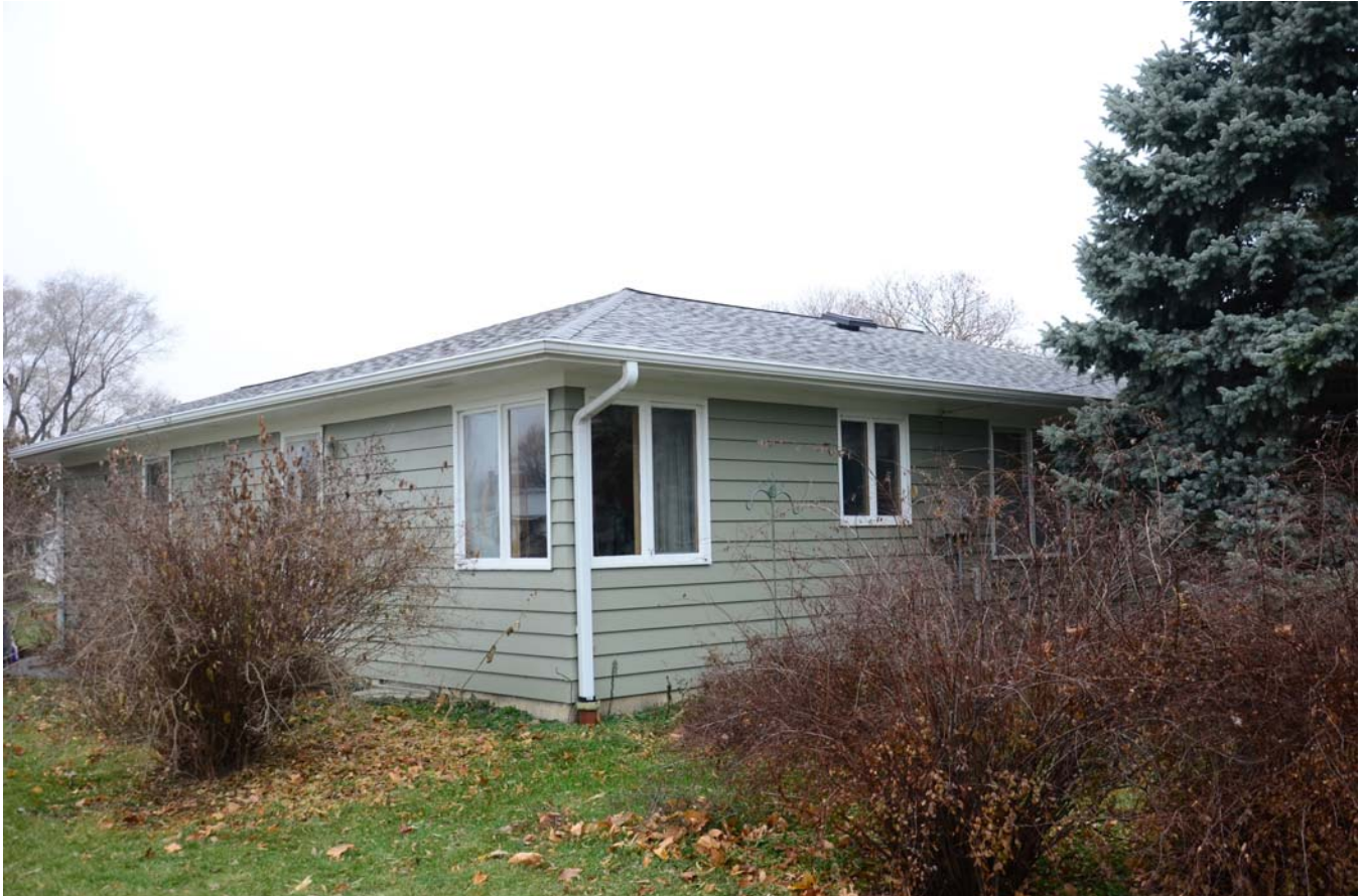
Photograph 92-00740-003 - House, looking southwest (December 2014)