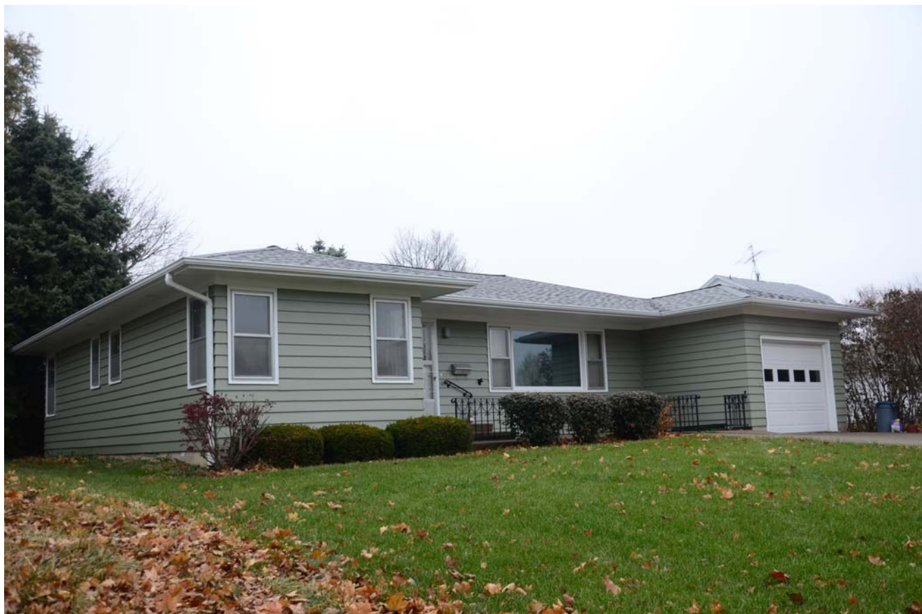
Photograph 92-00740-001 - House, looking northeast (December 2014)