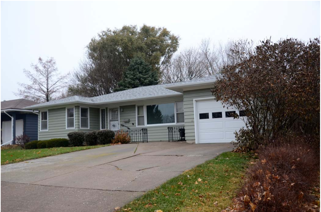
Photograph 92-00740-002 - House, looking northwest (December 2014)