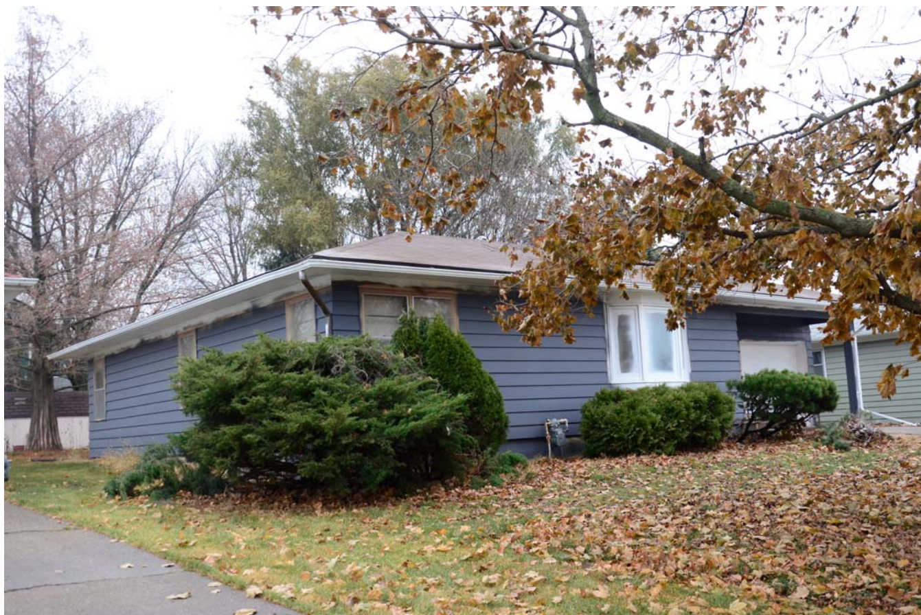
Photograph 92-00741-001 - House, looking northeast (December 2014)