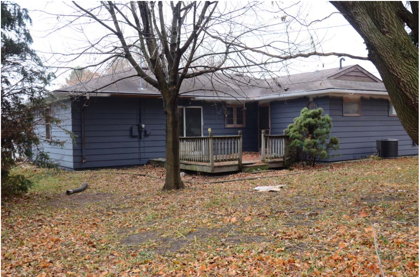
Photograph 92-00741-002 - House, looking southwest (December 2014)