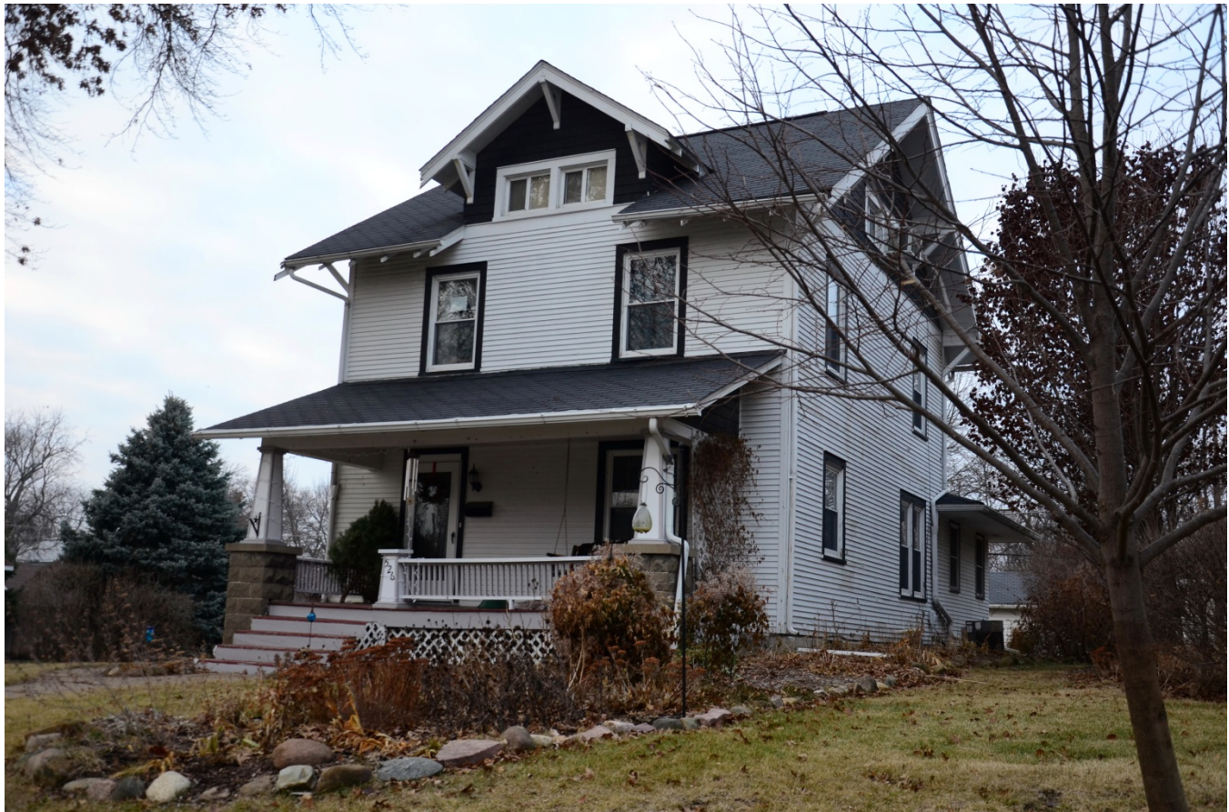
Photograph 92-00419-001 - House, looking northwest (December 2014)