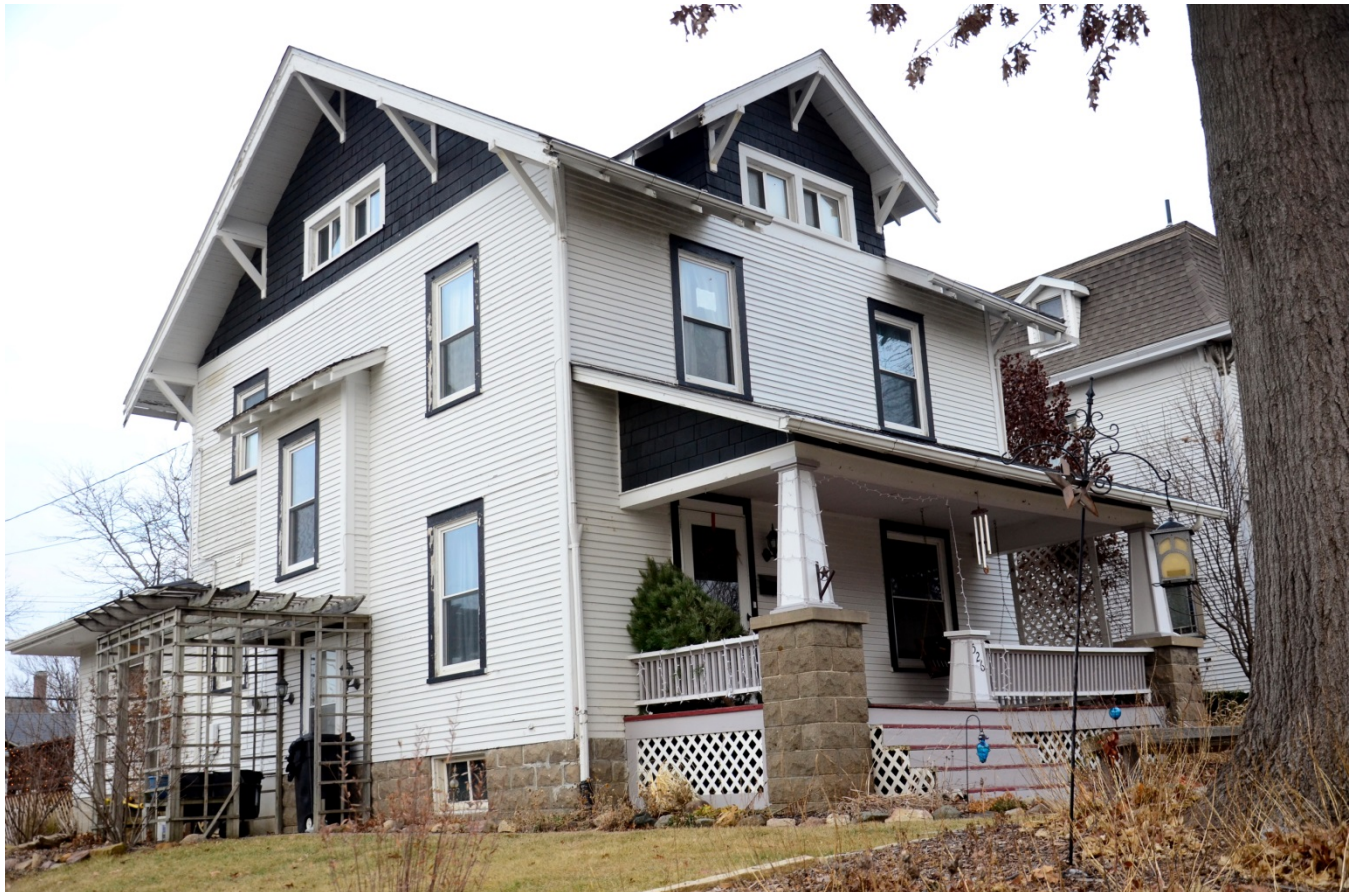
Photograph 92-00419-002 - House, looking northeast (December 2014)