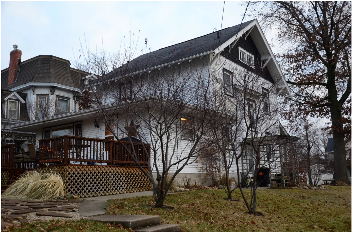
Photograph 92-00419-003 - House, looking southeast (December 2014)