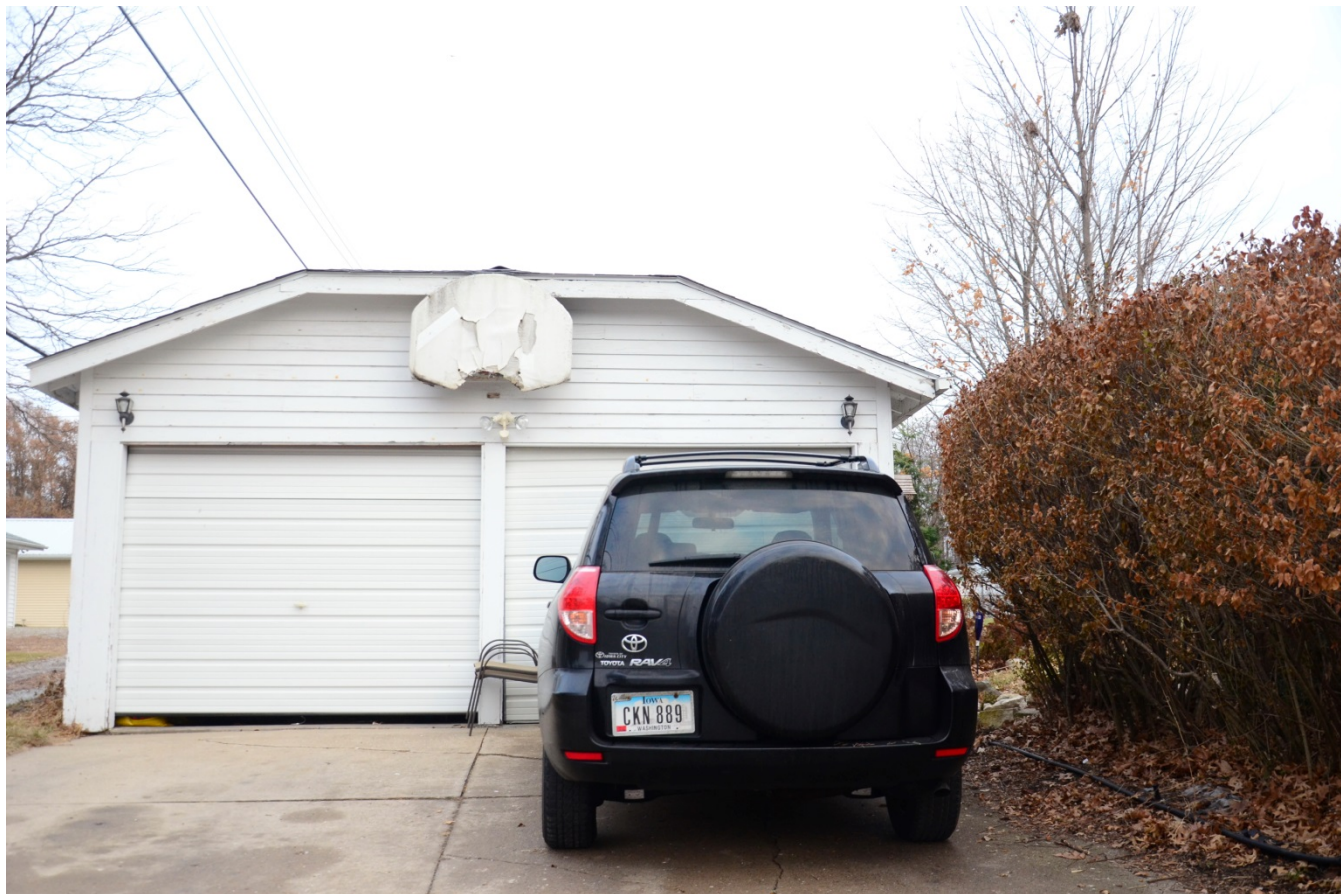
Photograph 92-00419-002 - House, looking east (December 2014)