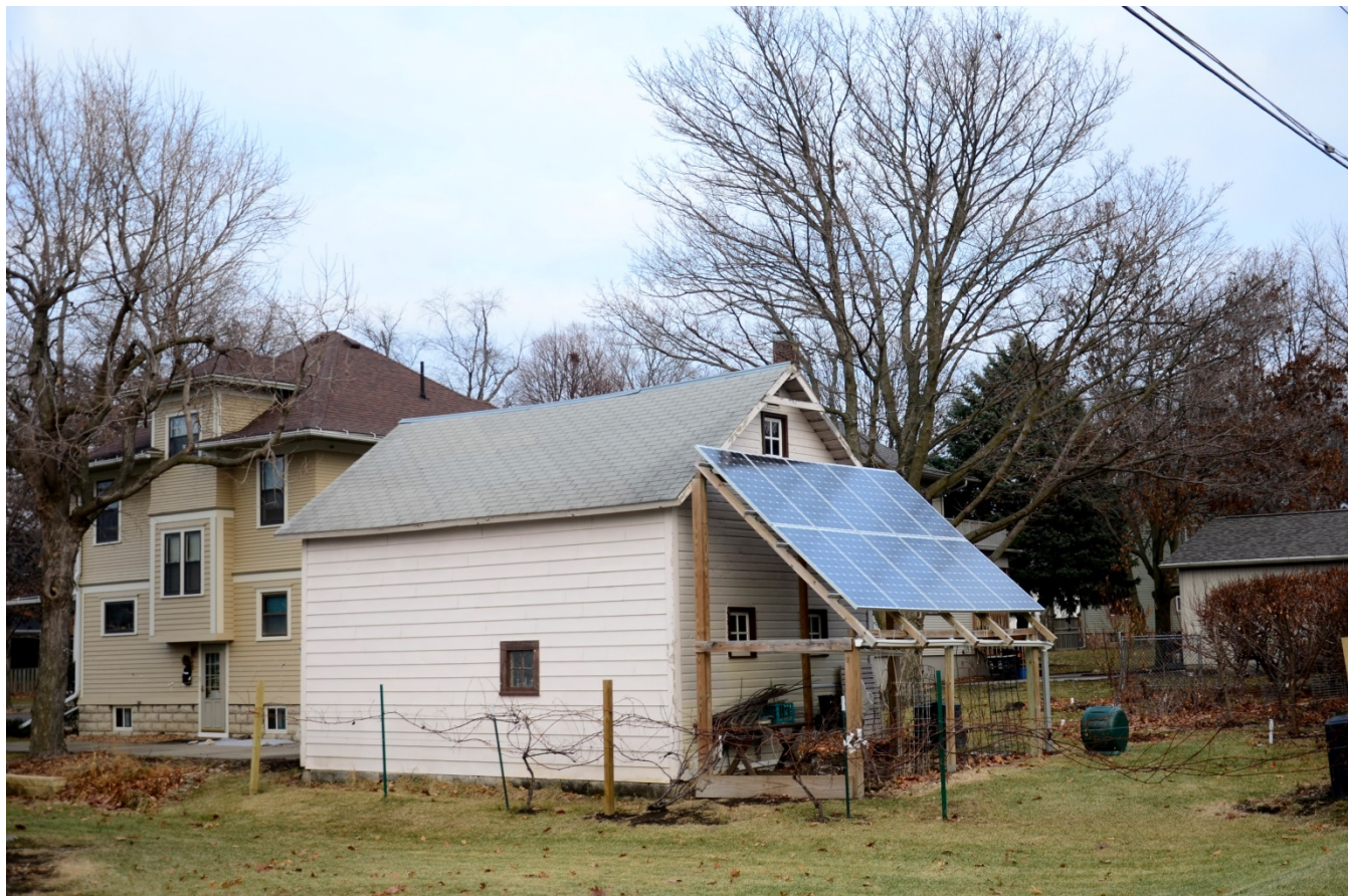
Photograph 92-00405-004 - Garage, looking northeast (December 2014)