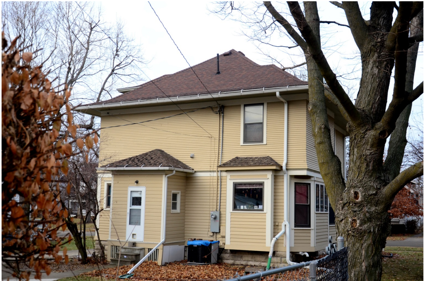
Photograph 92-00405-003 - House, looking north (December 2014)