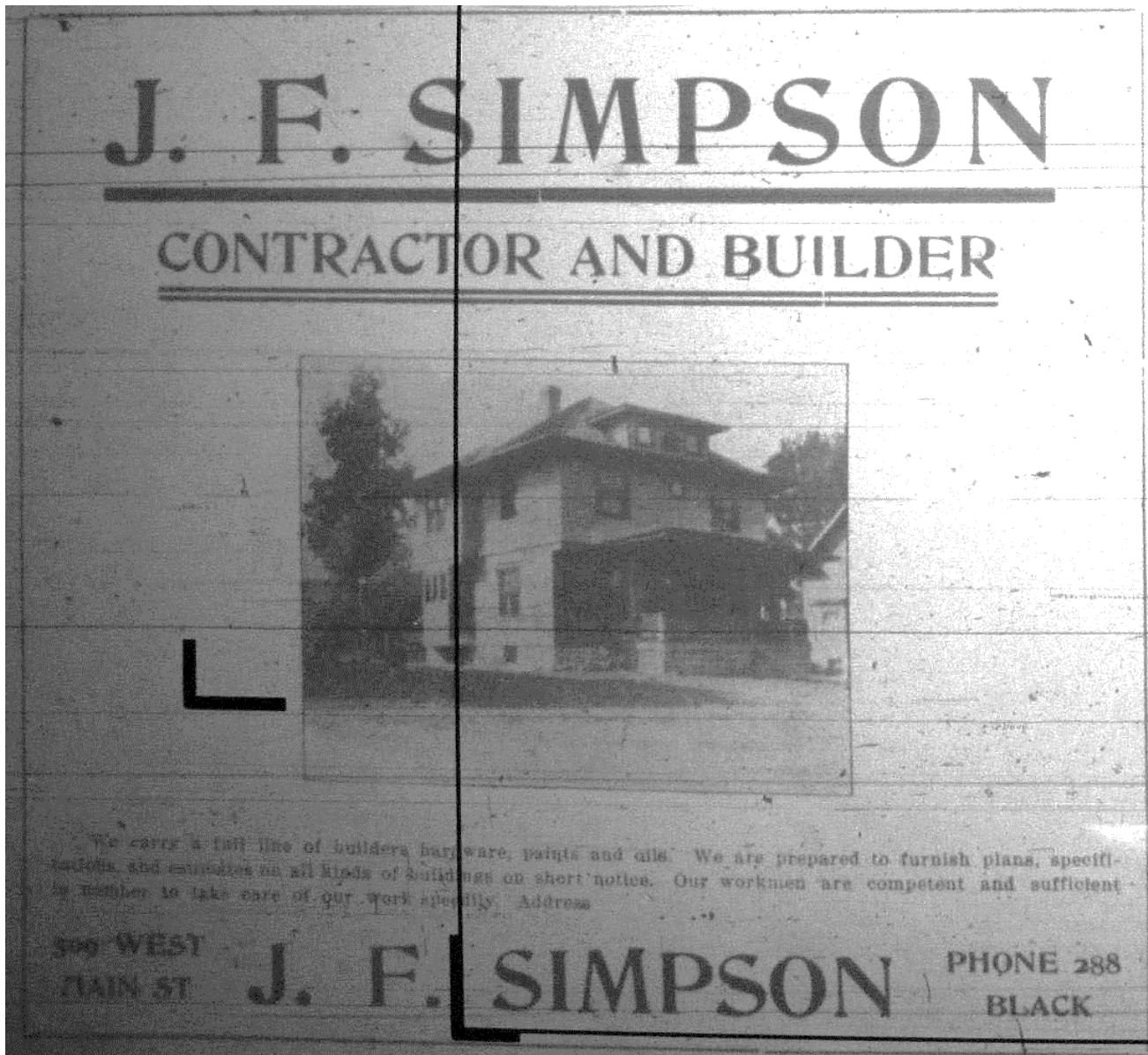
April 26, 1913 – Evening Journal – 20 th anniversary edition – page 2