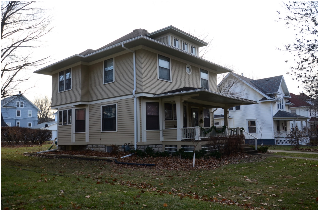
Photograph 92-00405-002 - House, looking southwest (December 2014)