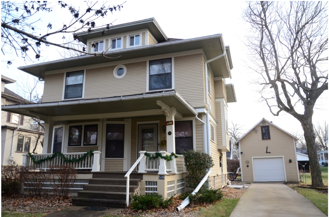
Photograph 92-00405-001 - House, looking southeast (December 2014)