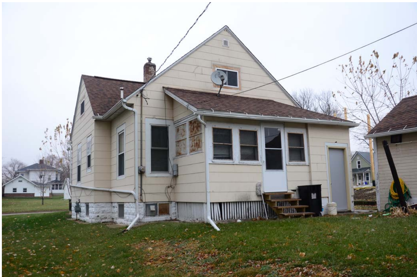
Photograph 92-00743-002 - House, looking northeast (December 2014)