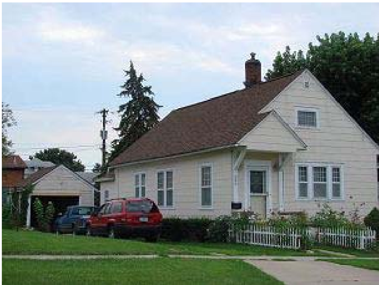
house prior to window replacements