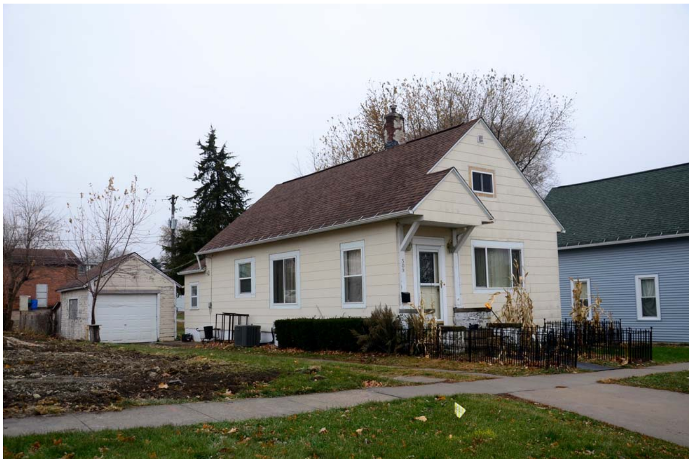
Photograph 92-00743-001 - House, looking southwest (December 2014)