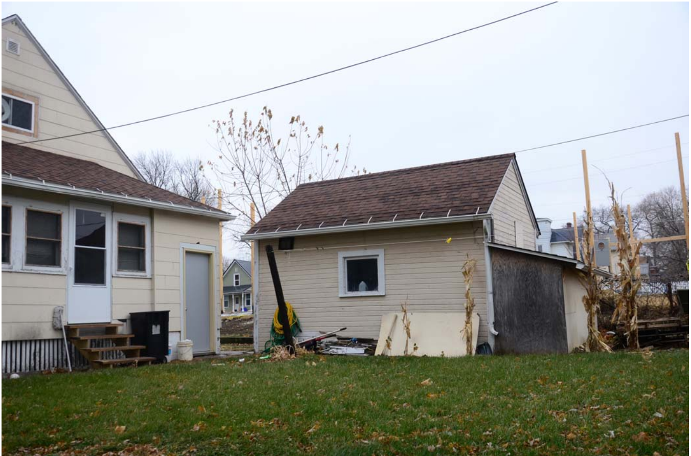
Photograph 92-00743-003 - Garage, looking northeast (December 2014)