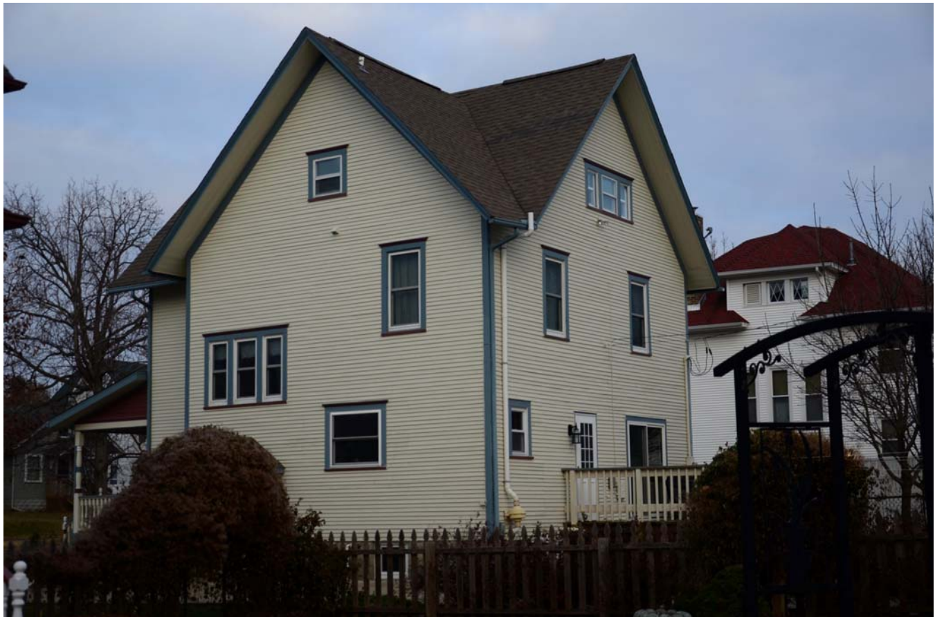
Photograph 92-00408-003 - House, looking northwest (December 2014)