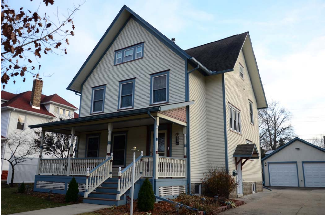
Photograph 92-00408-001 - House, looking southeast (December 2014)