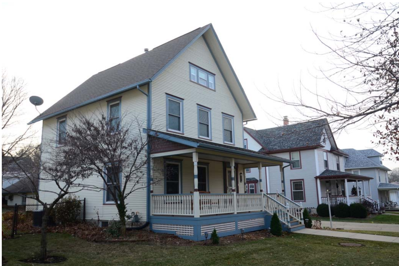
Photograph 92-00408-002 - House, looking southwest (December 2014)