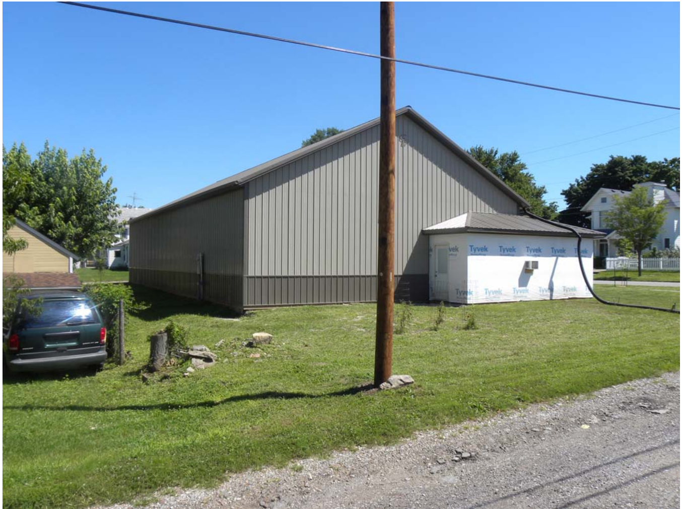
Photograph 92-00808-002 - Building, looking northeast (July 2015)