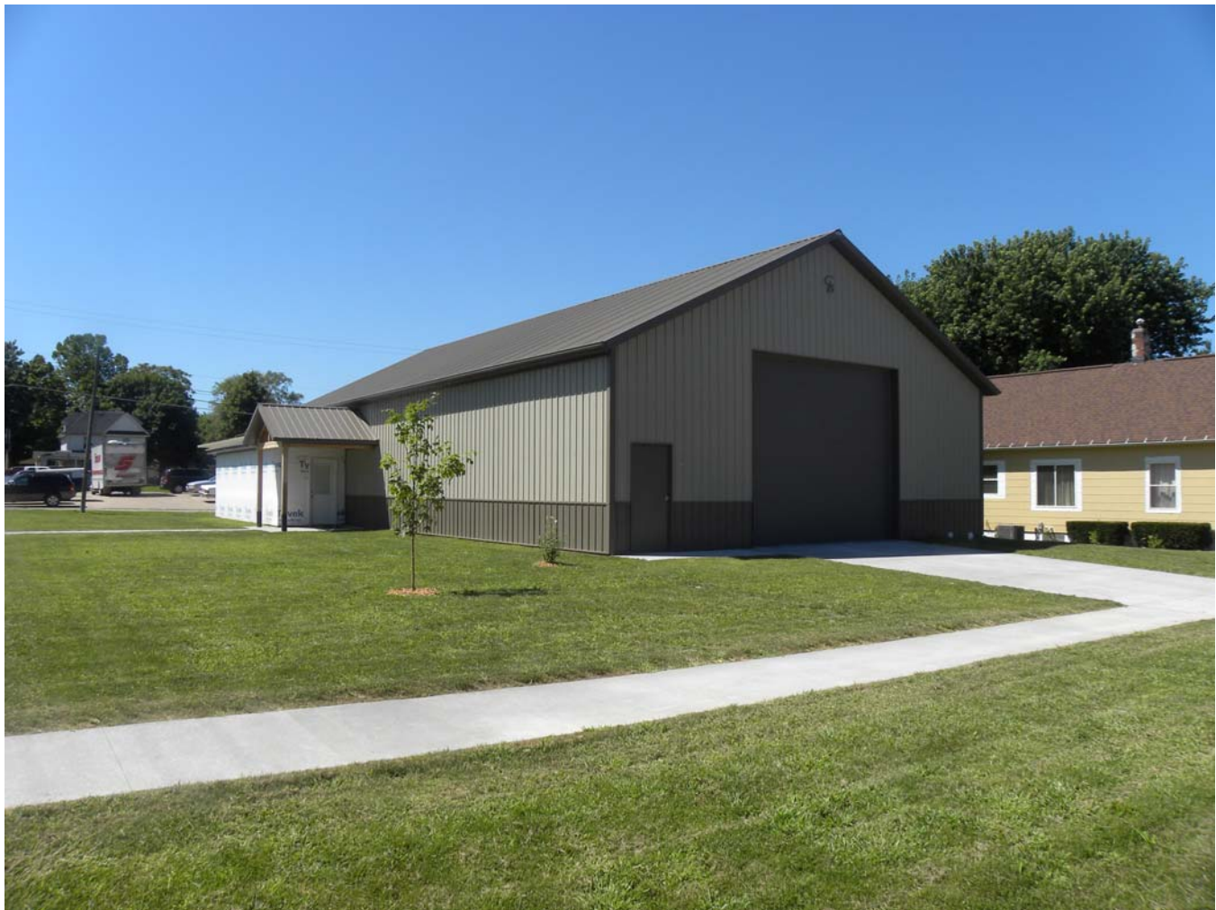
Photograph 92-00808-001 - Building, looking southwest (July 2015)