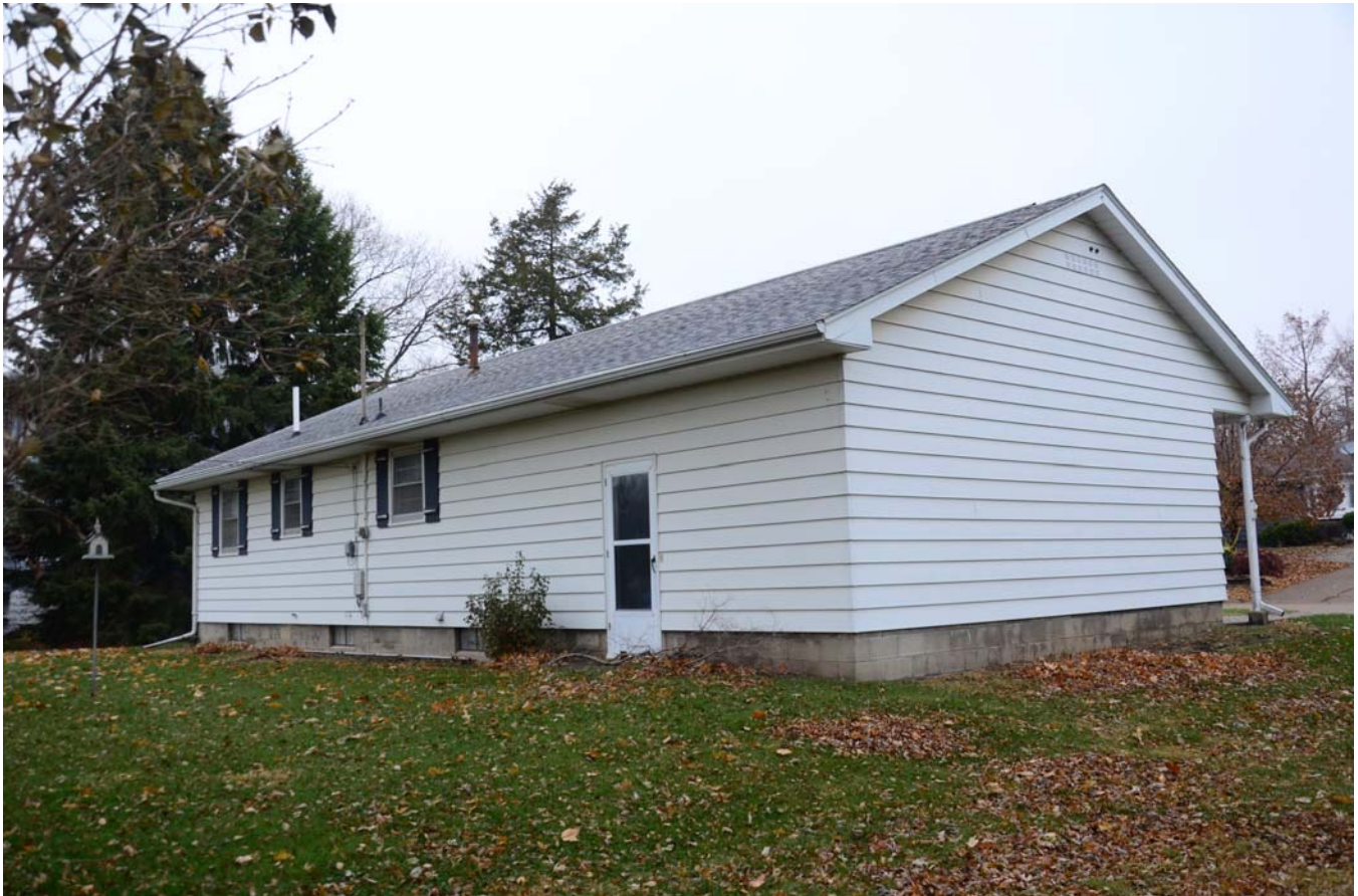
Photograph 92-00740-002 - House, looking southwest (December 2014)