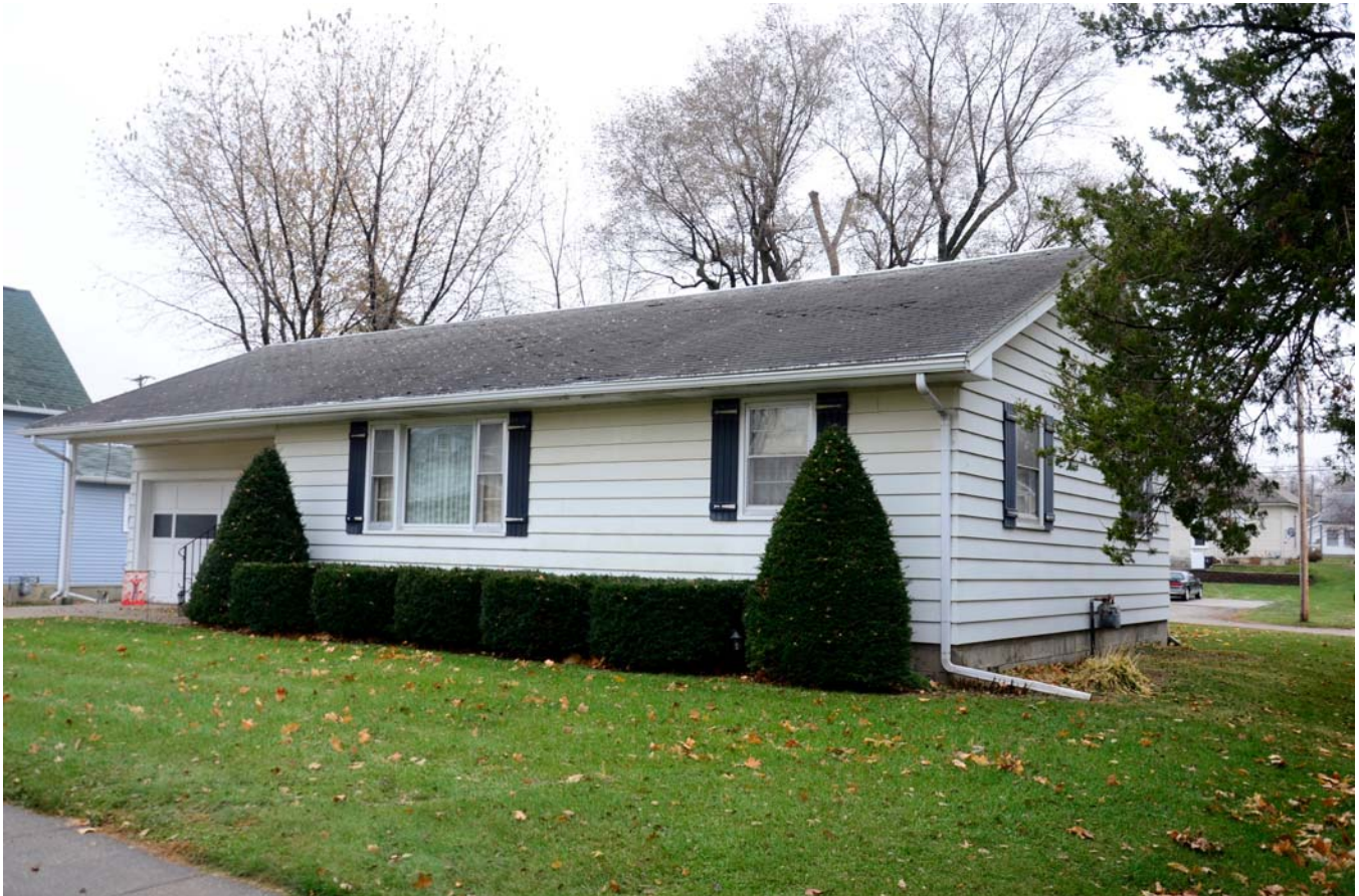
Photograph 92-00745-001 - House, looking southeast (December 2014)