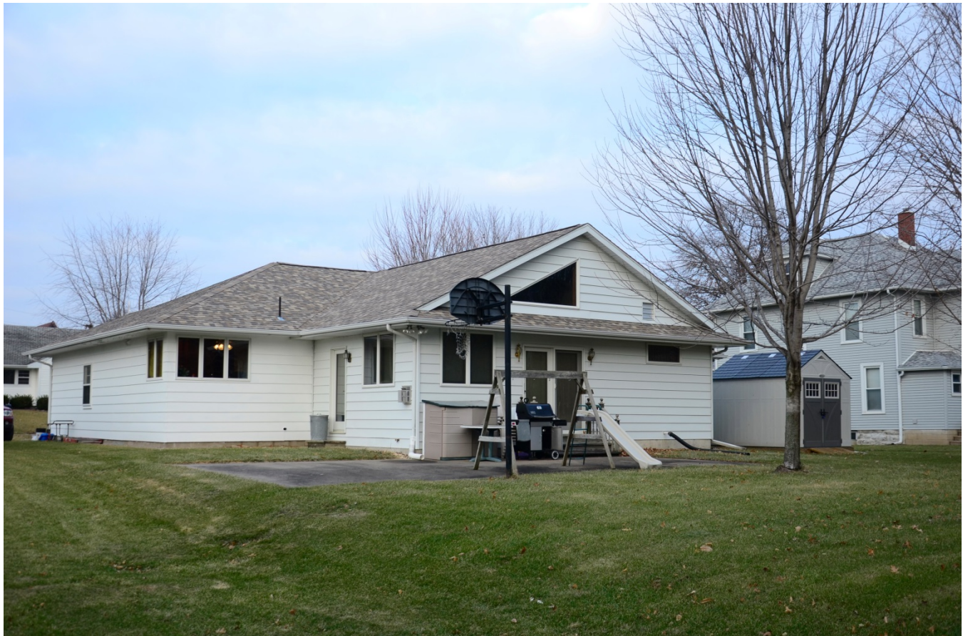
Photograph 92-00777-002 - House, looking northeast (December 2014)