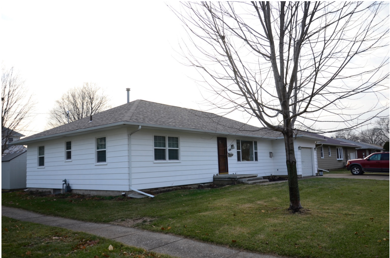
Photograph 92-00777-001 - House, looking southwest (December 2014)