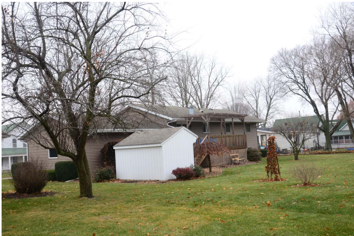
Photograph 92-00746-002 - House, looking southwest (December 2014)