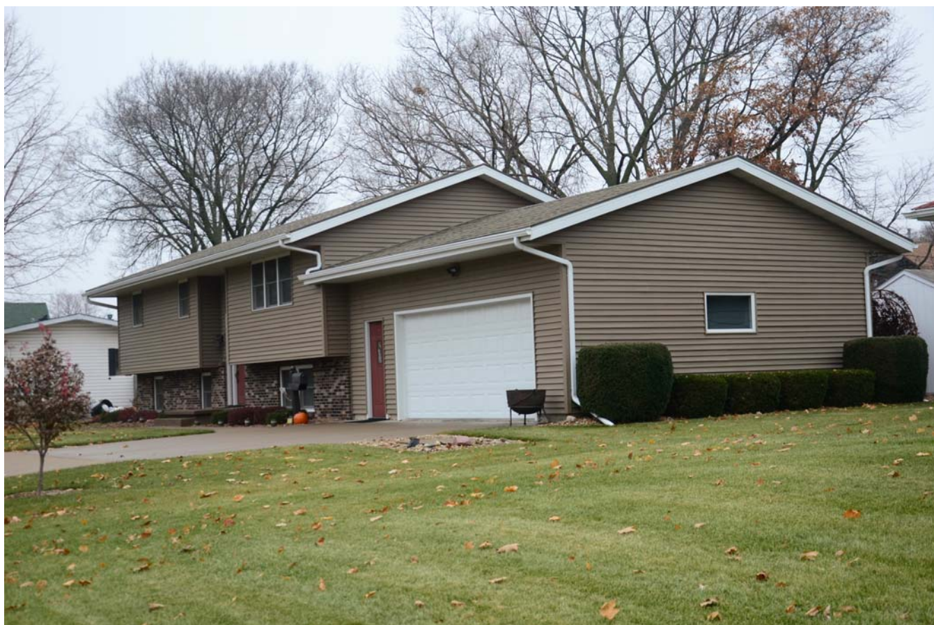
Photograph 92-00746-001 - House, looking northwest (December 2014)