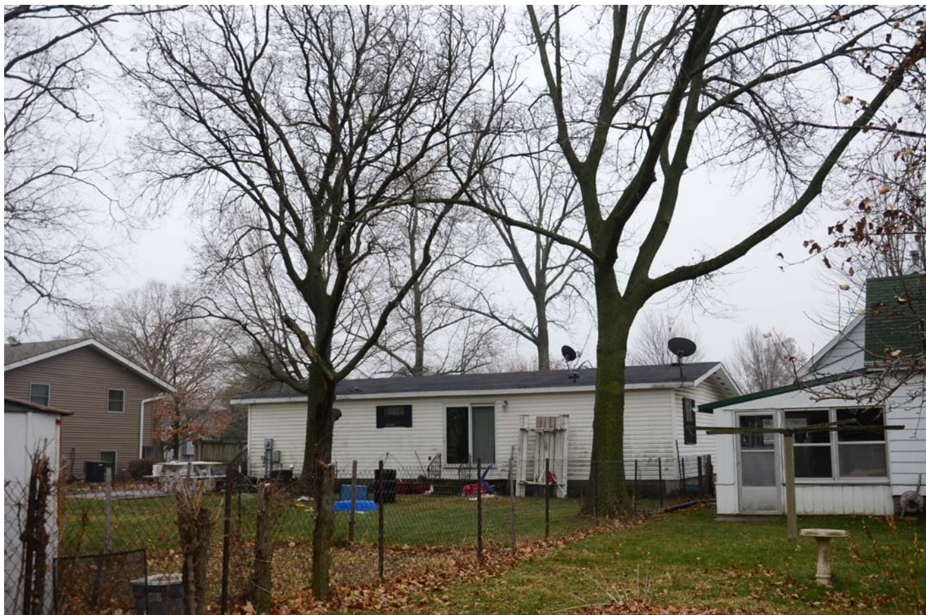
Photograph 92-00747-002 - House, looking south (December 2014)