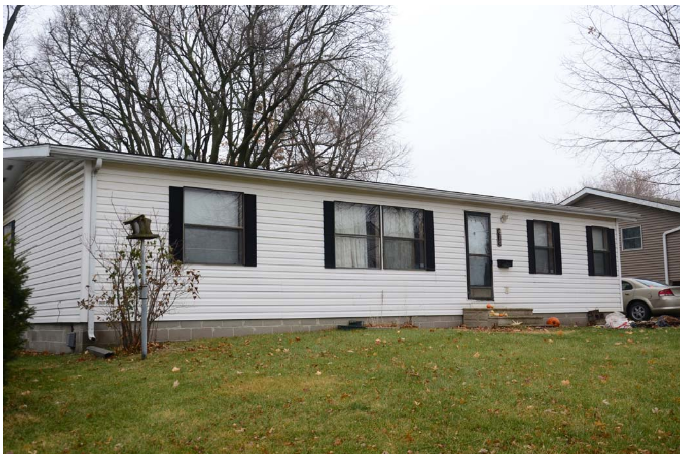
Photograph 92-00747-001 - House, looking northeast (December 2014)