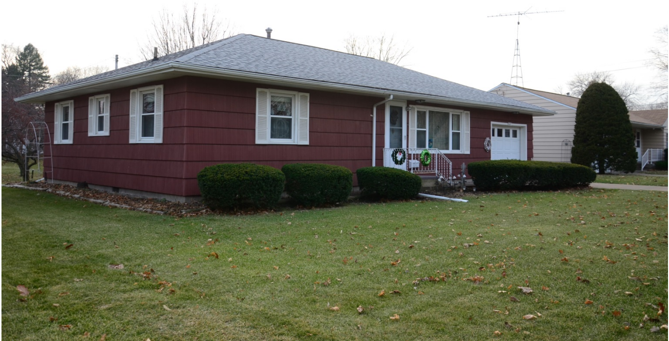
Photograph 92-00778-001 - House, looking southwest (December 2014)