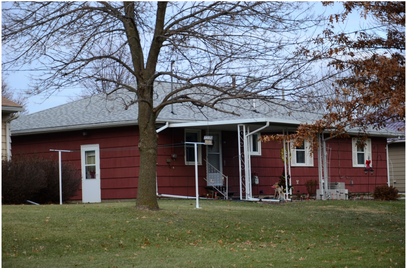
Photograph 92-00778-002 - House, looking northeast (December 2014)