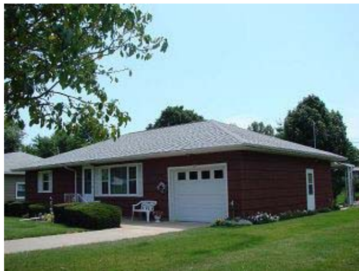
Photo from assessor's website