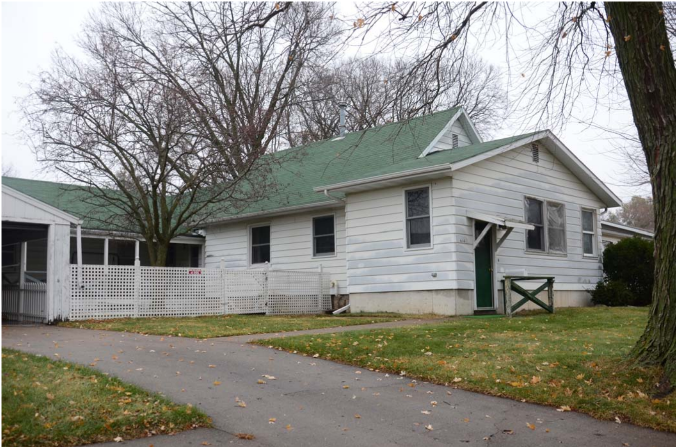
Photograph 92-00748-002 - House, looking northeast (December 2014)