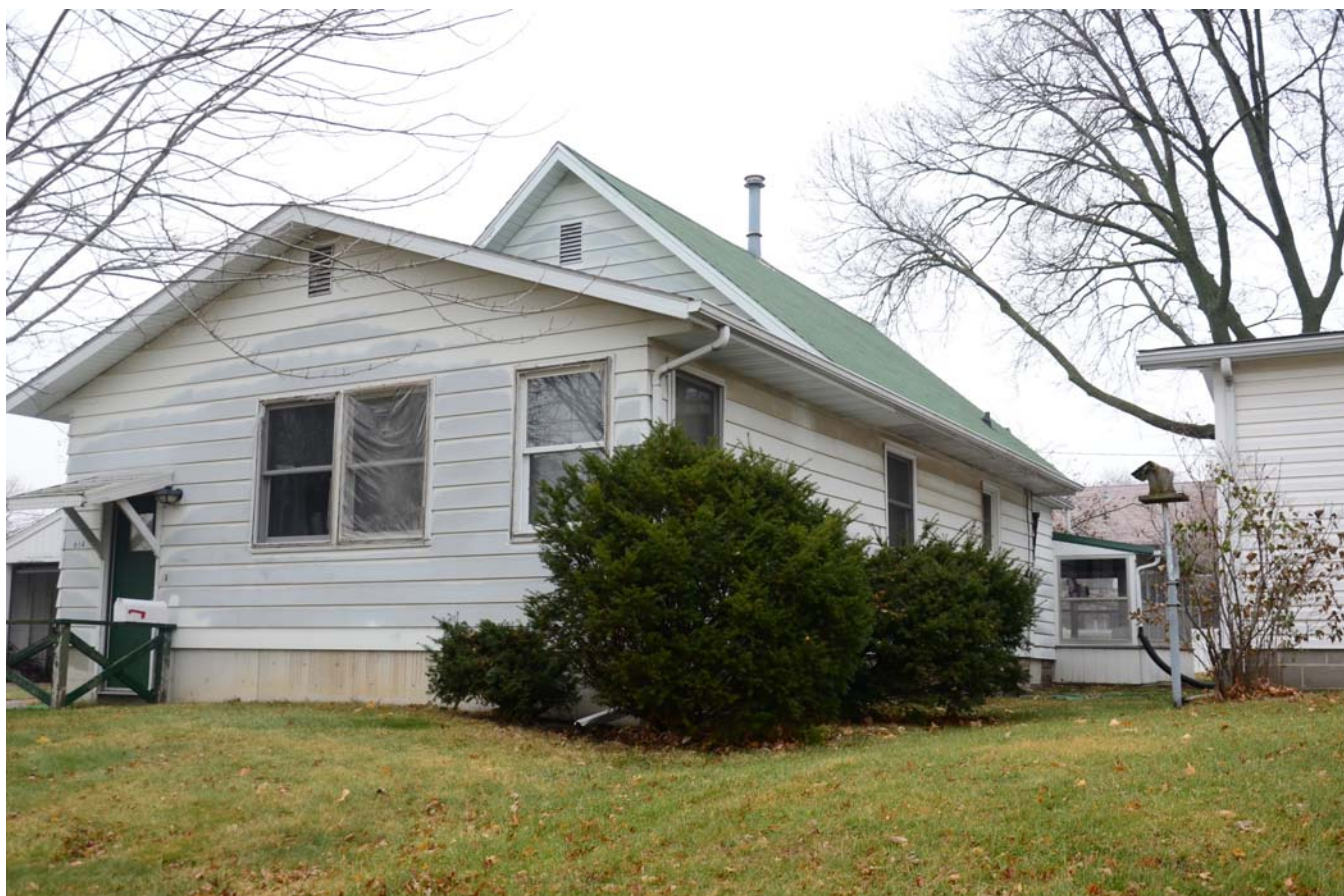
Photograph 92-00748-001 - House, looking northwest (December 2014)