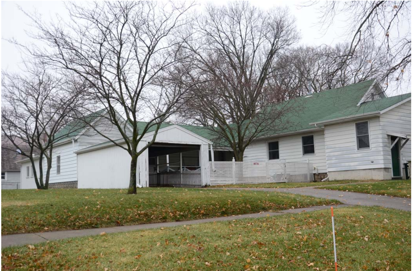
Photograph 92-00748-003 - House, looking northeast (December 2014)