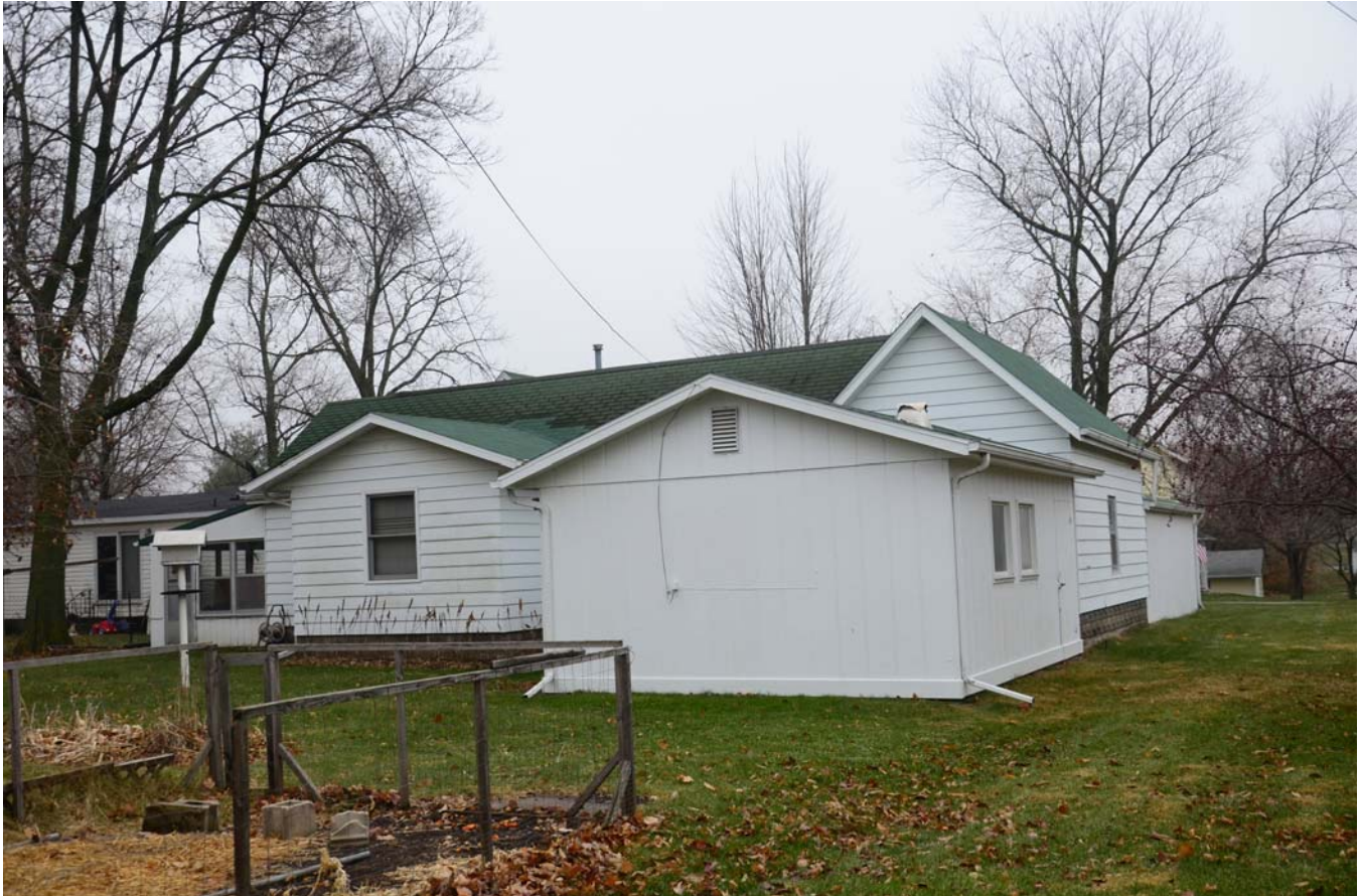
Photograph 92-00748-005 - House, looking southeast (December 2014)