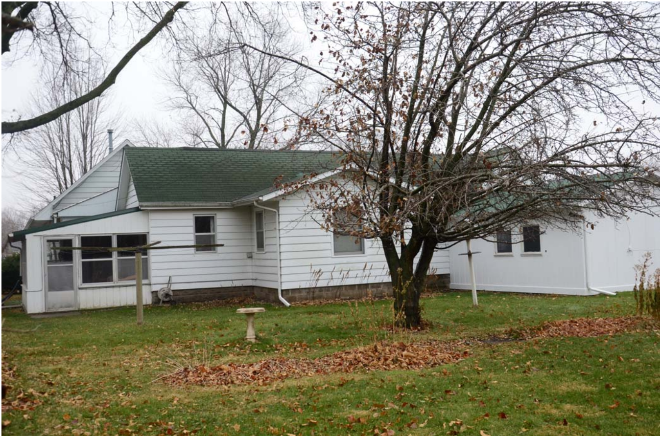
Photograph 92-00748-004 - House, looking southwest (December 2014)