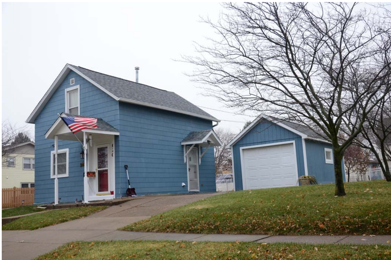
Photograph 92-00749-001 - House, looking northwest (December 2014)