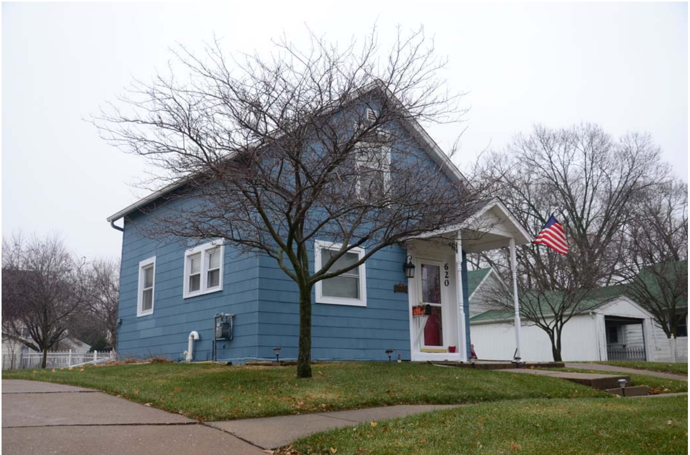
Photograph 92-00749-002 - House, looking northeast (December 2014)