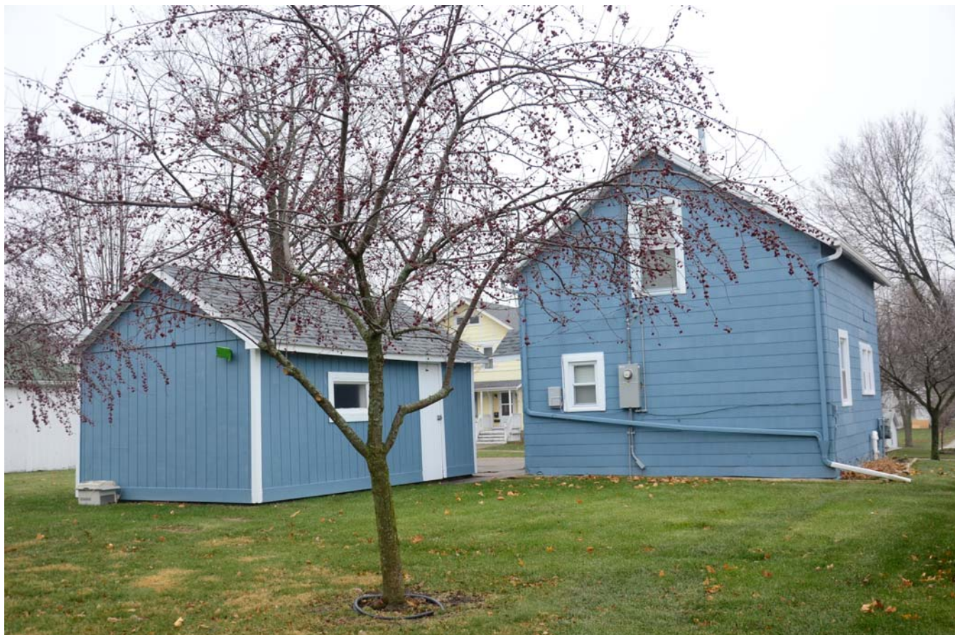
Photograph 92-00749-003 - House, looking southeast (December 2014)