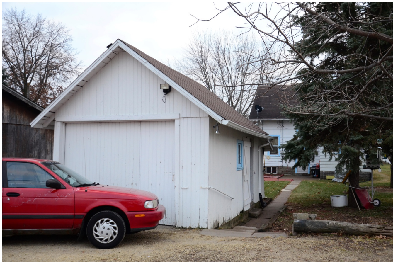
Photograph 92-00782-004 - Garage, looking southeast (December 2014)