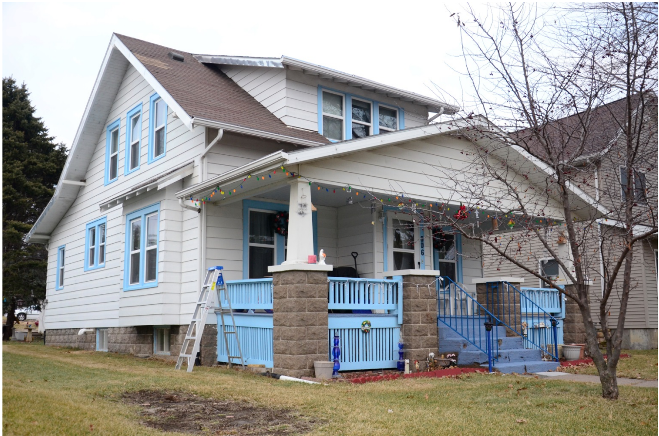
Photograph 92-00782-001 - House, looking northeast (December 2014)