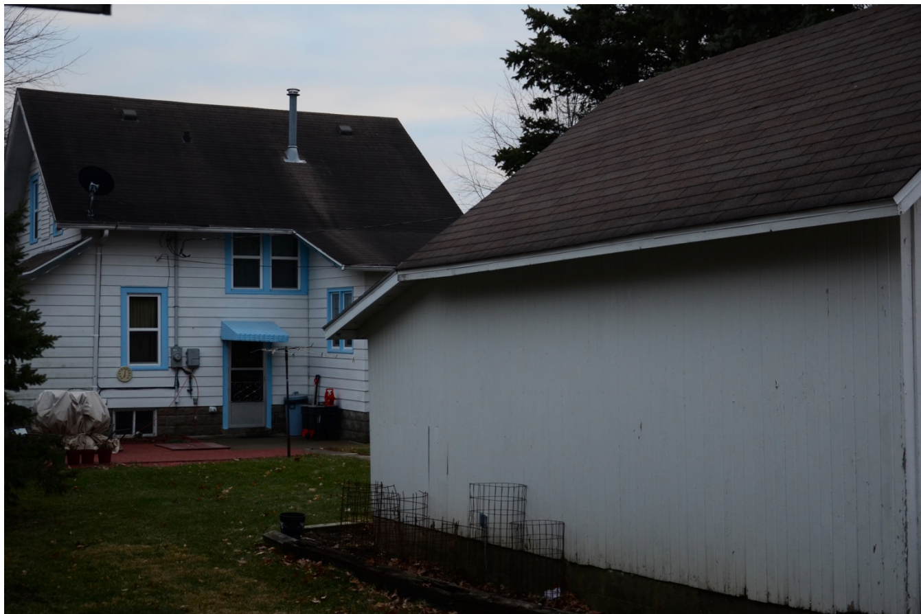
Photograph 92-00782-003 - House, looking southwest (December 2014)