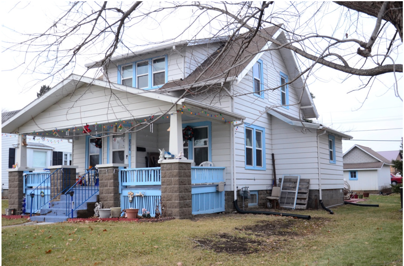
Photograph 92-00782-001 - House, looking northwest (December 2014)