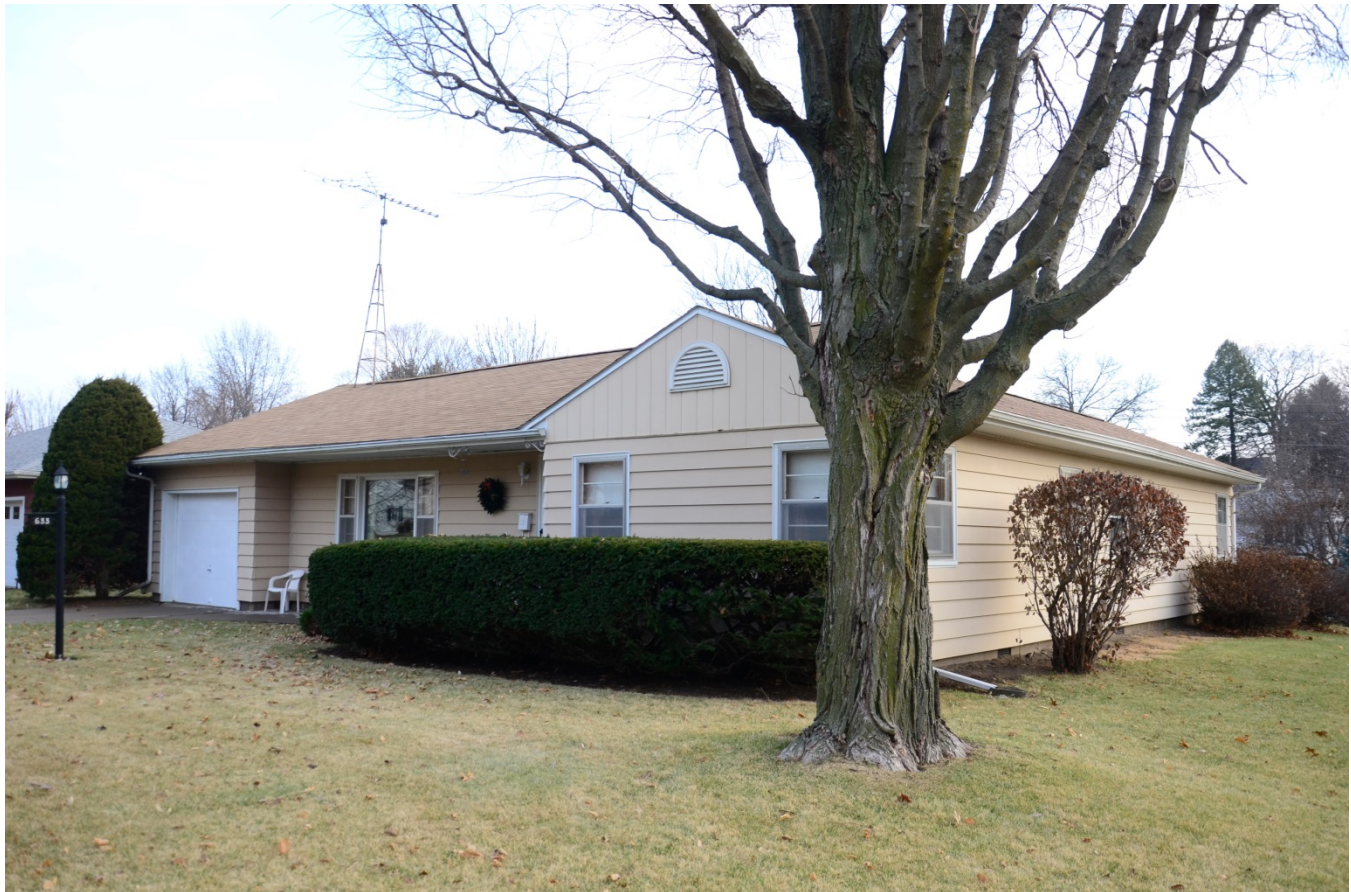
Photograph 92-00780-002 - House, looking southeast (December 2014)