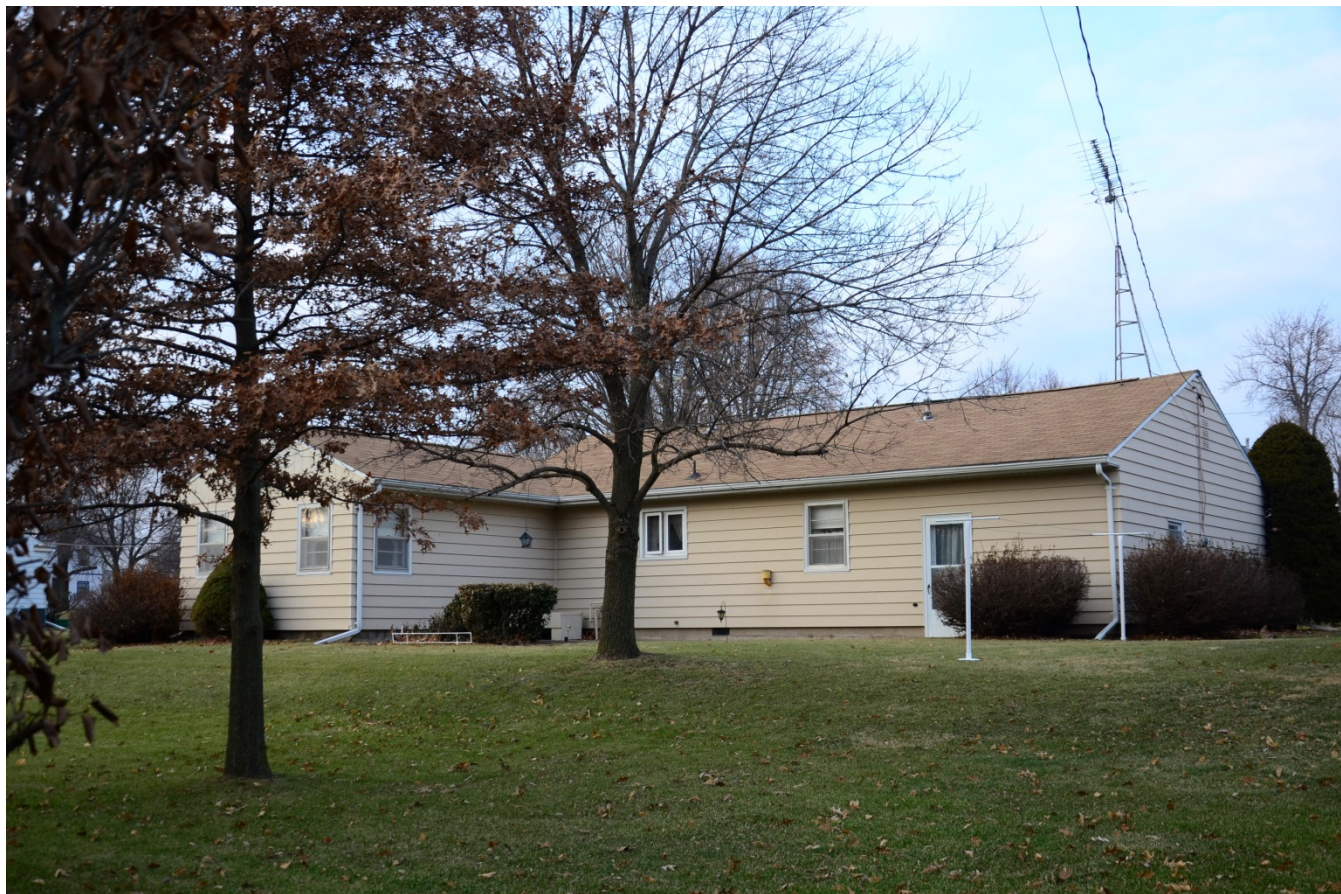
Photograph 92-00780-003 - House, looking northwest (December 2014)