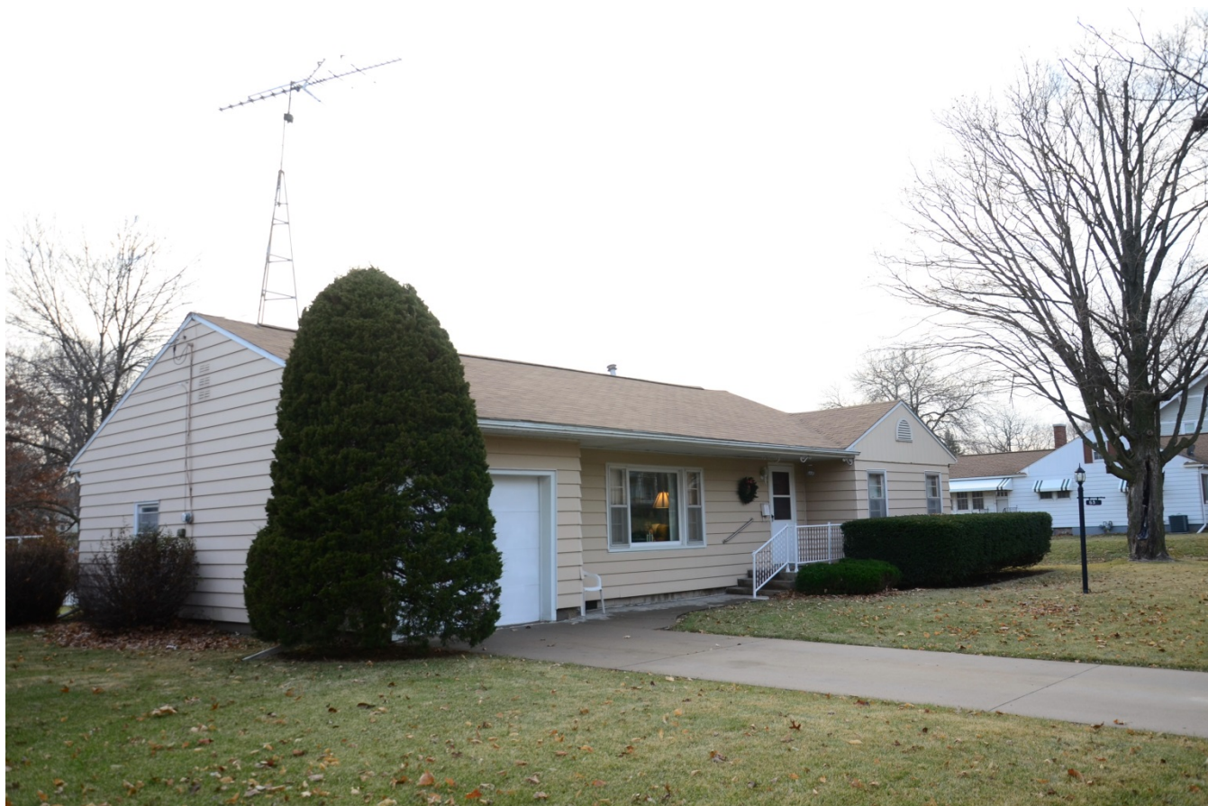
Photograph 92-00780-001 - House, looking southwest (December 2014)