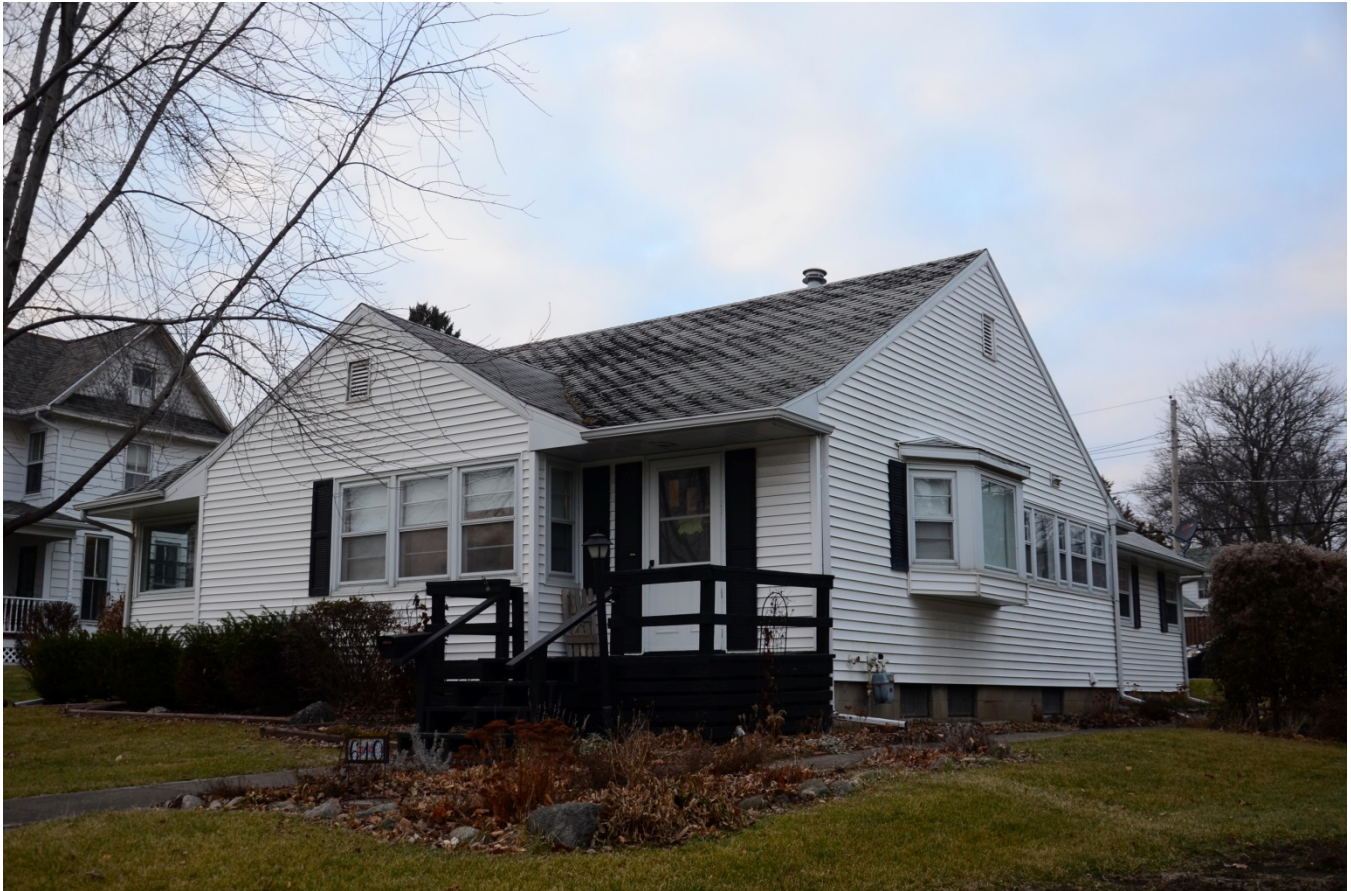
Photograph 92-00783-001 - House, looking northwest (December 2014)