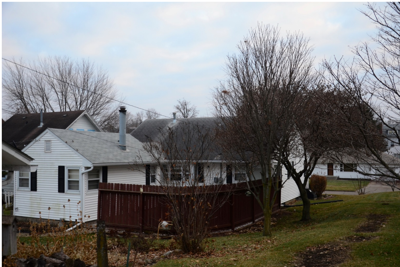
Photograph 92-00783-003 - House, looking southeast (December 2014)