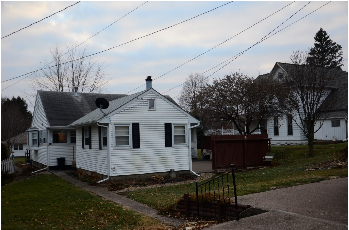
Photograph 92-00783-004 - House, looking southwest (December 2014)