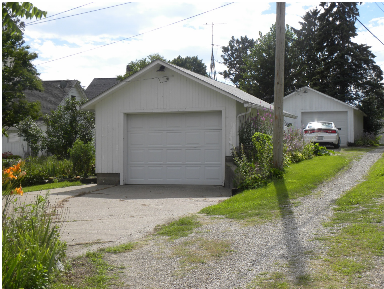
Photograph 92-00783-005 - Garage, looking southwest (July 2015)