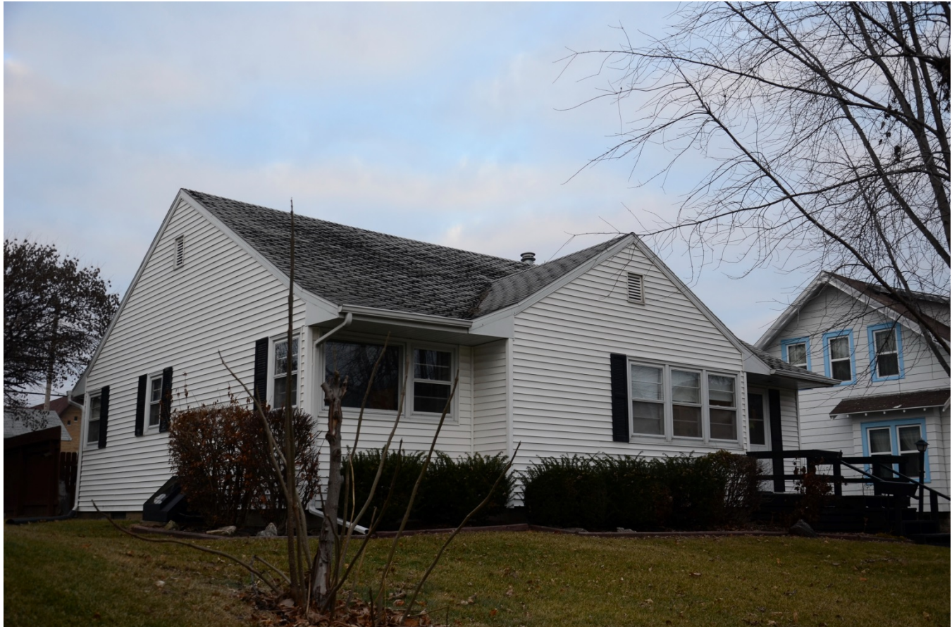
Photograph 92-00783-002 - House, looking northeast (December 2014)