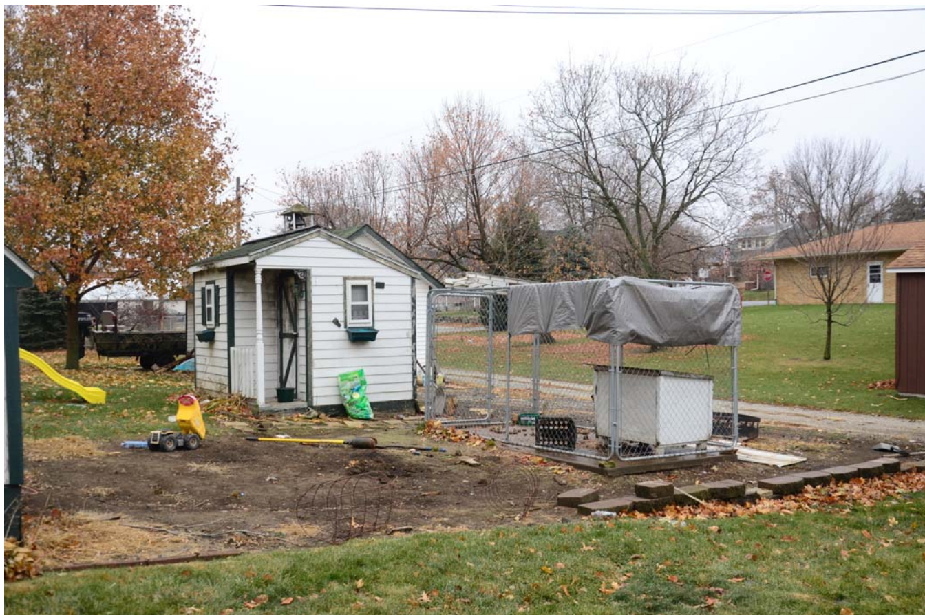
Photograph 92-00752-005 - Sheds, looking southeast (December 2014)