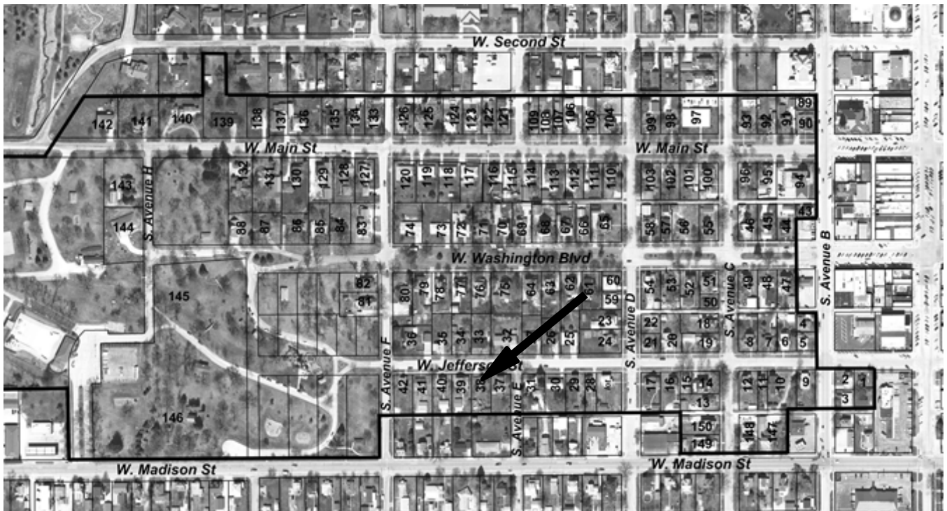
2009 aerial photograph (Washington County) – line indicates survey/research area boundary