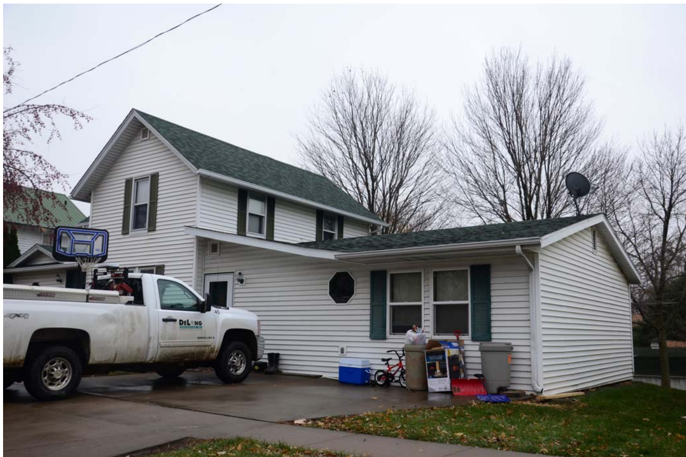
Photograph 92-00752-002 - House, looking southeast (December 2014)