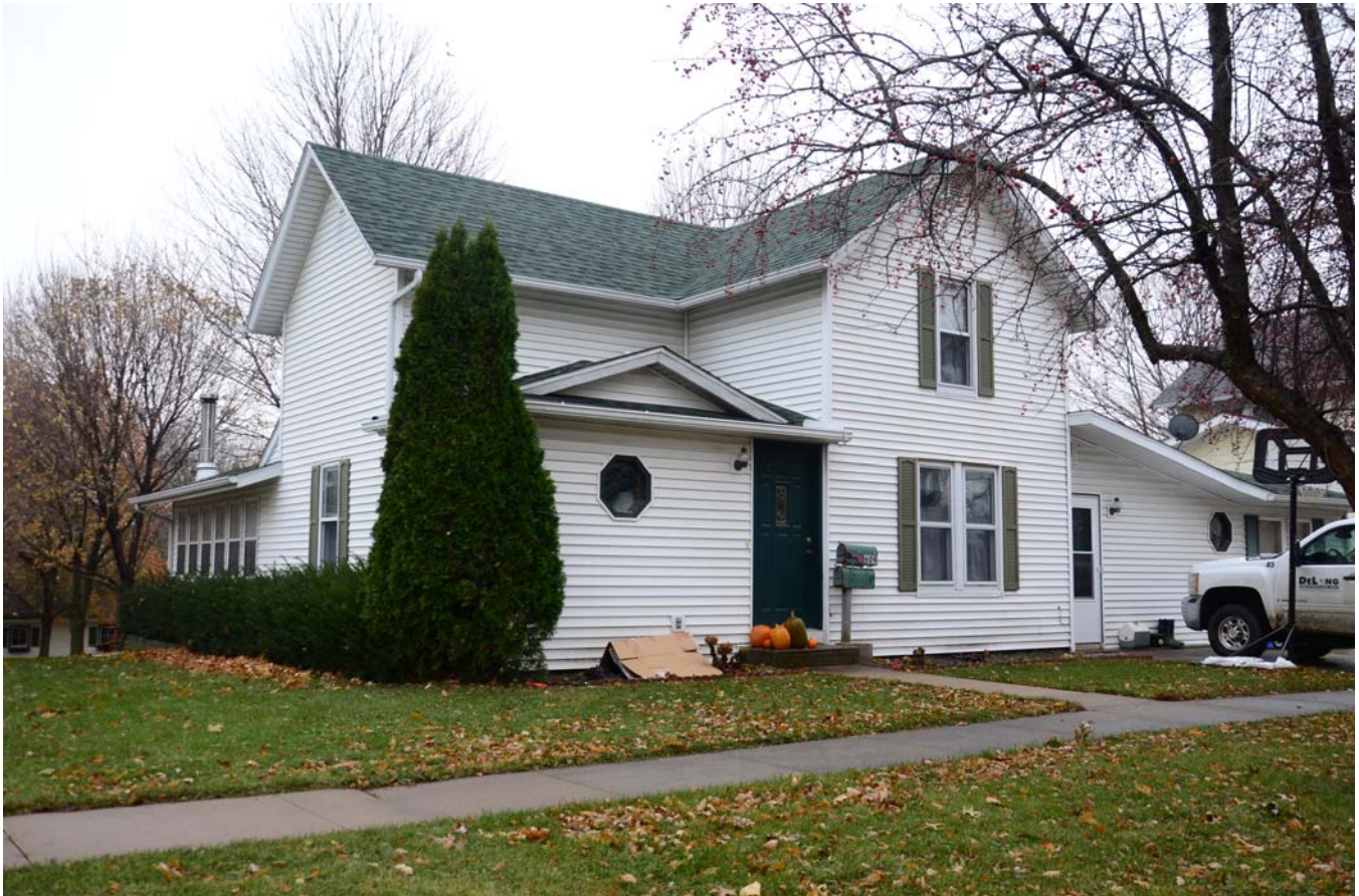
Photograph 92-00752-001 - House, looking southwest (December 2014)