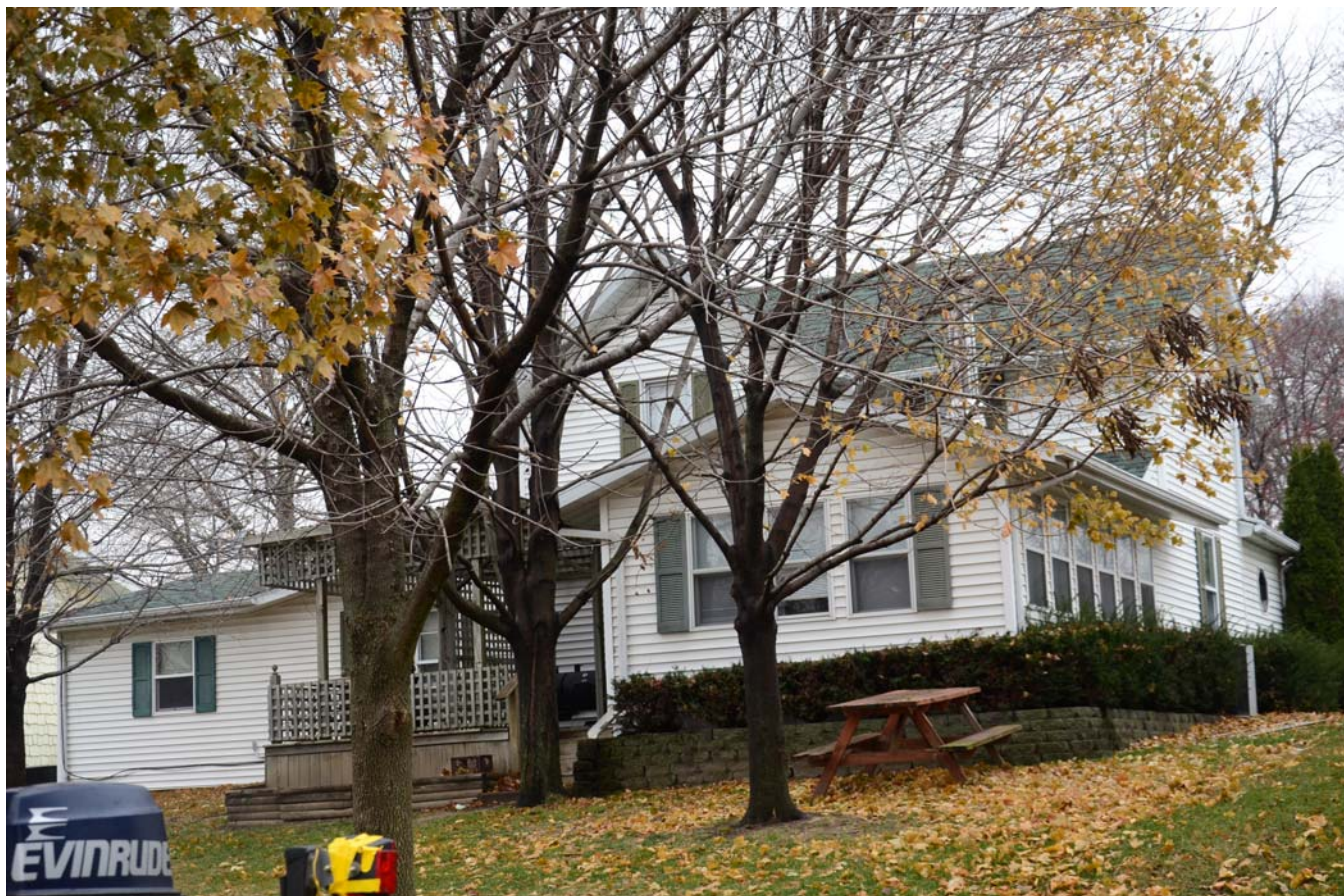
Photograph 92-00752-004 - House, looking northwest (December 2014)