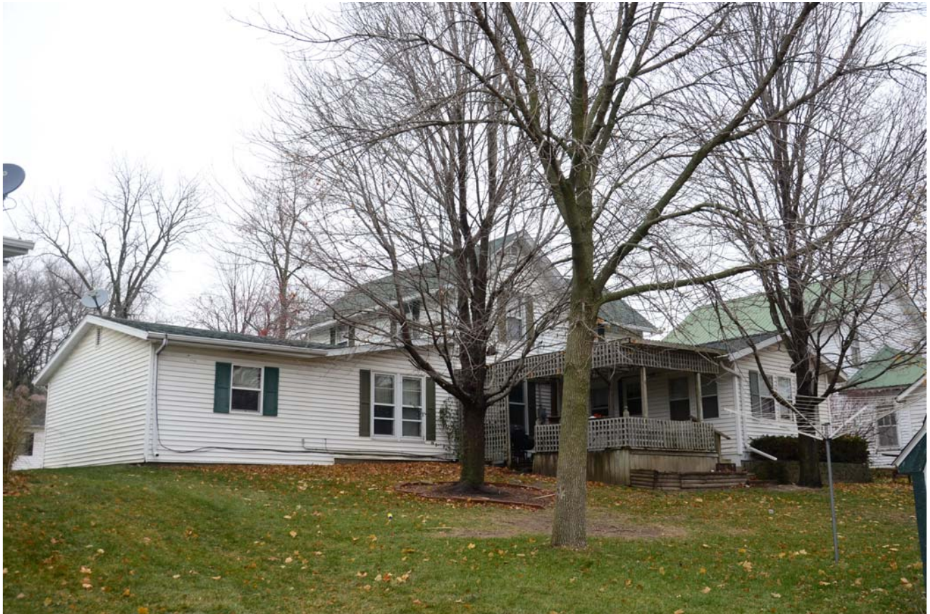
Photograph 92-00752-003 - House, looking northeast (December 2014)