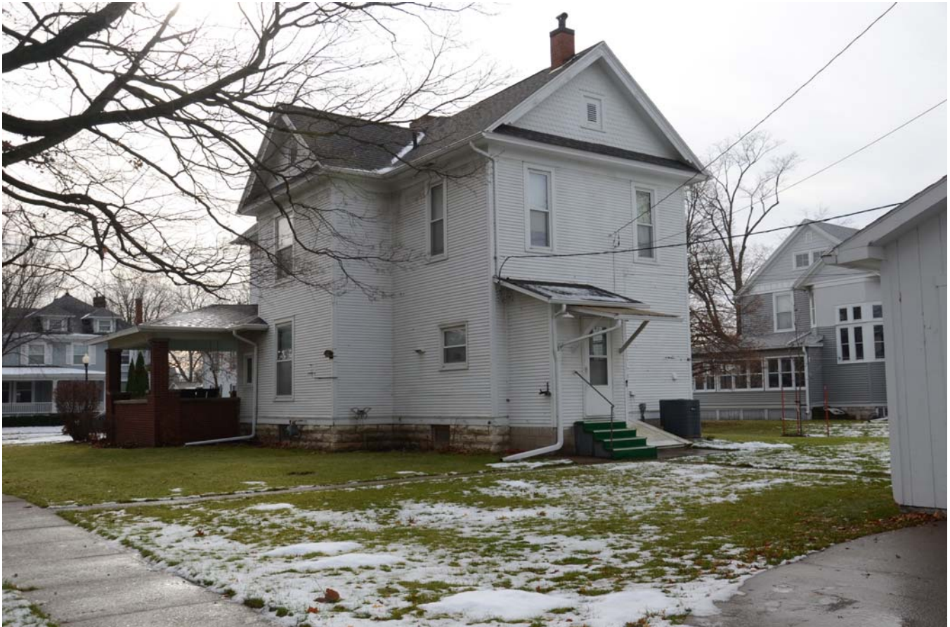
Photograph 92-00385-003 - House, looking southeast (December 2014)