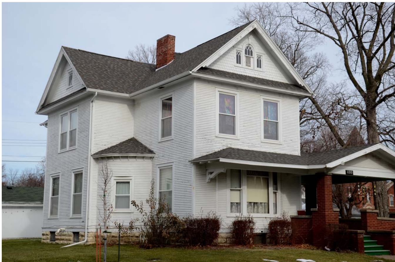
Photograph 92-00385-002 - House, looking northeast (December 2014)