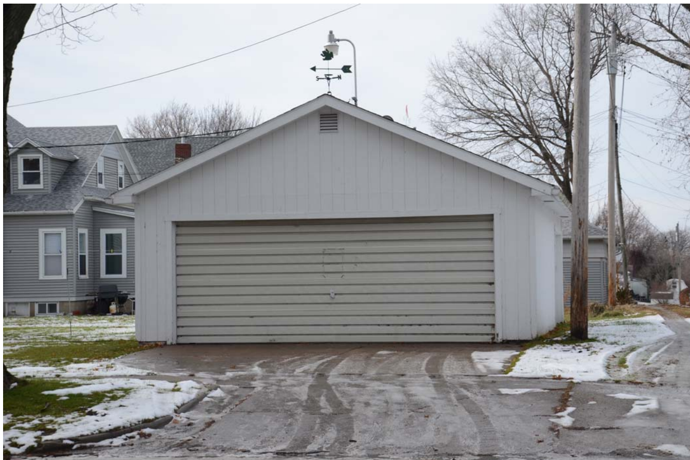
Photograph 92-00385-004 - Garage, looking west (December 2014)