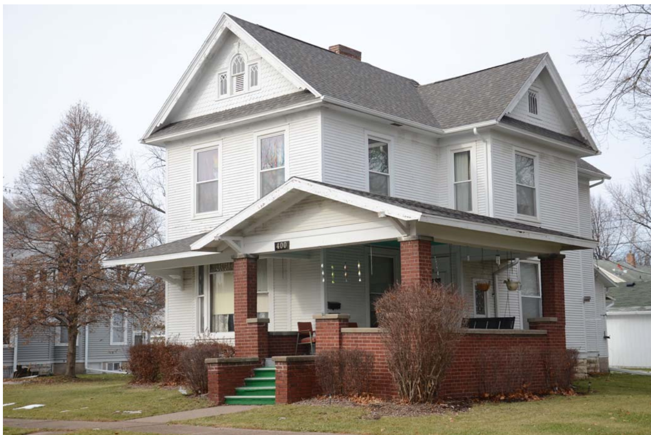
Photograph 92-00385-001 - House, looking northwest (December 2014)