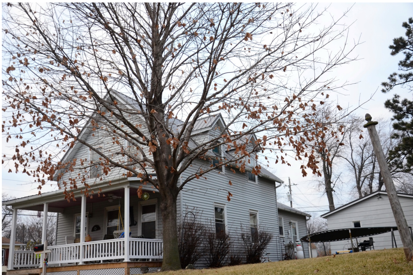
Photograph 92-00786-002 - House, looking northwest (December 2014)