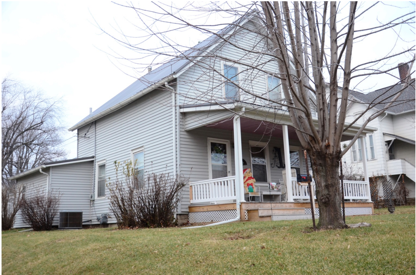
Photograph 92-00786-001 - House, looking northeast (December 2014)