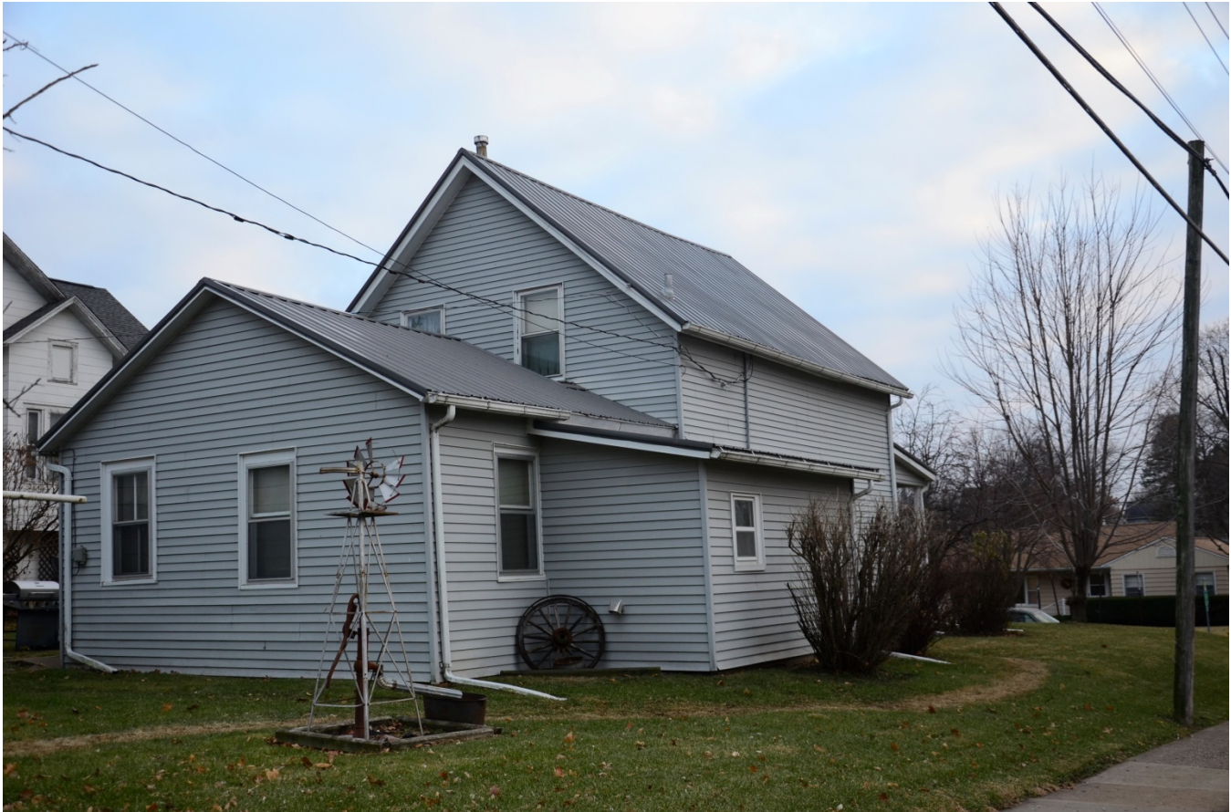
Photograph 92-00786-003 - House, looking southeast (December 2014)