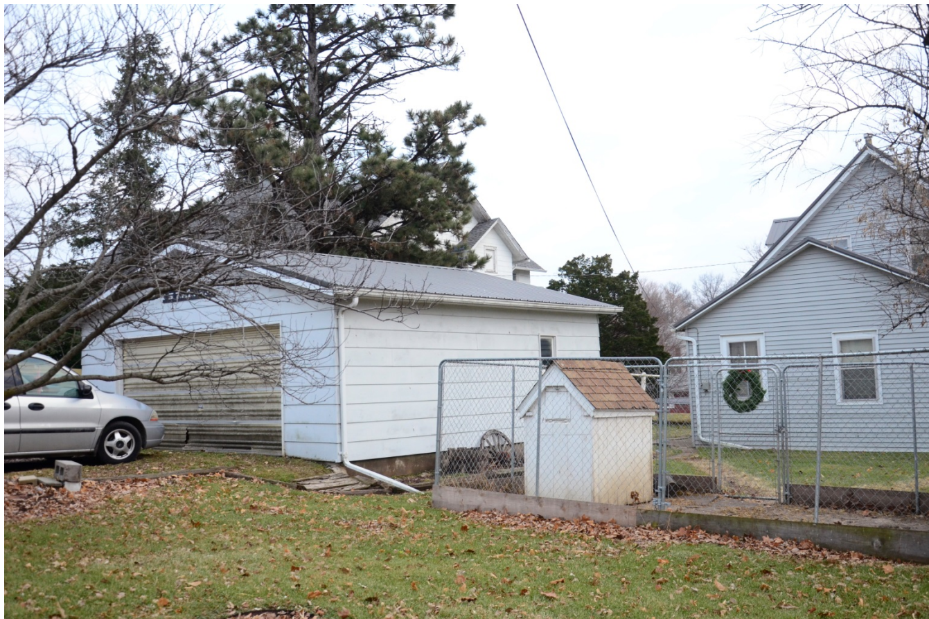
Photograph 92-00786-004 - Garage, looking southeast (December 2014)