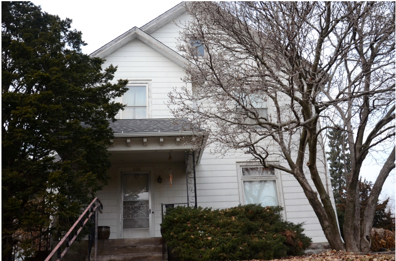
Photograph 92-00785-001 - House, looking north (December 2014)