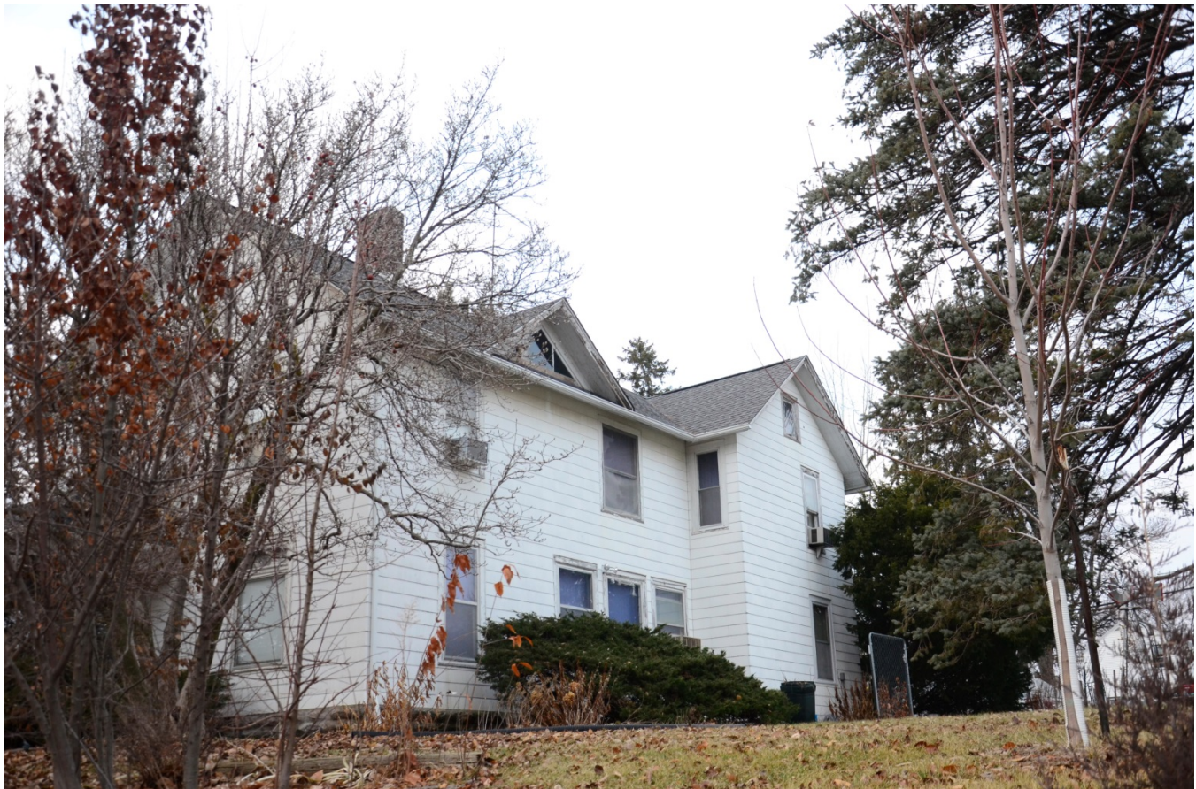
Photograph 92-00785-003 - House, looking northwest (December 2014)