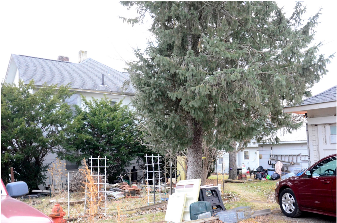
Photograph 92-00785-004 - House, looking southwest (December 2014)