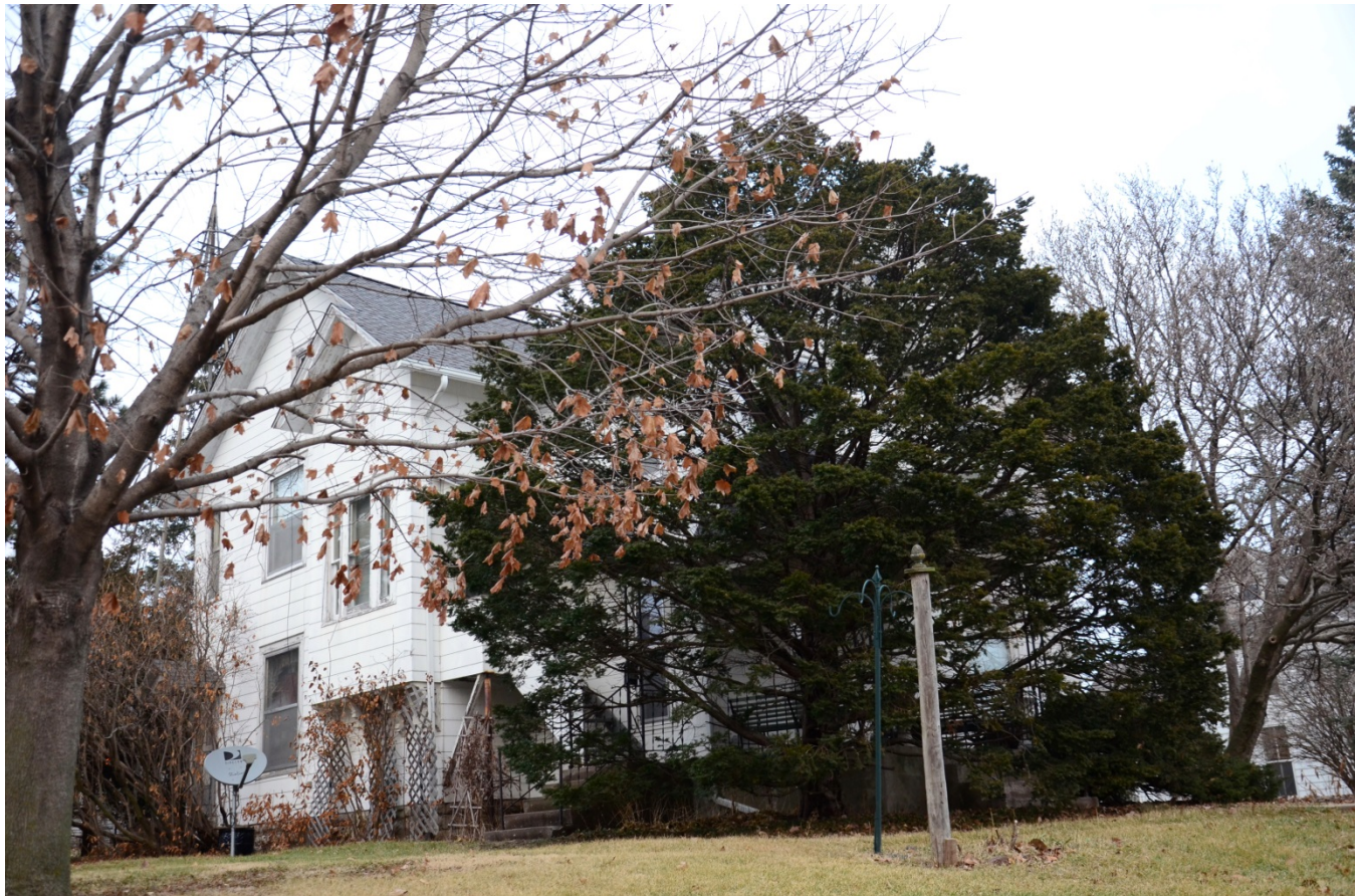
Photograph 92-00785-002 - House, looking northeast (December 2014)