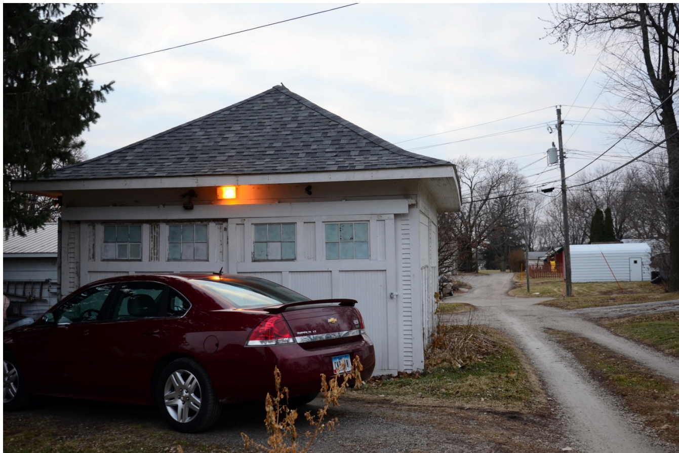
Photograph 92-00785-005 - Garage, looking west (December 2014)