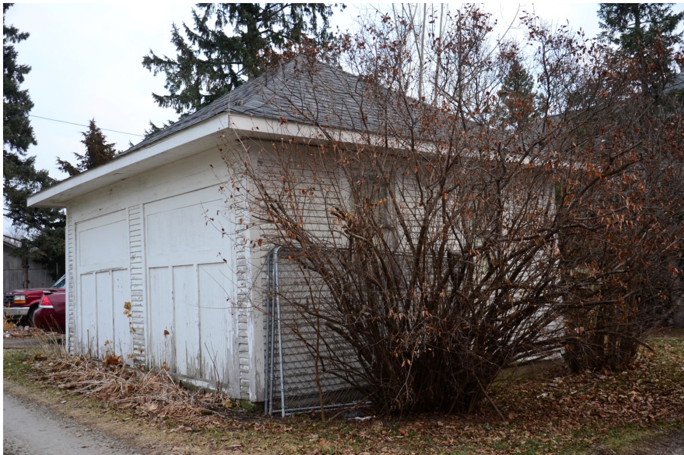
Photograph 92-00785-006 - Garage, looking west (December 2014)