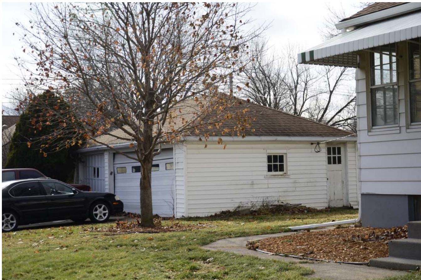
Photograph 92-00787-003 - Garage, looking southwest (December 2014)