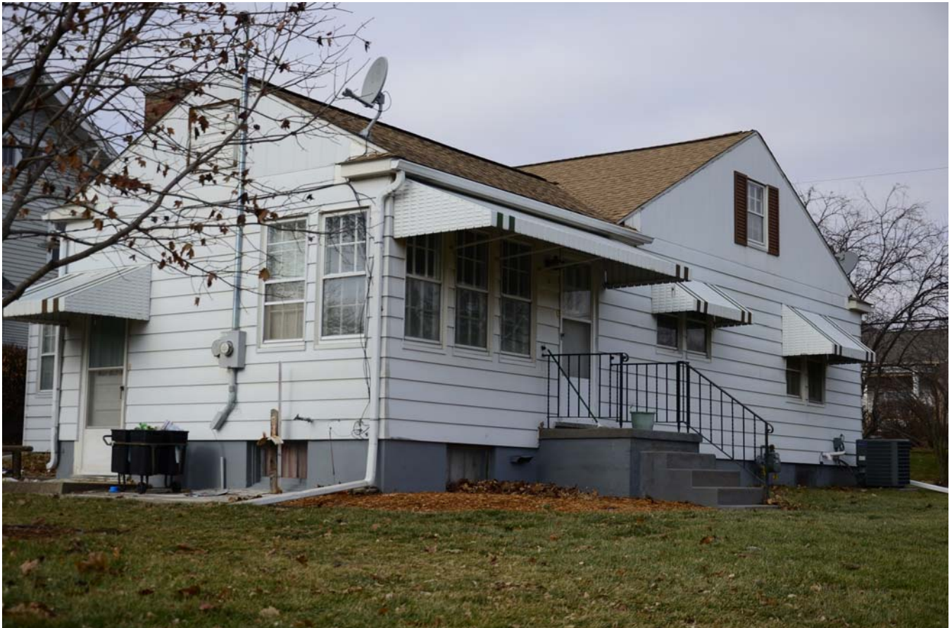
Photograph 92-00787-002 - House, looking northwest (December 2014)