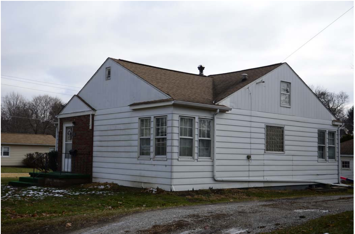
Photograph 92-00787-001 - House, looking southeast (December 2014)