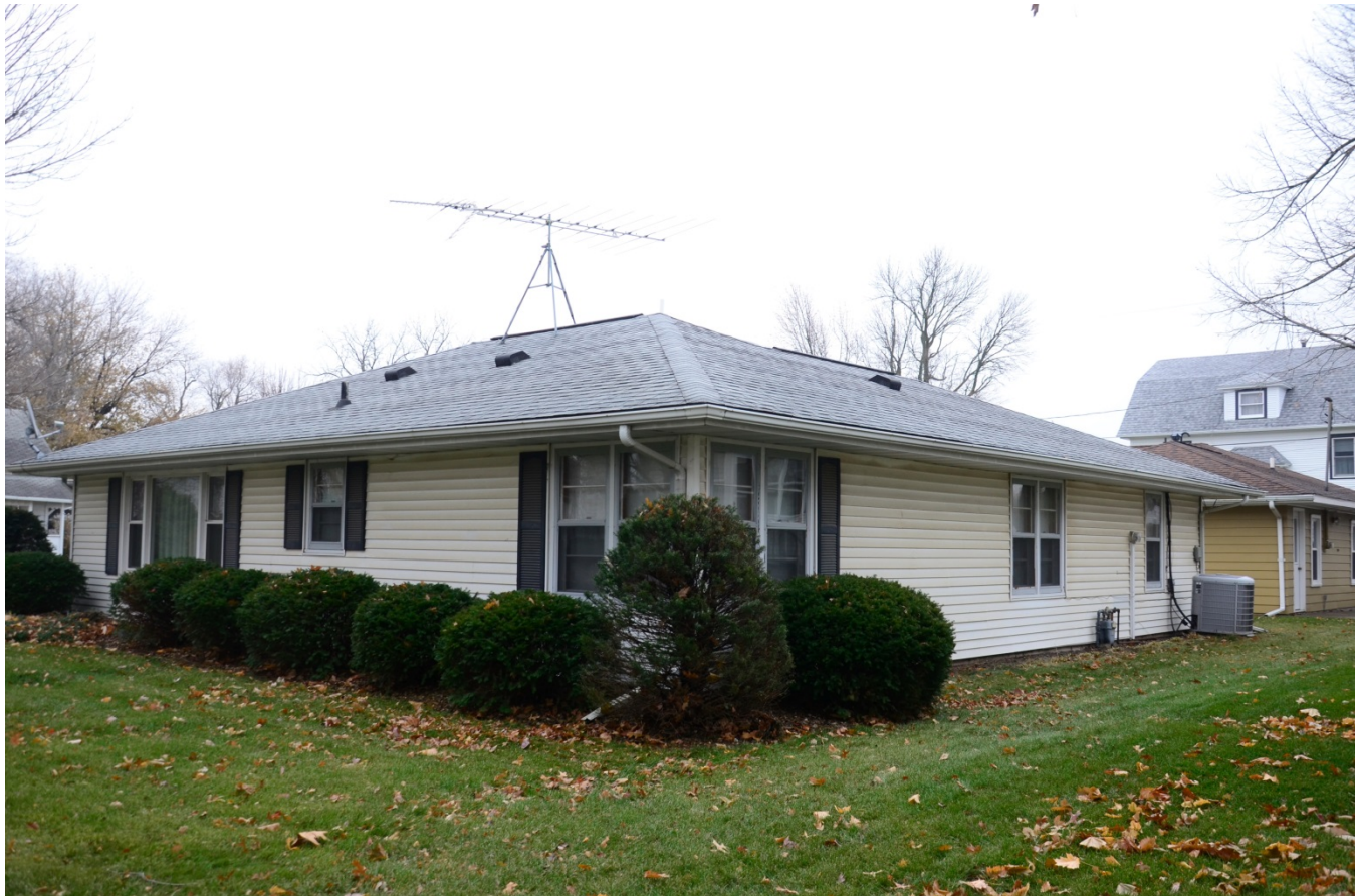
Photograph 92-00761-002 - House, looking southeast (December 2014)