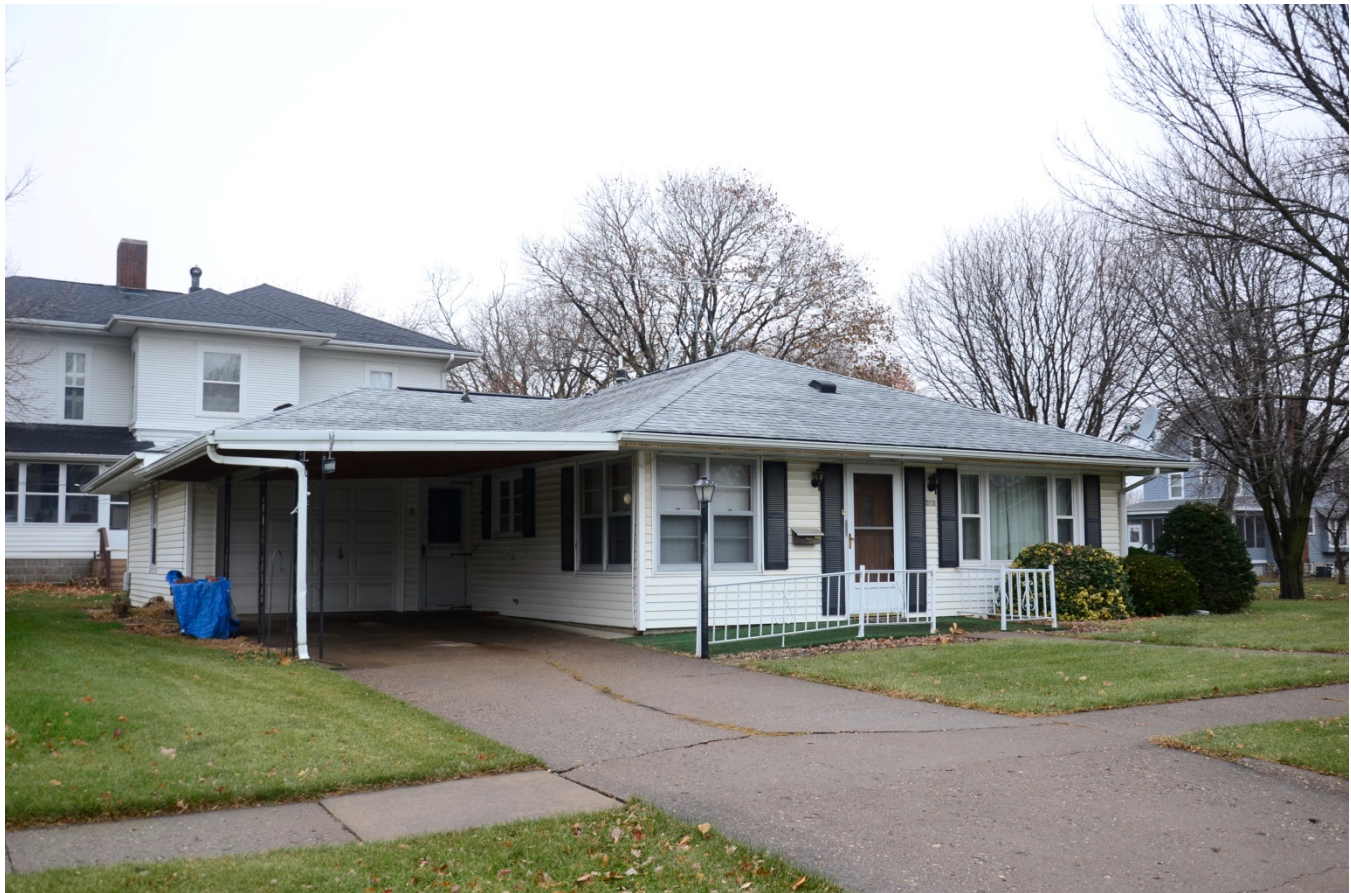
Photograph 92-00761-001 - House, looking northwest (December 2014)