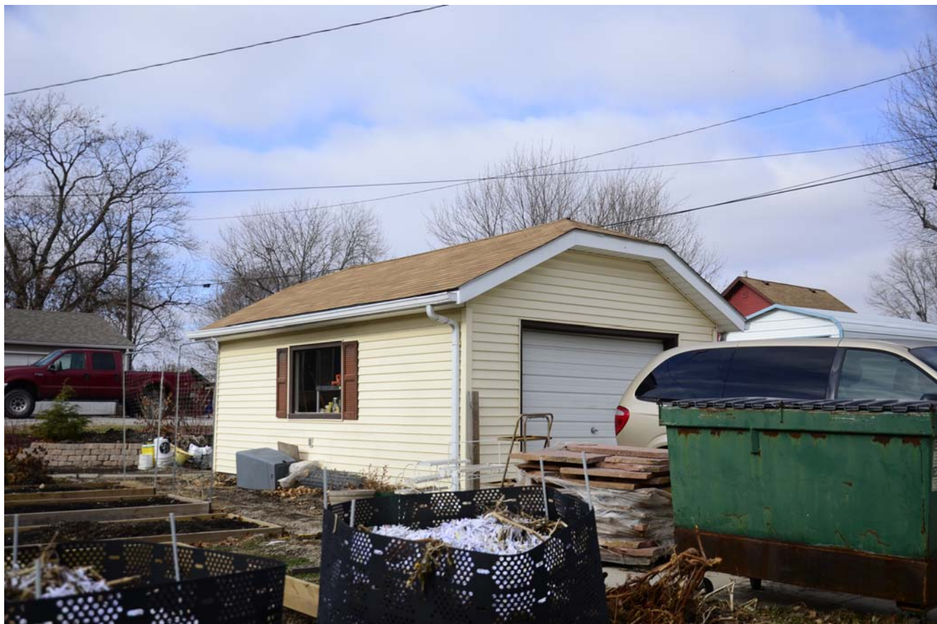
Photograph 92-00793-003 - Garage, looking northeast (December 2014)