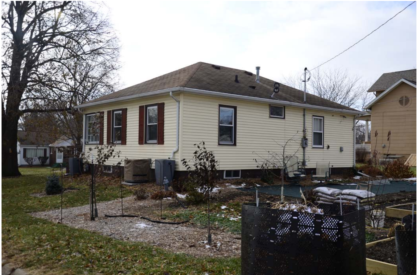
Photograph 92-00793-002 - House, looking southwest (December 2014)