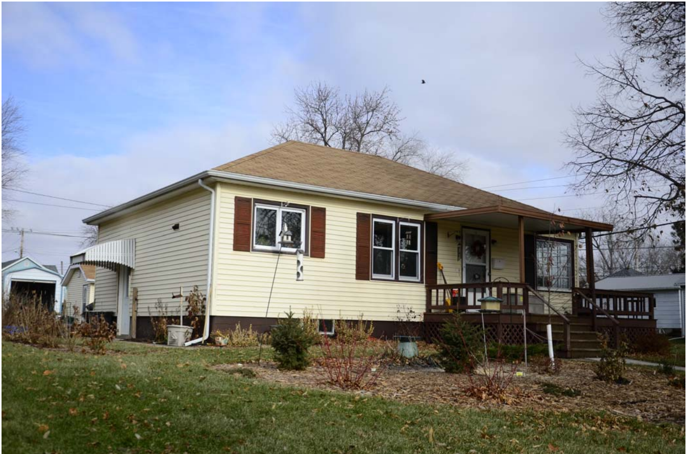
Photograph 92-00793-001 - House, looking northeast (December 2014)