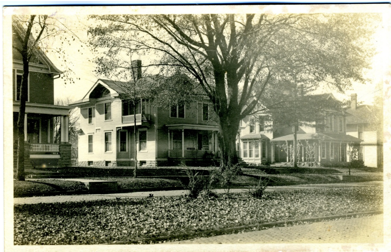
509 W. Washington