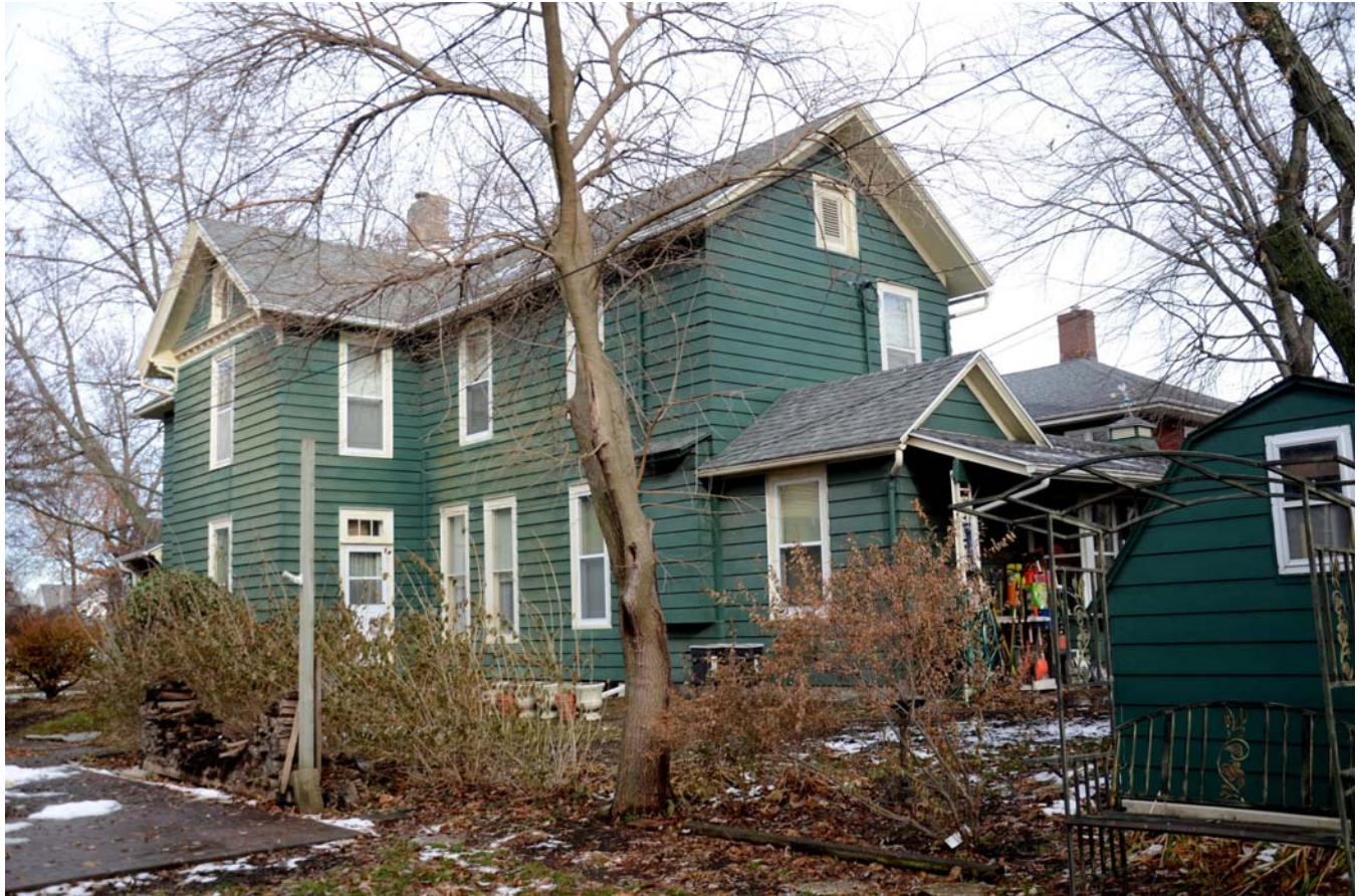
Photograph 92-00375-003 - House, looking northeast (December 2014)