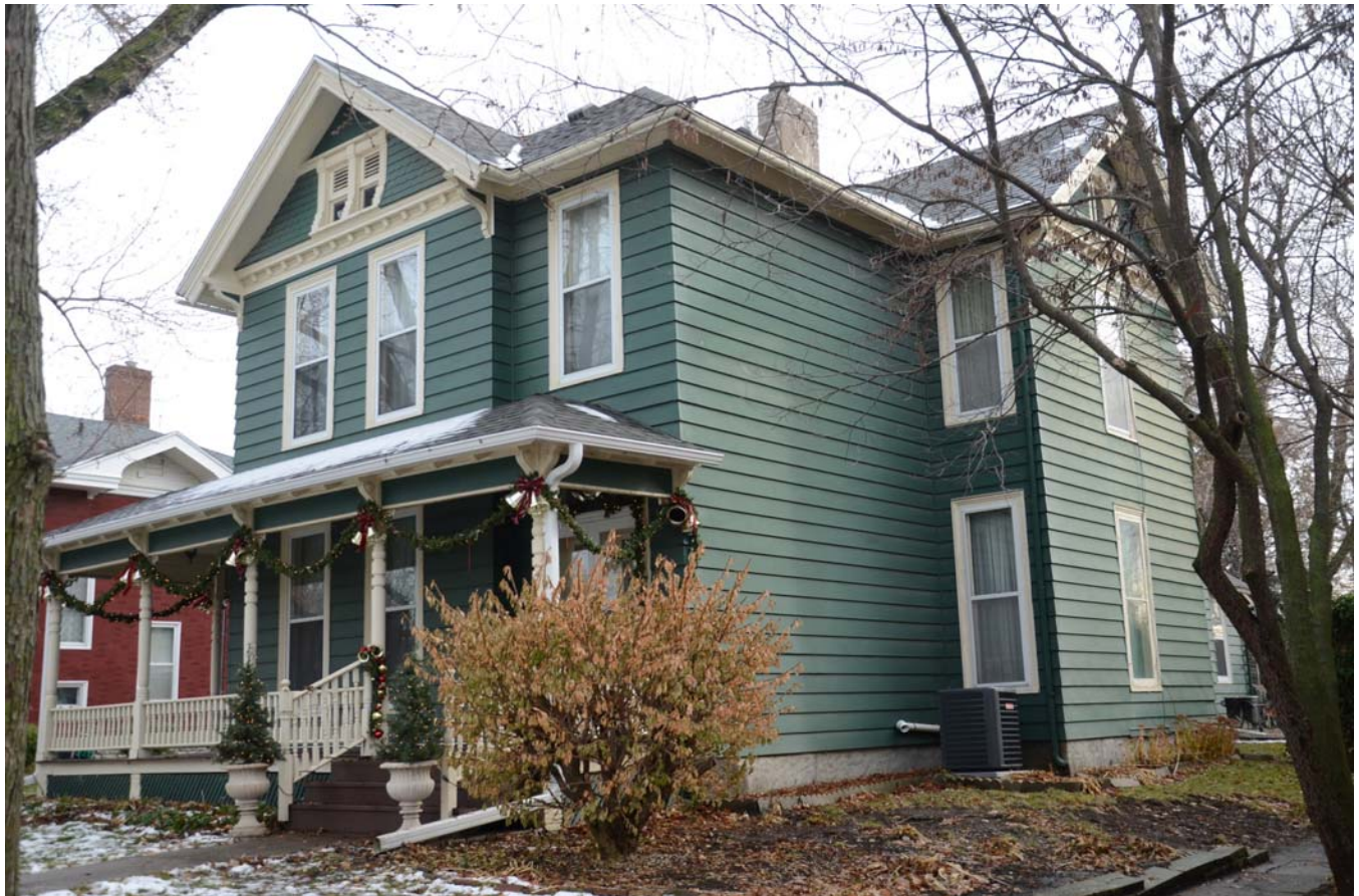
Photograph 92-00375-001 - House, looking southeast (December 2014)