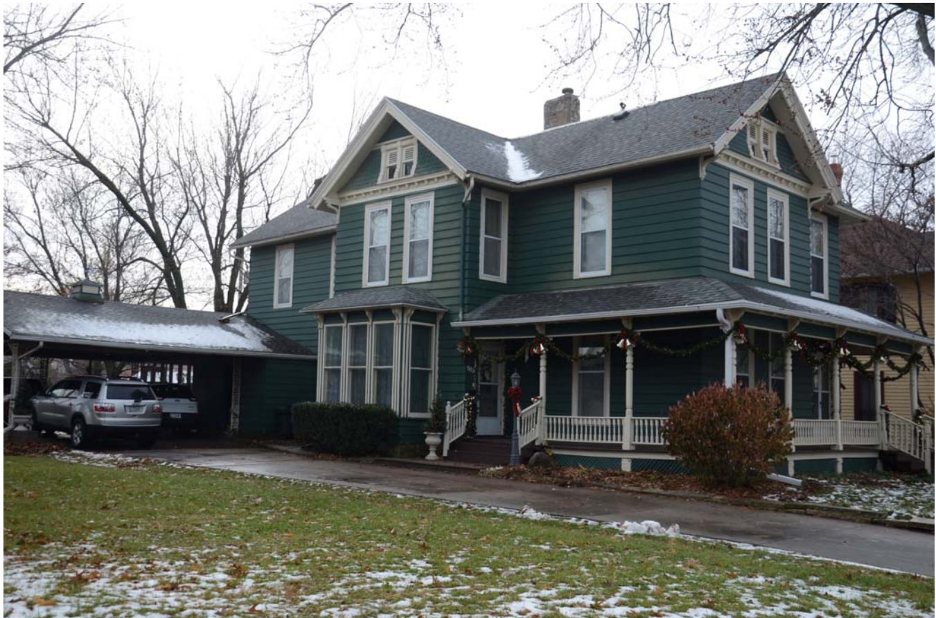
Photograph 92-00375-002 - House, looking southwest (December 2014)