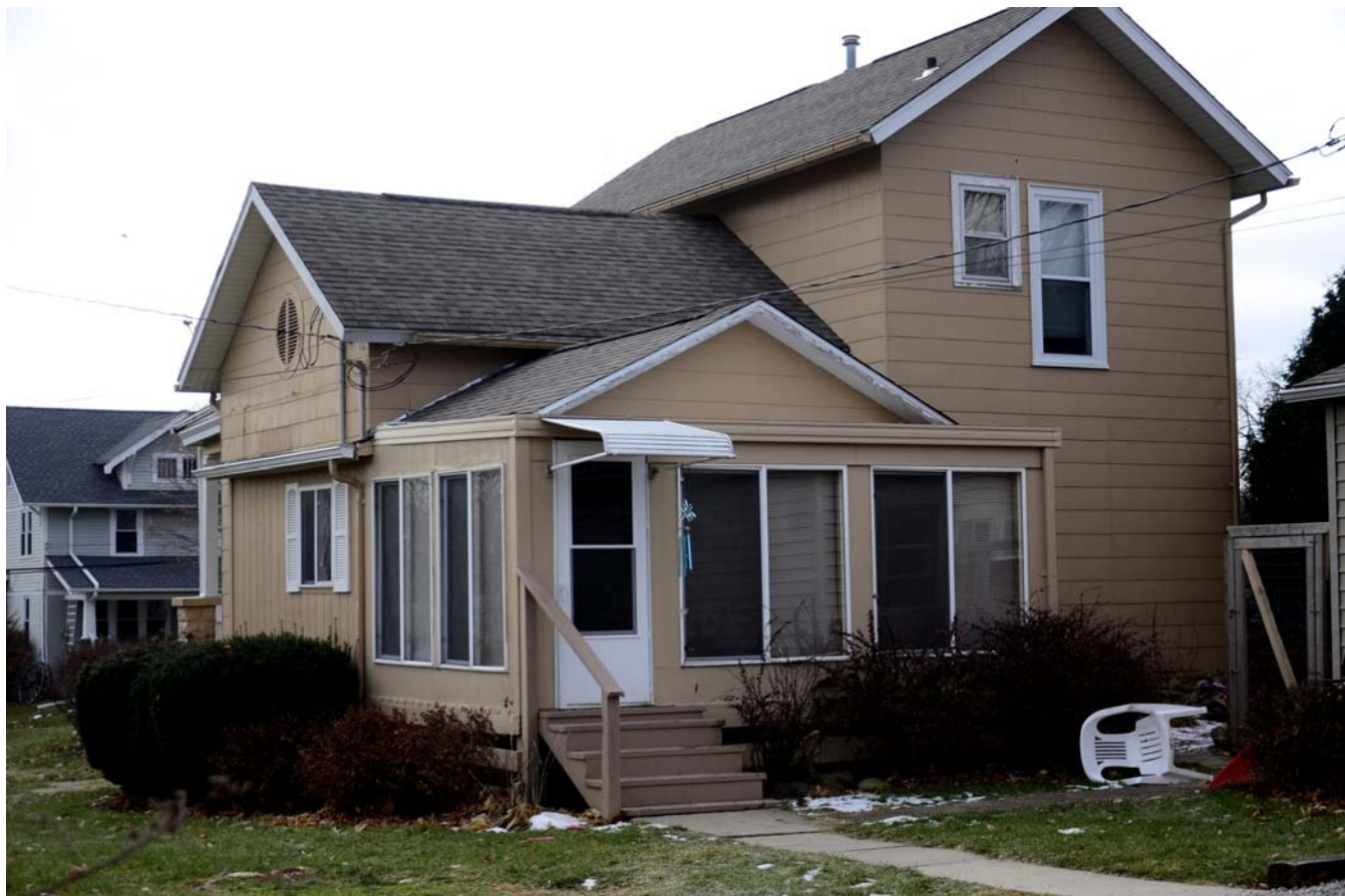
Photograph 92-00794-003 - House, looking southwest (December 2014)