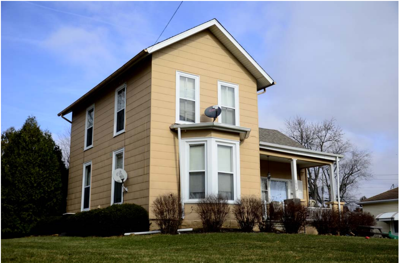
Photograph 92-00794-002 - House, looking northeast (December 2014)