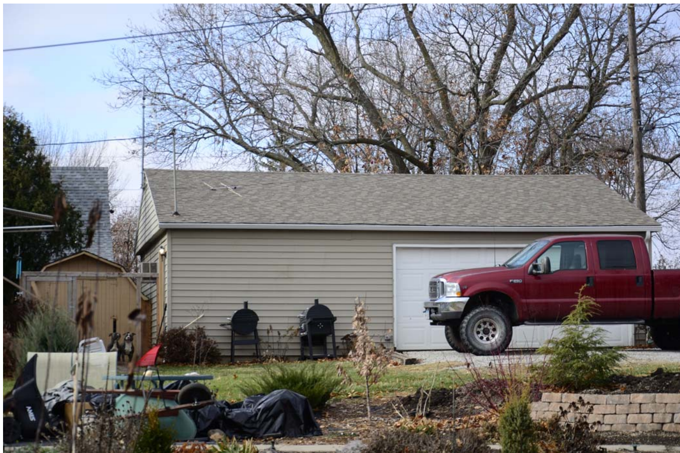
Photograph 92-00794-004 - Garage, looking west (December 2014)