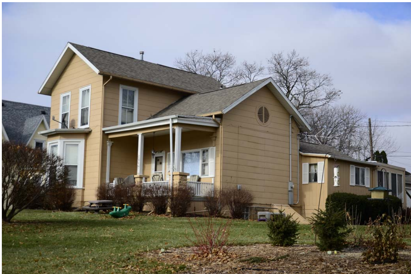
Photograph 92-00794-001 - House, looking northwest (December 2014)