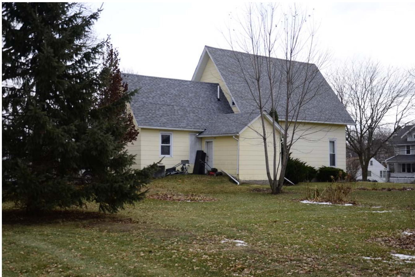
Photograph 92-00794-002 - House, looking southeast (December 2014)