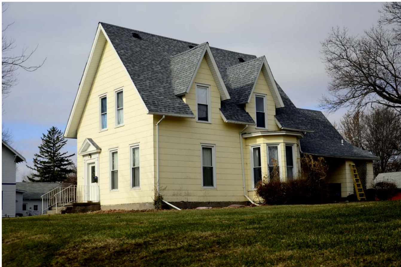
Photograph 92-00795-001 - House, looking northwest (December 2014)