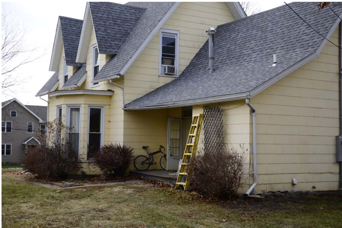
Photograph 92-00794-003 - House, looking southwest (December 2014)