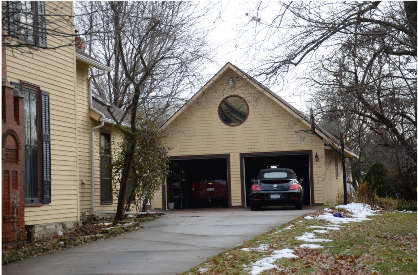
Photograph 92-00376-005 - Garage, looking southwest (December 2014)