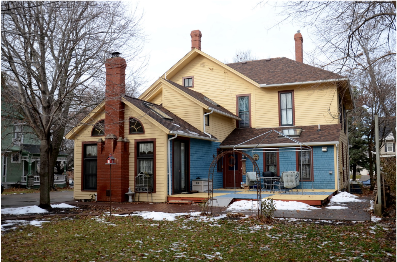
Photograph 92-00376-004 - House, looking northwest (December 2014)