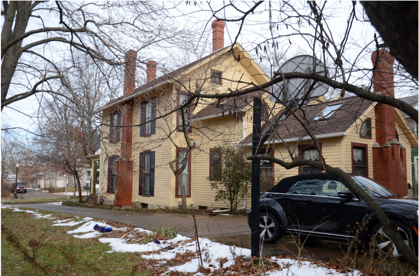
Photograph 92-00376-003 - House, looking northwest (December 2014)