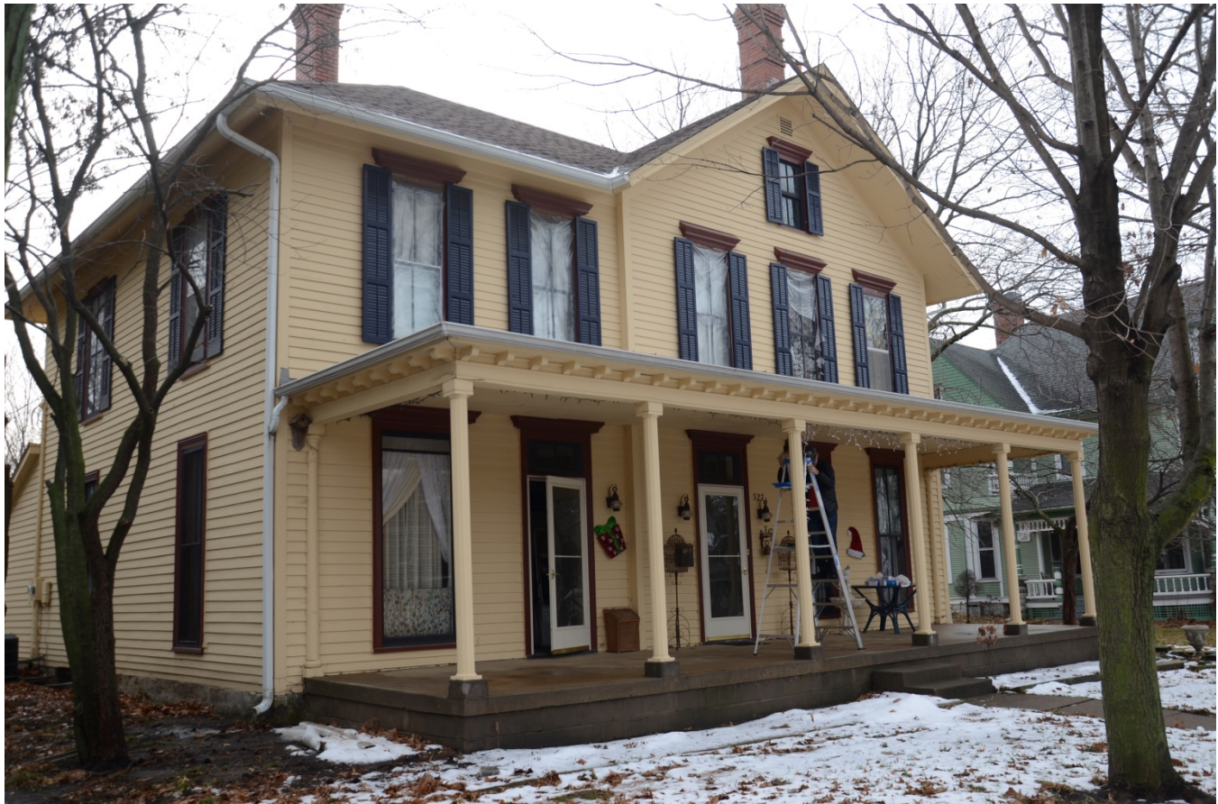
Photograph 92-00376-002 - House, looking southwest (December 2014)