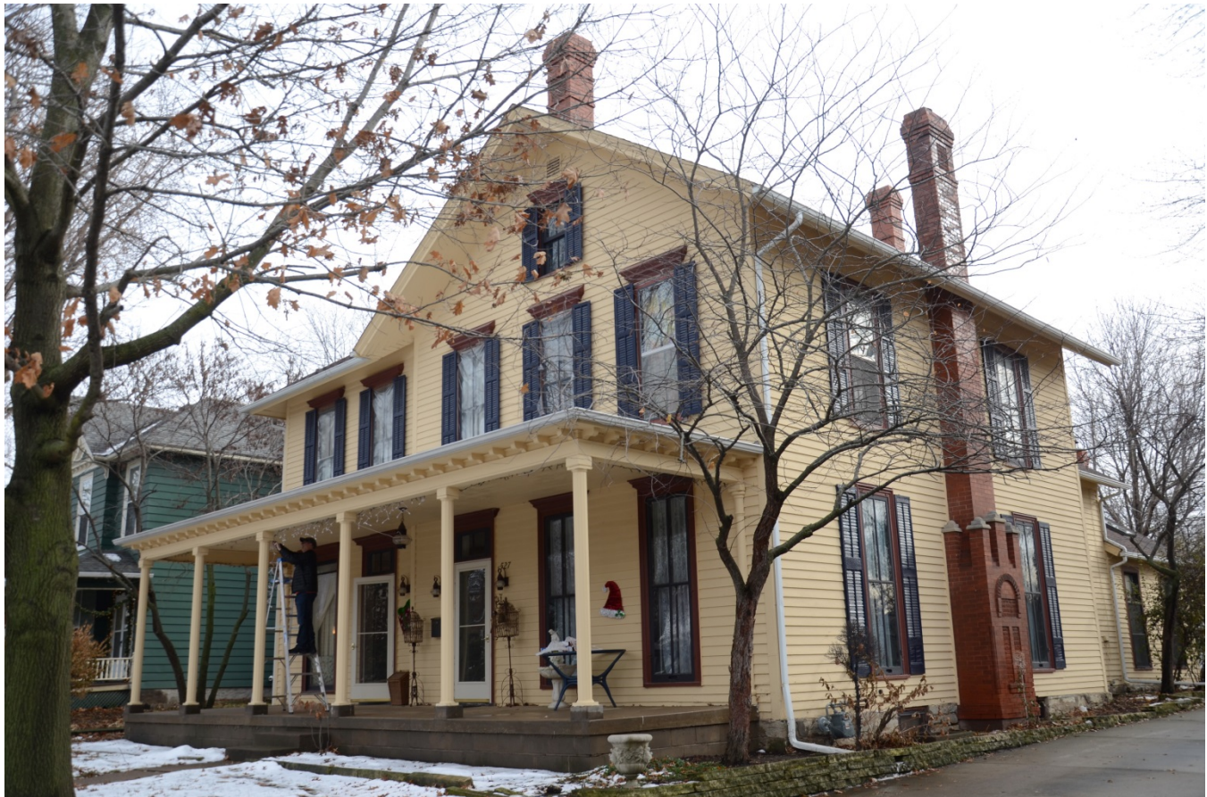
Photograph 92-00376-001 - House, looking southeast (December 2014)