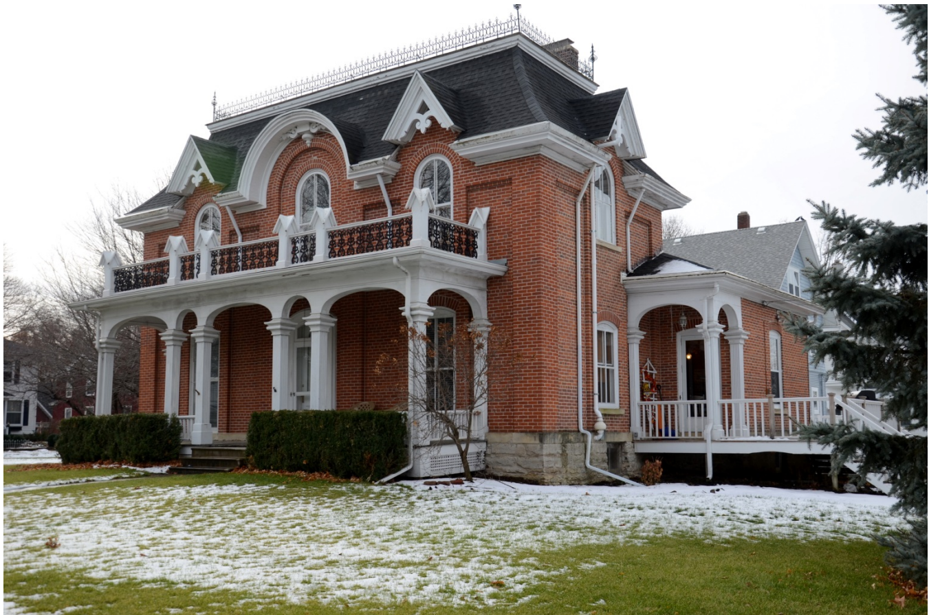
Photograph 92-00179-001 - House, looking southwest (December 2014)