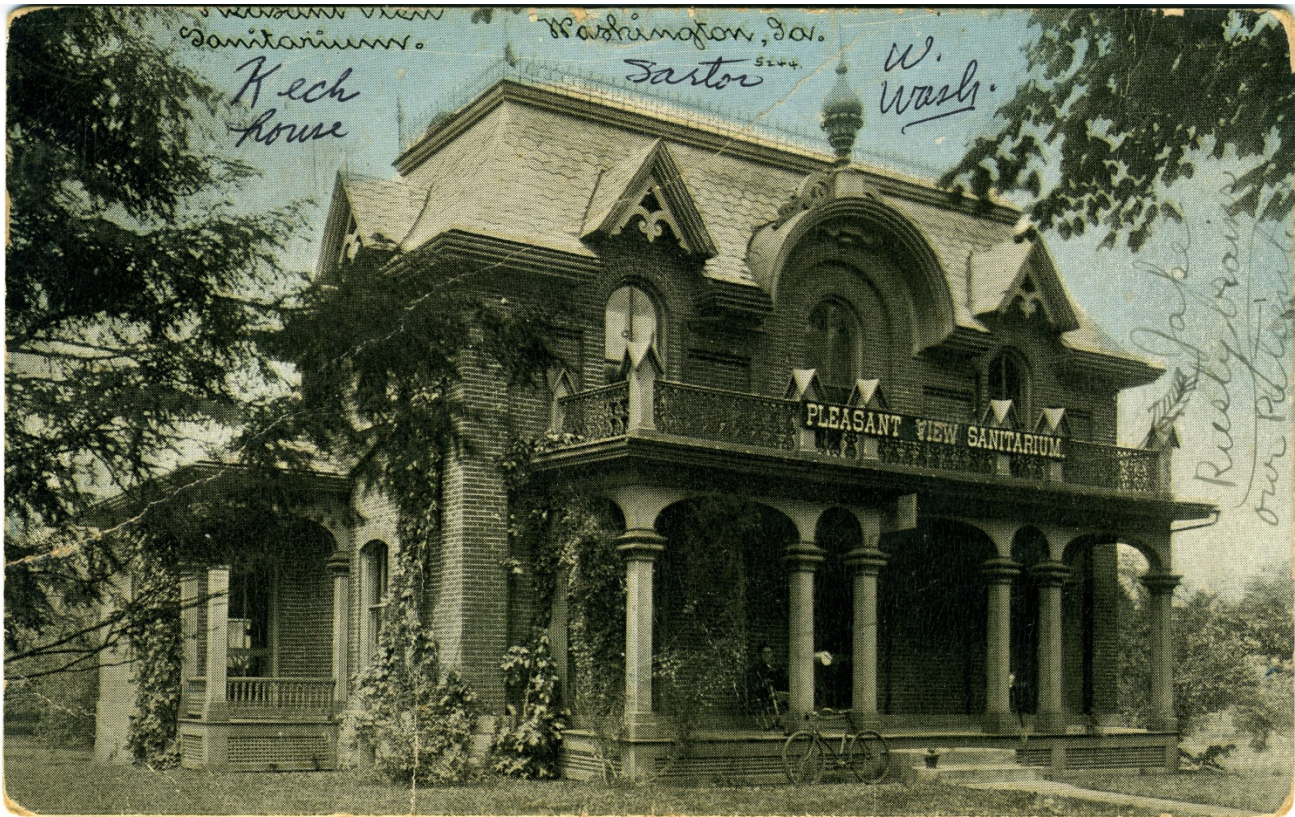
House in early 1900s