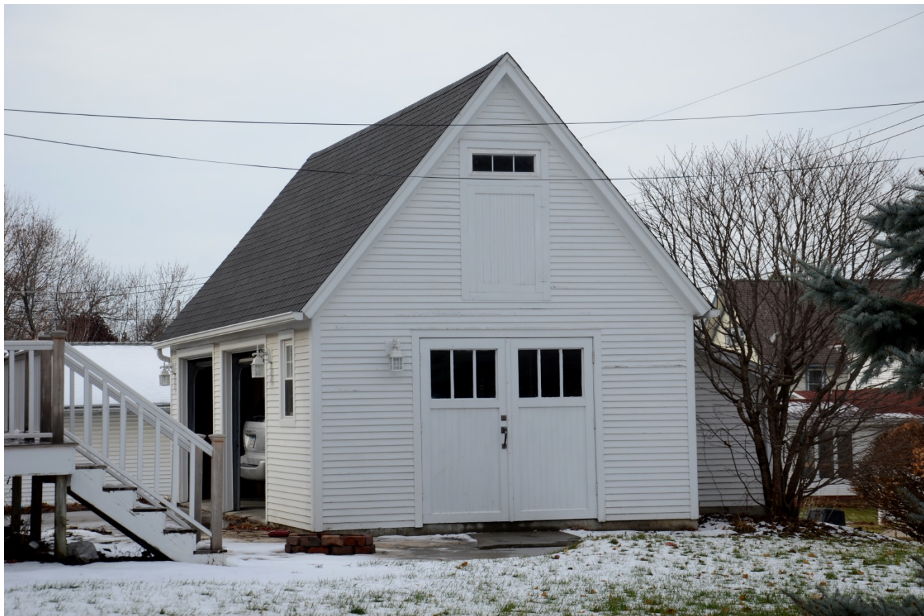
Photograph 92-00179-004 - Garage, looking west (December 2014)