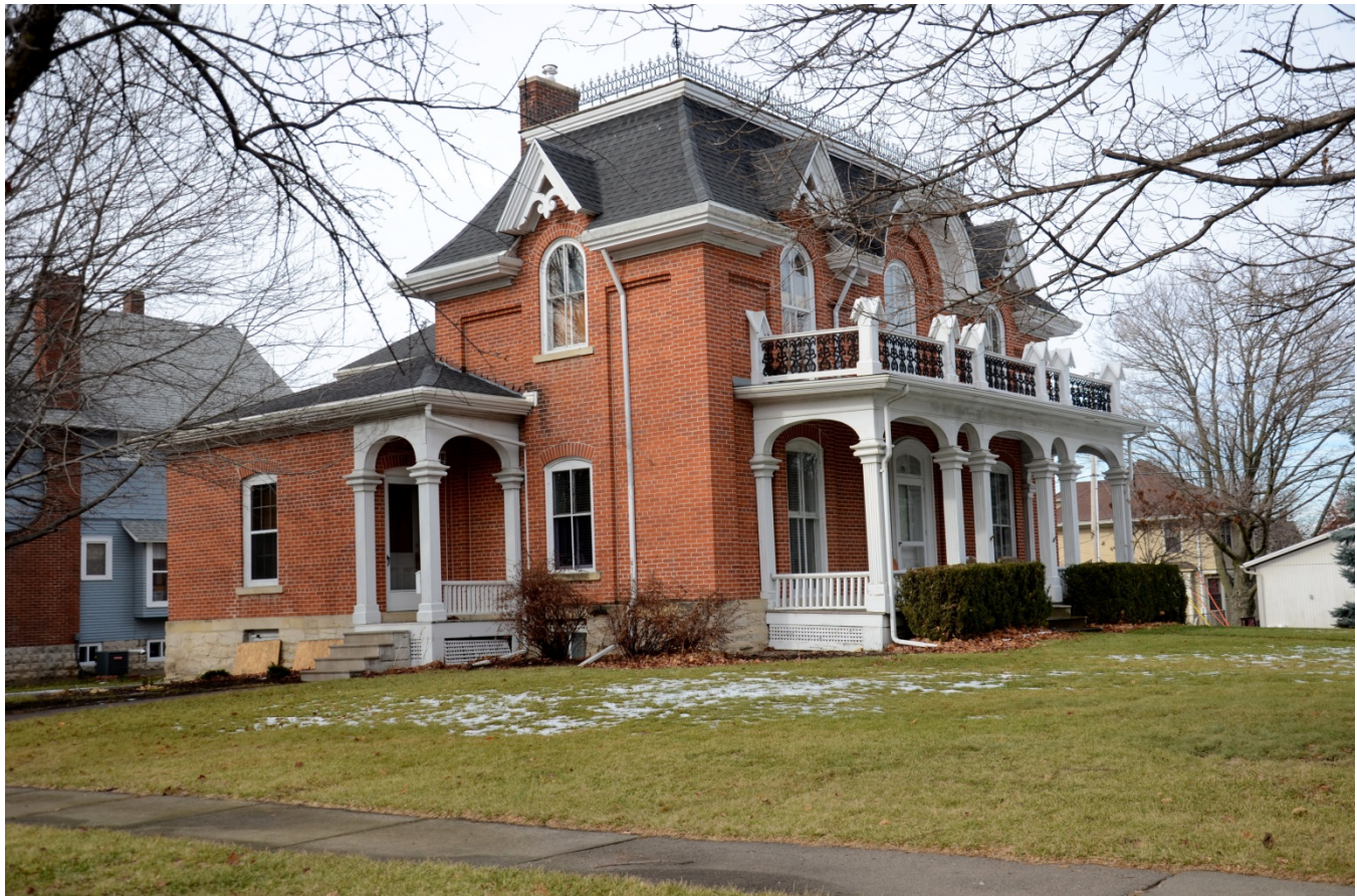
Photograph 92-00179-002 - House, looking northwest (December 2014)