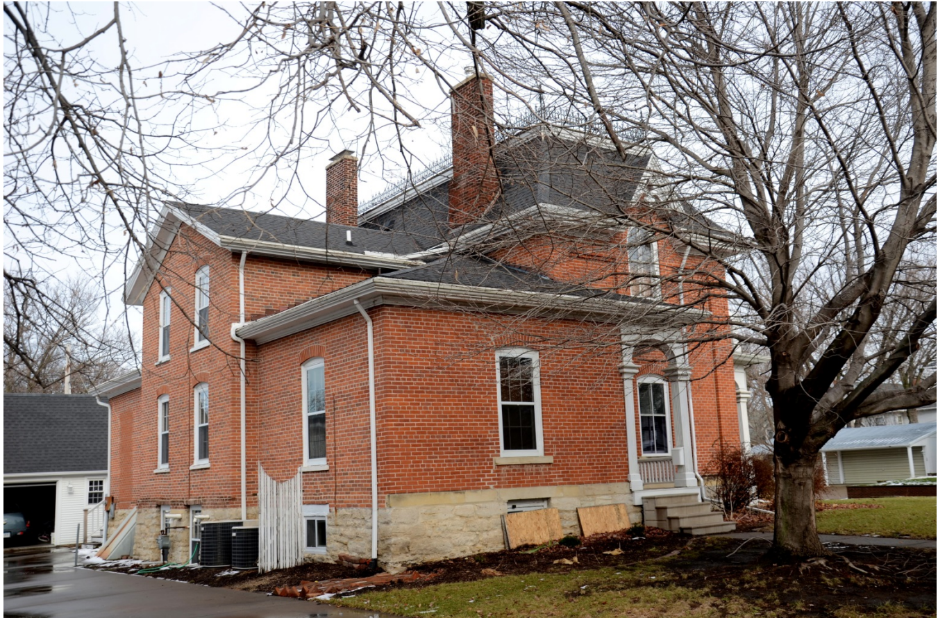
Photograph 92-00179-003 - House, looking northeast (December 2014)