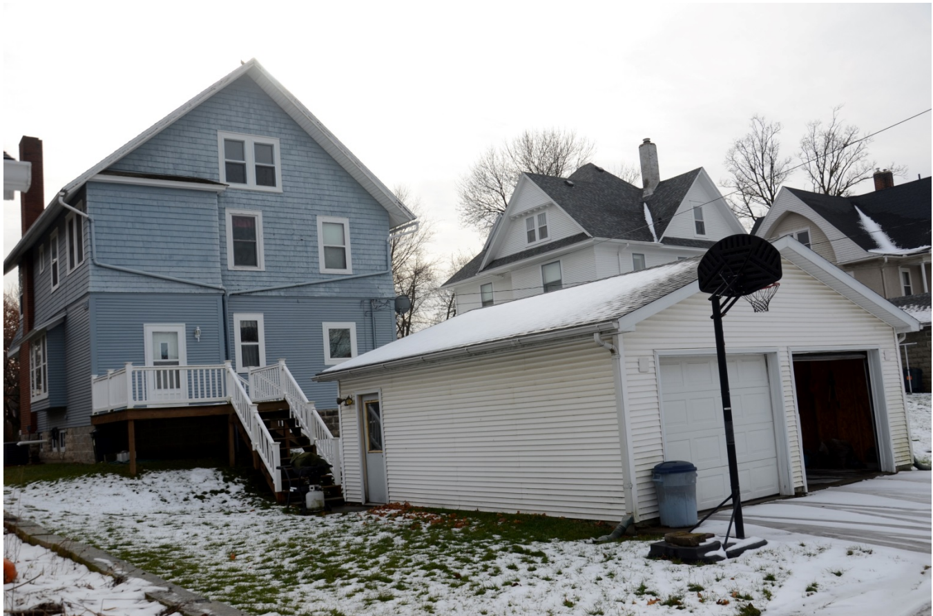
Photograph 92-00390-003 – House and garage, looking southwest (December 2014)