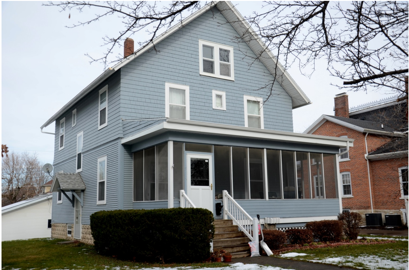
Photograph 92-00390-001 - House, looking northeast (December 2014)