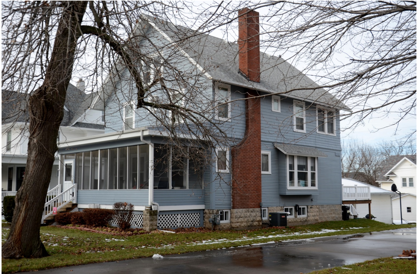
Photograph 92-00390-002 - House, looking northwest (December 2014)