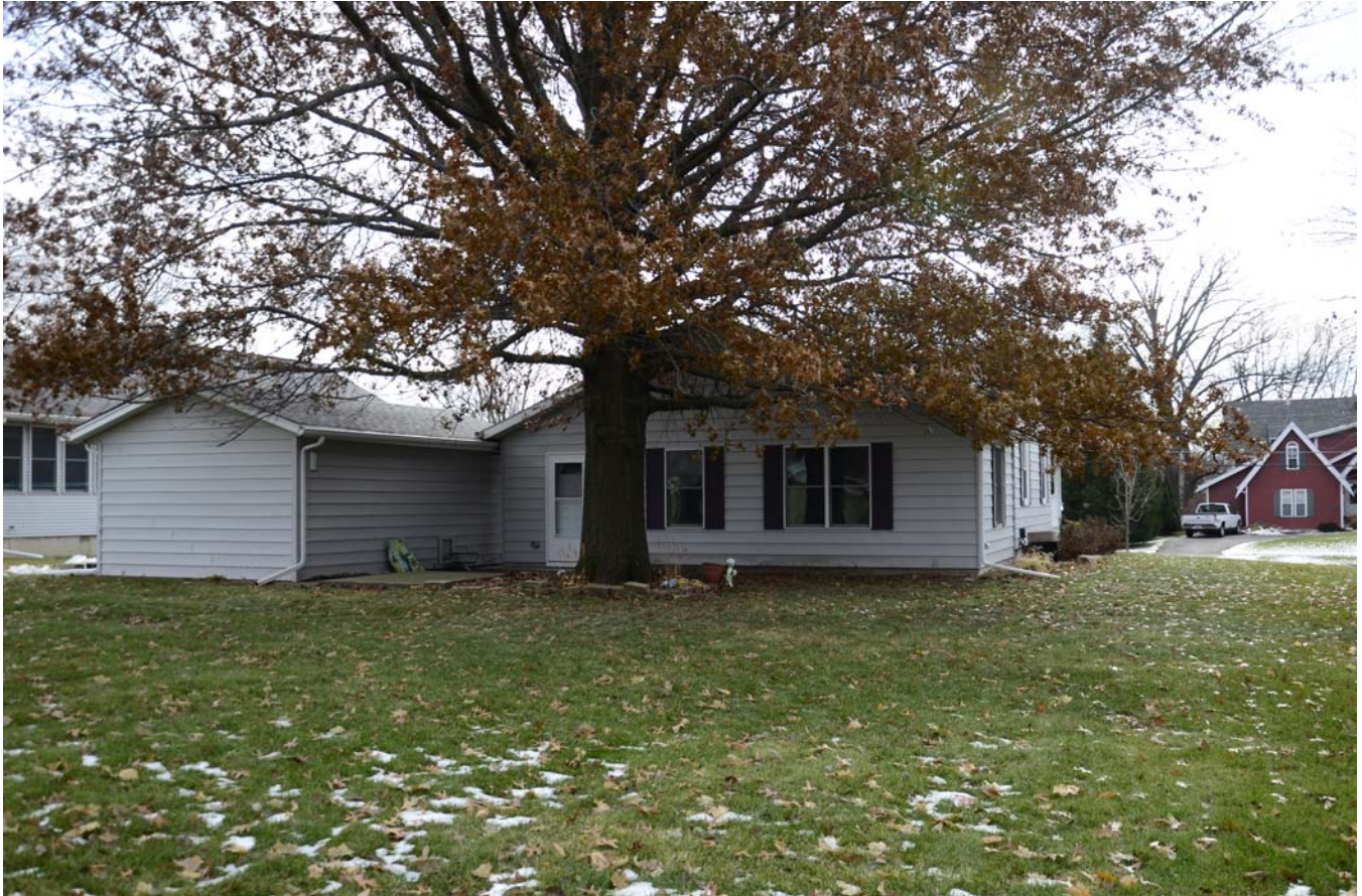
Photograph 92-00798-002 - House, looking south (December 2014)