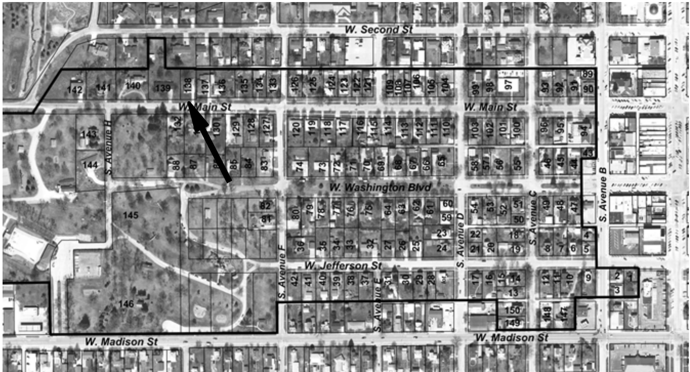
2009 aerial photograph (Washington County) – line indicates survey/research area boundary