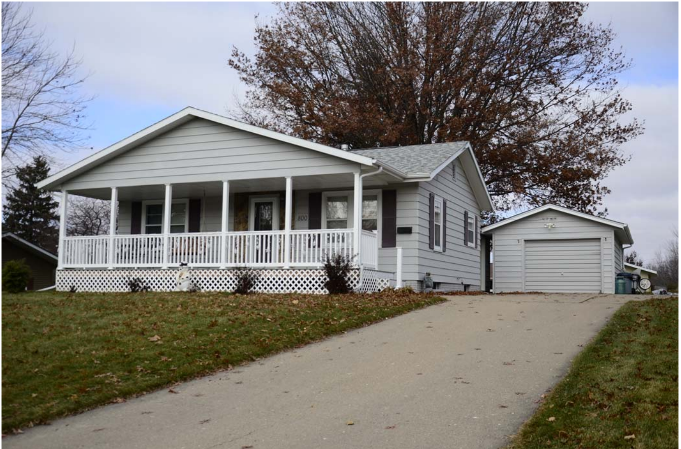
Photograph 92-00798-001 - House and garage, looking northwest (December 2014)